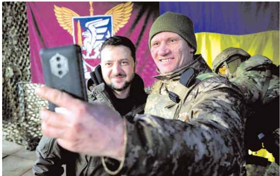
Ukrainian soldier takes a selfie with President Volodymyr Zelenskyy, left, during his visit to Slavyansk, Donbas region, Ukraine on Tuesday

Jaishankar's assertion came during his talks with visiting German counterpart Annalena Baerbock. "The European Union from February to November have imported more fossil fuel from Russia than the next 10 countries combined. The oil import in the European Union is six times what India has imported, gas is infinite times because we don't import it," he said.