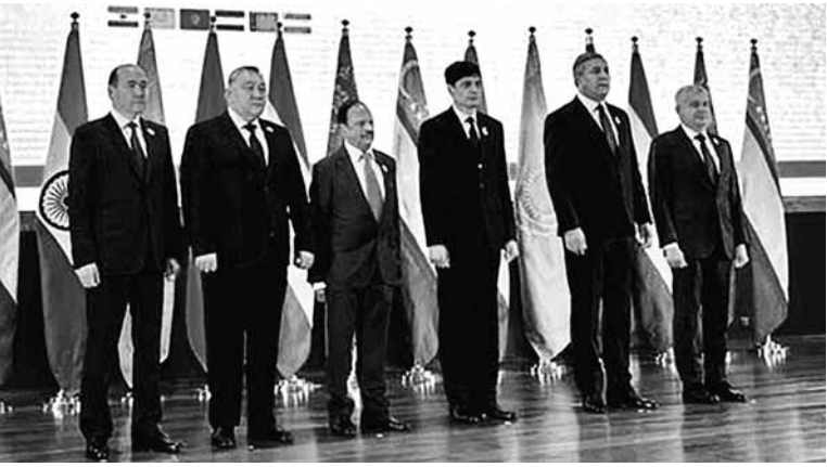
National Security Adviser Ajit Doval with Afghanistan's Ambassador to India Farid Mamundzay Farid Mamundzay and other delegates during the first India-Central Asia meeting of National Security Advisers and Secretaries of Security Councils, in New Delhi on Tuesday

Doval also said all United Nations(UN) member states should refrain from providing any form of support to entities or persons involved in terrorist acts and fulfill the obligations enshrined in relevant counter-terror