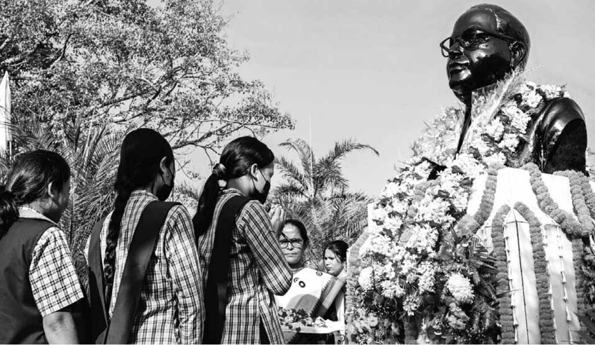
School students pay tribute to Babasaheb BR Ambedkar on his death anniversary, in Agartala on Tuesday

On October 3, 2021, eight people were killed in Tikunia in Lakhimpur Kheri during violence that erupted when farmers were protesting against Uttar Pradesh Deputy Chief Minister Keshav Prasad Maurya's visit to the area.