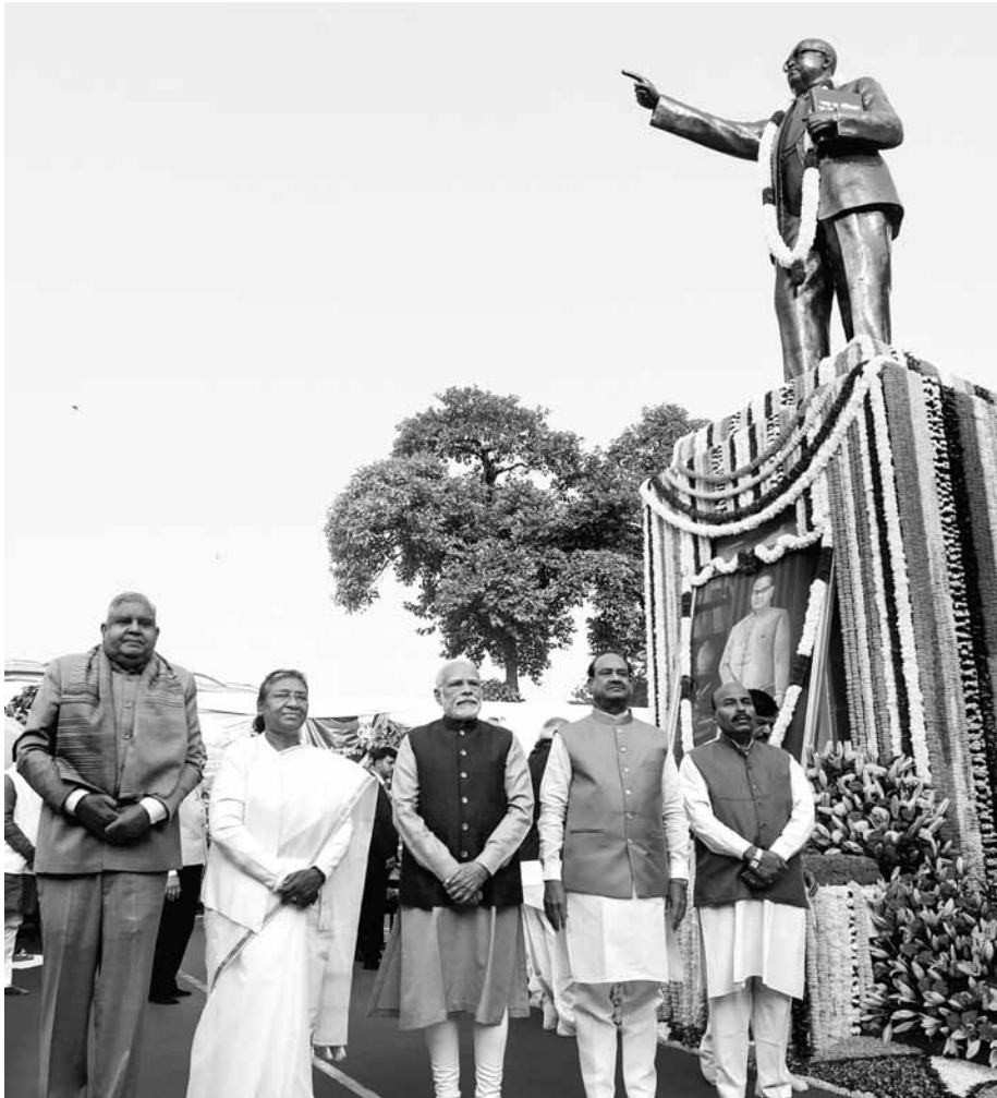
President Droupadi Murmu with Vice-President Jagdeep Dhankhar, Prime Minister Narendra Modi, Lok Sabha Speaker Om Birla and Union Minister for Social Justice & Empowerment Virendra Kumar at a ceremony to pay homage to Babasaheb BR Ambedkar on his Mahaparinirvan Diwas, at Parliament House Complex in New Delhi on Tuesday

The Congress’ unit for farmers also reiterated the demand for dismissal of Union Minister of State for Home Ajay Mishra Teni over the Lakhimpur Kheri violence, release of “innocent” farmers imprisoned in the case, withdrawal of “fake cases” registered against farmers in various states during the farmers’ agitation and compensation to families of the deceased farmers.