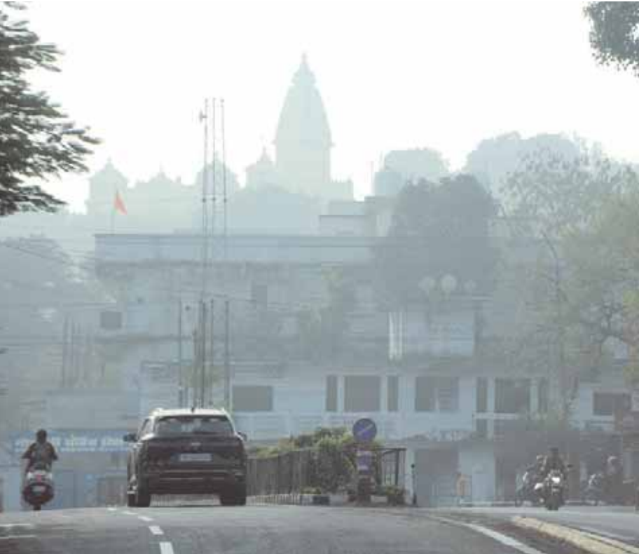
Vehicles ply on the road amid haze on a winter morning in Bhopal on Tuesday.