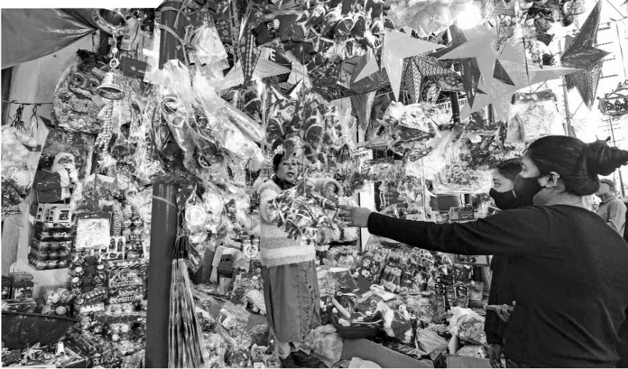
Young women shop for Christmas decoration articles at a market, in Guwahati