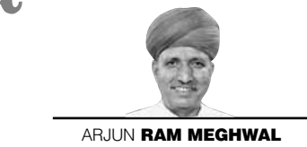
ARJUN RAM MEGHWAL

The awakened conscience of the followers of Dr. Ambedkar remained fully intact to check the long-drawn insensitivity of the congress-led dispensation. It was in 1989 that VP Singh’s government, externally supported by BJR, came to power, and Atal Bihari Vajpayee proposed to address this long pending grievance. A genuinely justified decision showed a path of light to the dark-ridden aspirations of fellow Ambedkarite, with the return of Dr Ambedkar’s Portrait in the Central Hall.