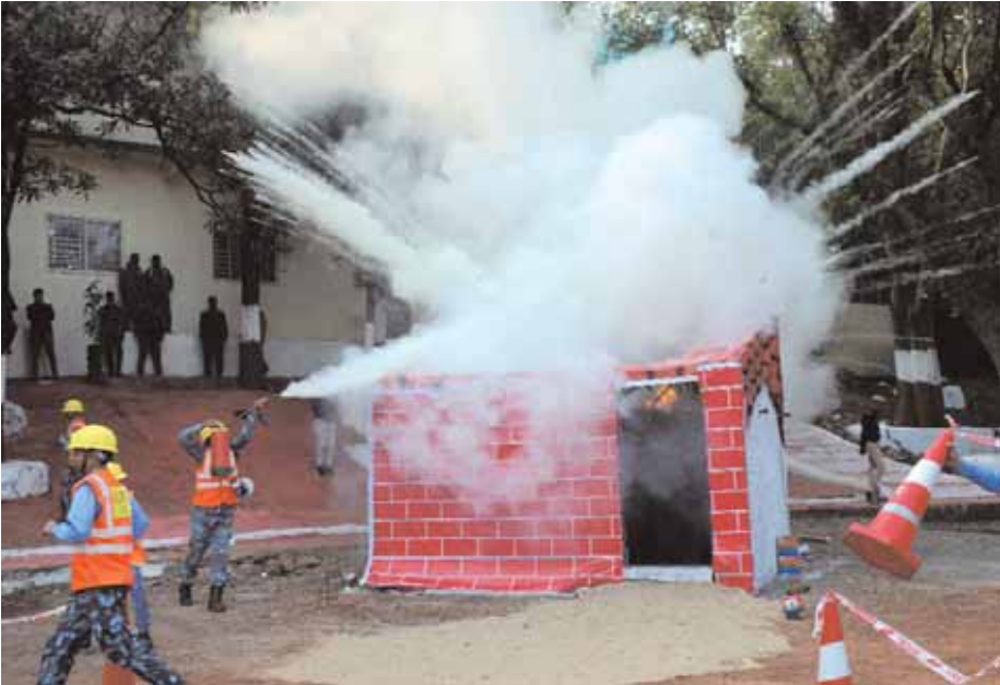
State Disaster Emergency Response Force (SDERF) personnel in a rescue operation during a mock drill on 76th Raising Day celebrations of Madhya Pradesh Home Guards, Civil Defence and Disaster Management in Bhopal on Tuesday.