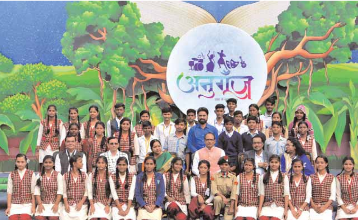
Madhya Pradesh Chief Minister Shivraj Singh Chouhan during a group photo session with the students of Government schools a day after cultural programme 'Anugoonj' at school of excellence in Bhopal on Tuesday.

When the police investigated, it was clear that calls were not made to the doctor from the CM's office and house and 4 teams were formed for investigation. It was learned that the accused threatened the doctor by spoofing the call number. By tracing the number, the police arrested both the accused.