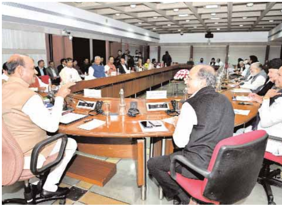
Lok Sabha Speaker Om Birla holds a Business Advisory Committee meeting with all-party leaders on the eve of the start of Parliament's Winter Session, in New Delhi, on Tuesday