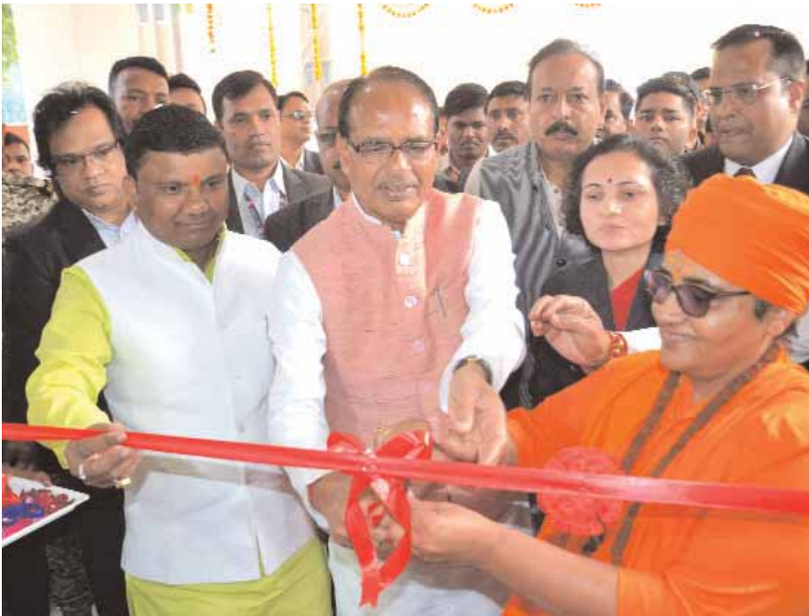
CM Shivraj Singh Chouhan and BJP MP Sadhvi Pragma Singh Thakur inaugurate Panchakarma Super Speciality and Wellness Centre at Pandit Khushilal Sharma Government Ayurveda Institute in Bhopal on Tuesday.