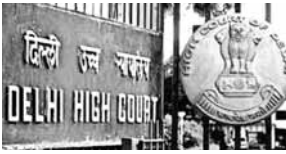
Delhi High Court

The petitioner had said during her ultrasounds till the 16th week of gestation period, no abnormalities were found in the foetus but on November 12, an abnormality was observed in the foetus. The court clarified that prior to undergoing termination, the informed consent of the petitioner would be