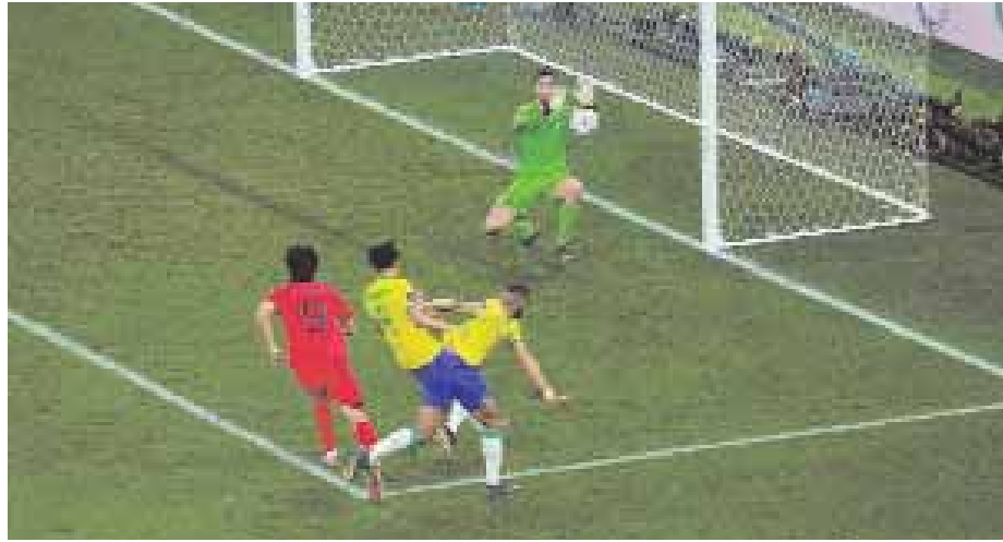
Brazil's goalkeeper Alisson saves the ball during the World Cup round of 16 soccer match against South Korea

Even coach Tite got in on the act, joining Richarlison for