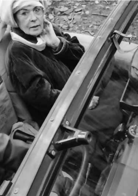
Congress leaders Sonia Gandhi and Rahul Gandhi during a safari, at Ranthambore National Park in Sawai Madhopur, Rajasthan

In Viramgam constituency, which was represented by Congress in assembly, people greeted Yogi with chants of Jai Shri Ram, and after Yogi’s appeal to vote for BJP, they voted en masse for the party following which Hardik Patel won there by the margin of 51,707 votes.