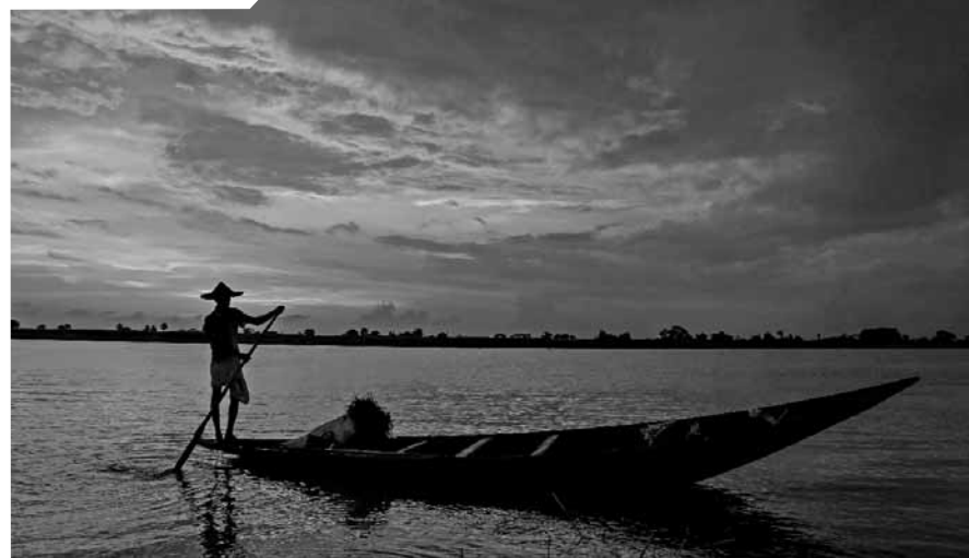
A fisherman rows across the Hooghly river during sunset, in Nadia district