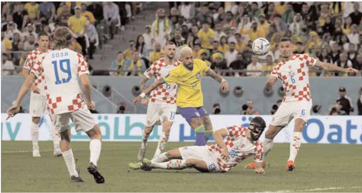
Brazil's Neymar, centre, kicks the ball besides Croatia's Josko Gvardiol, bottom, Croatia's Dejan Lovren, right, Croatia's Marcelo Brozovic, background, and Croatia's Borna Sosa, left, during the World Cup quarterfinal soccer match between Croatia and Brazil, at the Education City Stadium in Al Rayyan, Qatar, on Friday

Croatia will next face either Argentina or the Netherlands to try to return to the World Cup final four years after los-