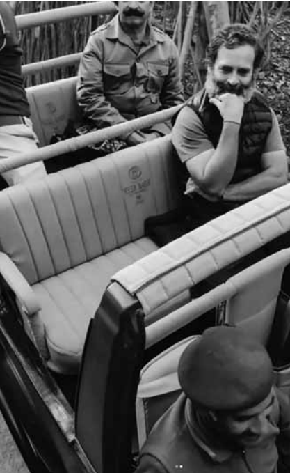
Congress leaders Sonia Gandhi and Rahul Gandhi during a safari, at Ranthambore National Park in Sawai Madhopur, Rajasthan