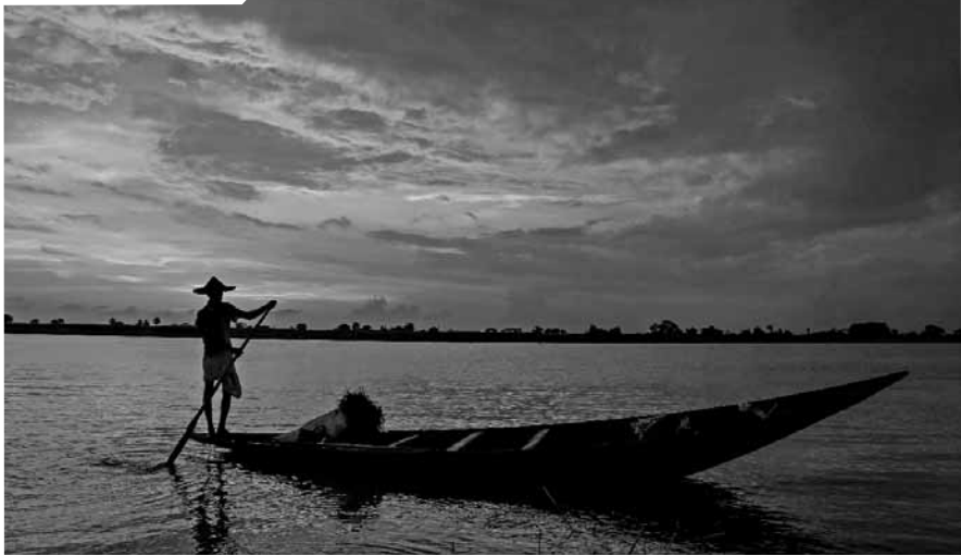
A fisherman rows across the Hooghly river during sunset, in Nadia district