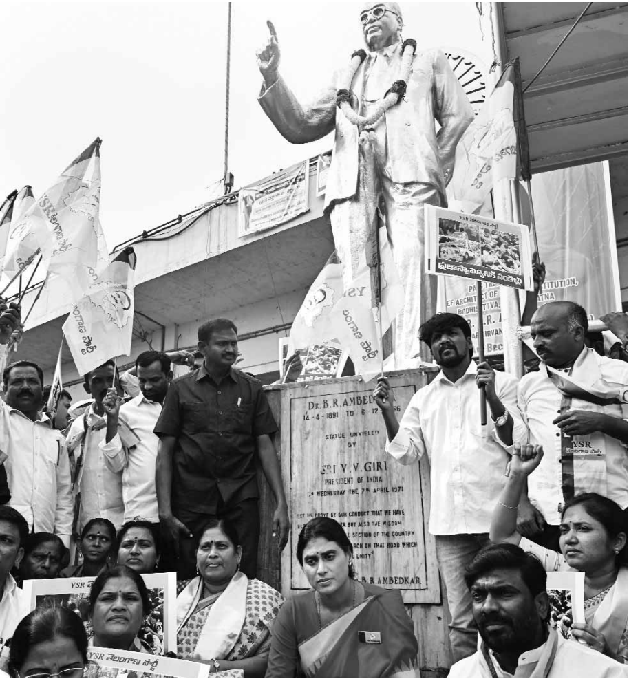
YSR Telangana Party president YS Sharmila with supporters stages a protest after reportedly denial of permission for her 'padayatra', in Hyderabad on Friday

The complainant (a candidate) had alleged that the accused (a teacher of the institute) was in possession of questions for the said examination disclosing leakage of paper by him in connivance with unknown officials of APPSC.