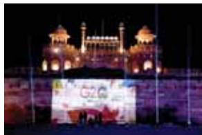
India's G-20 logo on display on the rampart of Red Fort in New Delhi

He also said India's G-20 presidency was taking place at a very critical moment in international affairs and it was particularly vital that world leaders focus on the right issues, especially those that affect the more vulnerable sections of the world. Underlining these crucial endeavours while addressing the first event of India's presidency of the combine in the shape of the G-20 University Connect Initiative, Jaishankar said India will strive to emerge as the voice of the global south — comprising Asia, Africa and Latin America — that has to face the brunt of