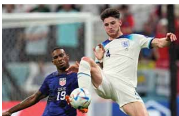
England's Declan Rice, right, kicks the ball past Iran's Mehdi Taremi during the World Cup group B soccer match between England and Iran at the Khalifa International Stadium in Doha

The World Cup is being staged during the months of November and December for this first time in its history because temperatures can reach in excess of 100 F (37 C) in Qatar during the summer. That has meant a disruption to the Premier League and top flight domestic competitions in other countries, with players thrust into the intensity of a World Cup just a few months into the season.