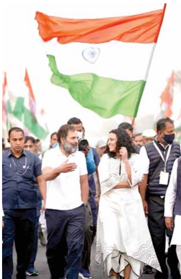
Congress leader Rahul Gandhi with Bollywood actor Swara Bhasker during the party's 'Bharat Jodo Yatra', in Ujjain on Thursday