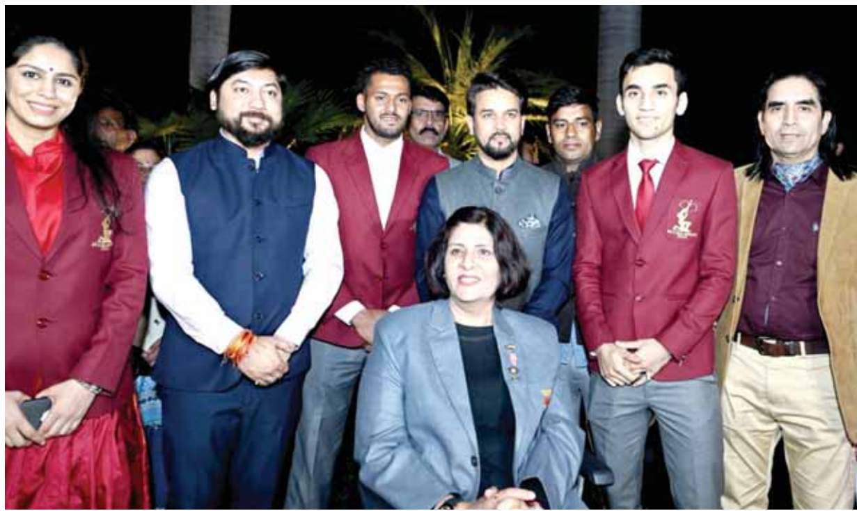
Union Youth Affairs, Sports and Information and Broadcasting Minister Shri Anurag Thakur with National Sports Awards winners in New Delhi on Wednesday night.