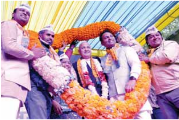
Delhi Deputy CM Manish Sisodia campaigns for MCD elections at Trilokpuri in New Delhi on Thursday

All sanitation workers will receive their salaries on time and all contractual workers will be made permanent," he said. "CM Arvind Kejriwal