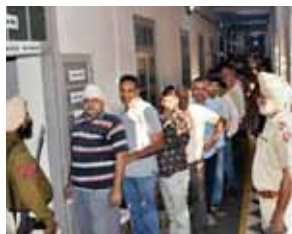
People wait in a queue to cast their votes during the first phase of Gujarat Assembly elections, in Rajkot on Thursday

Bhavnagar in Saurashtra region recorded the lowest turnout of 51.34 per cent.