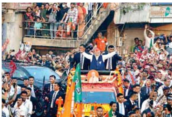
Prime Minister Narendra Modi during an election campaign roadshow for Assembly elections, in Ahmedabad on Thursday

Striking at the rival Congress for using "Ravan" jibe at him, the Prime Minister sought to put the Opposition party on the mat by asking the people to "teach the Congress