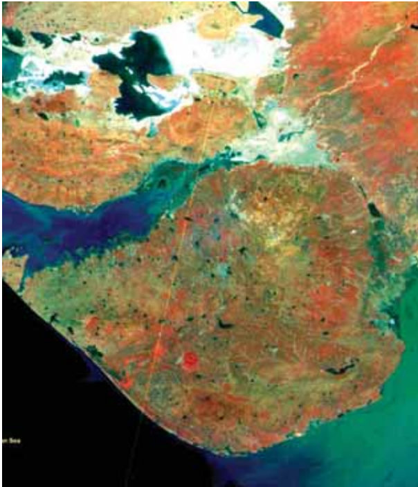
Prime Minister Narendra Modi shared breathtaking images from recently-launched EOS-06 satellite