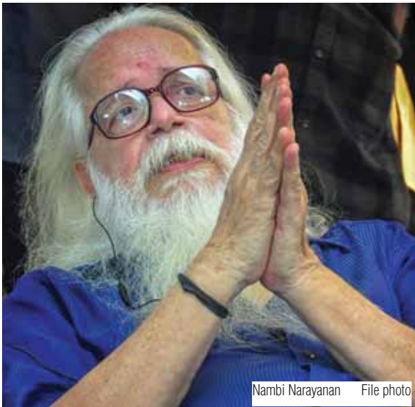
Nambi Narayanan File photo

"It is ultimately for the HC to pass orders. We request the HC to decide the anticipatory bail applications at the earliest preferably within four