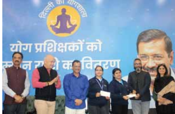
Delhi Chief Minister Arvind Kejriwal with Deputy Chief Minister Manish Sisodia, AAP MP Ashok Mittal and others during a felicitation event for the instructors of the 'Dilli Ki Yogshala' scheme, in New Delhi on Friday.

"When LG Sahab stopped the Yoga (classes), we felt very sad," Kejriwal said. Kejriwal said free yoga classes in the city