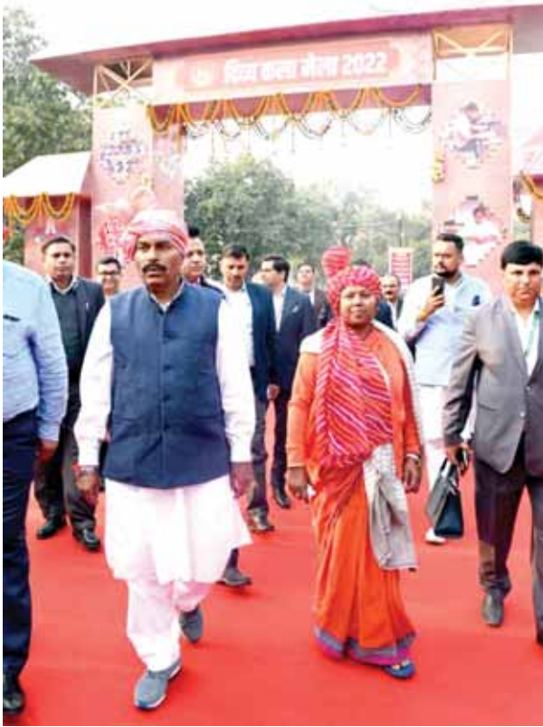
Vijendra Kumar, Union Minister of Social Justice and Empowerment and Pratima Bhoomik, Minister of State for Social Justice and Empowerment inaugurated the Divyang Kala Mela in New Delhi on Friday

The Minister also referred to the Prime Minister Narendra Modi's ambitious scheme, Daksh programme wherein training in skill upgradation and skill development is imparted to the entrepreneurs. The fair showcases a wide range of products such as home