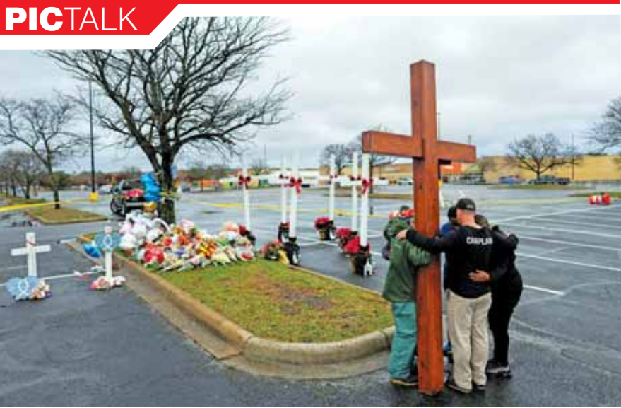
prayers being offered in a makeshift memorial in the parking lot of the Walmart Supercenter in Chesapeake, USA