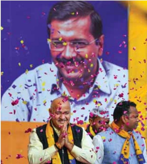
Delhi Deputy Chief Minister Manish Sisodia greets during an election campaign for the MCD elections, in New Delhi, Thursday

In a snappy wisecrack, he asked people to click selfies