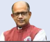
DR AMAR PATNAIK

It is time to ensure regulation of online gaming industry