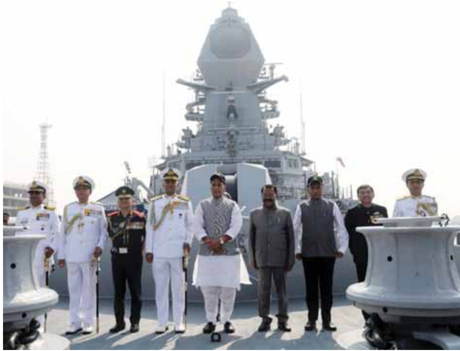
Defence Minister Rajnath Singh with Goa Governor PS Sreedharan Pillai, Chief Minister Pramod Sawant, CDS Gen Anil Chauhan, Chief of Naval Staff Admiral R. Hari Kumar and other Navy officials during the commissioning ceremony of INS Mormugao at the naval dockyard in Mumbai on Sunday

the Defence Minister described INS Mormugao as one of the most powerful indigenously-built warships which will significantly enhance the country's maritime capabilities and secure national interests.