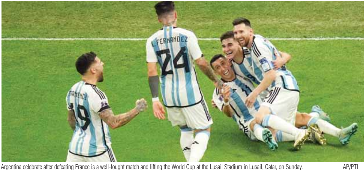
Argentina celebrate after defeating France in a well-fought match and lifting the World Cup at the Lusail Stadium in Lusail, Qatar, on Sunday.

losing team France will get $30 million from a FIFA prize fund of $440 million. When France won the World Cup in 2018, the country's federation got $38 million from FIFA's $400 million prize fund. Not all the money goes to players, but they are expected to get a good chunk of it. France players such as Kylian Mbappé are in line to be paid a bonus of $586,000 by their federation for winning the final, French sports daily L'Equipe reported. Every national soccer federation gets at least $9 million in prize money for playing at this year's World Cup, plus $1.5 million for each toward costs of preparing for the tournament. Third-place team Croatia earned $27 million.