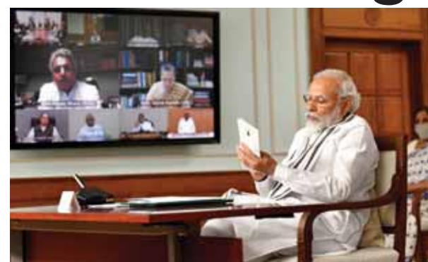
Rahul Gandhi's remarks evoked sharp reactions from the BJP, which said he was lowering the morale of the armed forces. In a statement in Parliament, Defence Minister Rajnath Singh had said Chinese troops tried to "unilaterally" change the status quo along the Line of Actual Control (LAC) in the Yangtse area of Arunachal Pradesh's Tawang sector on December 9, but the Indian Army compelled them to retreat with its "firm and resolute" response. The face-off took place amid the over 30-month border standoff between the two sides in eastern Ladakh.

Congress attack also comes after Rahul Gandhi said "the government was sleeping while China was preparing for war".