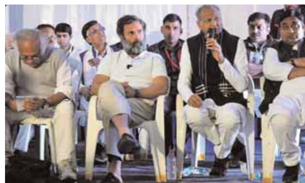
Congress leader Rahul Gandhi with Rajasthan Chief Minister Ashok Gehlot interacts with the representatives of civil society during the party's Bharat Jodo Yatra, in Dausa district on Sunday