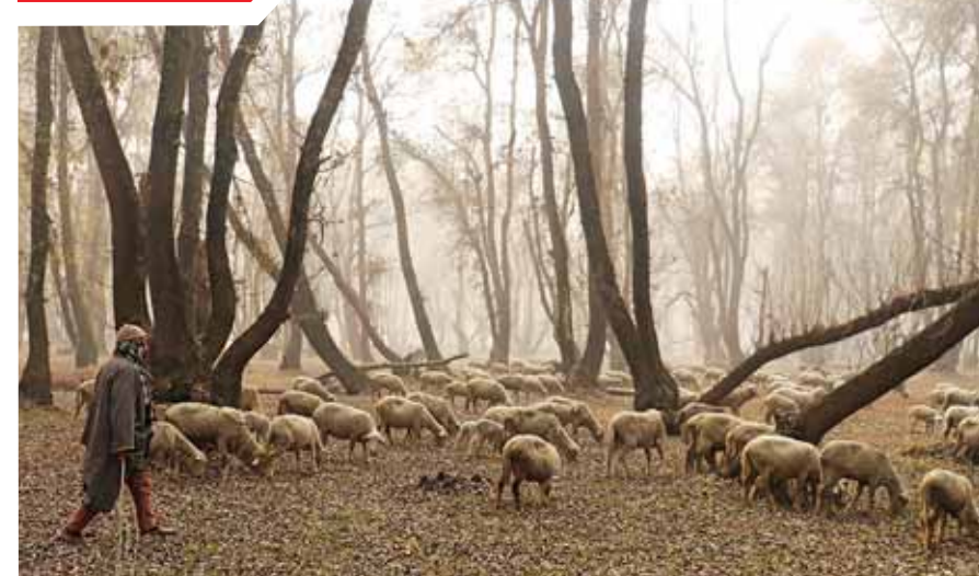
A shepherd guides his sheep during a cold winter day on the outskirts of Srinagar