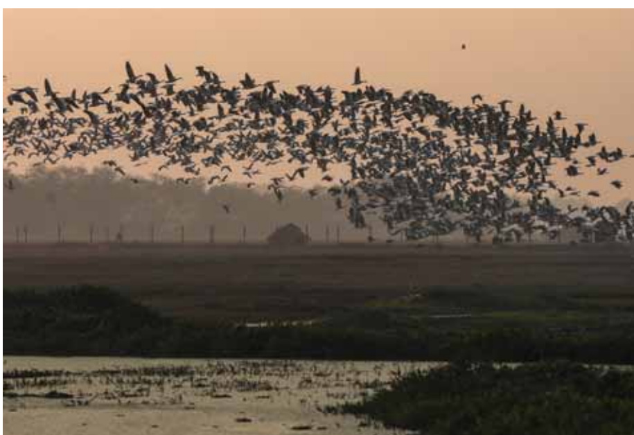
Bar-headed geese take flight at the Gharana wetland during sunset near the India-Pakistan international border at Ranbir Singh Pura, in Jammu on Sunday

He claimed that the AAP is the vehicle to bring change and make India a nation where nobody fights over religion and caste.