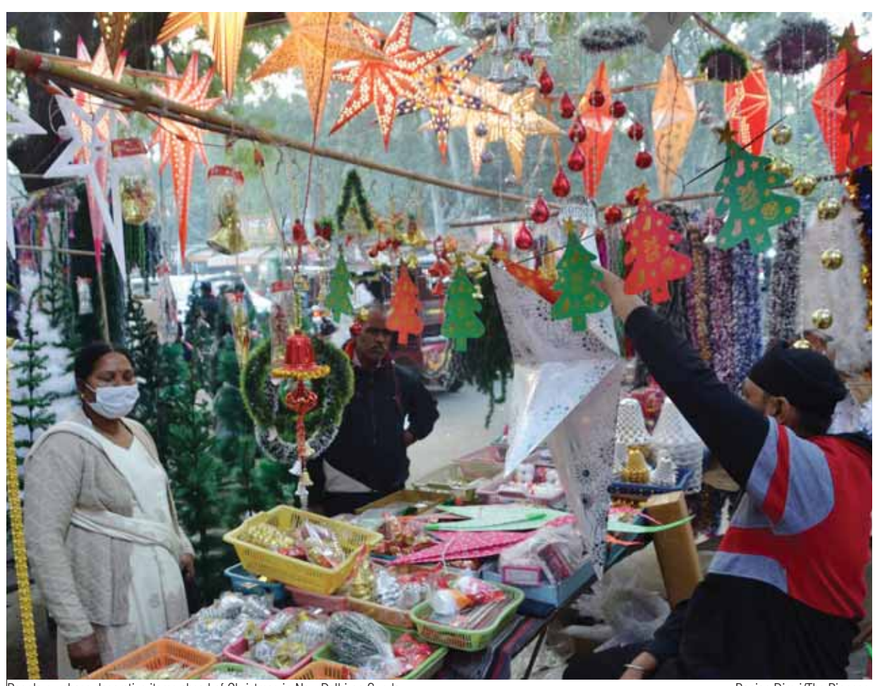
People purchase decorative items ahead of Christmas in New Delhi on Sunday.

"He was continued on other medical therapy of which the most important is anti-viral therapy. Patient was discharged after 20 days of hospitalisation in a stable condition and (after) one month of follow up, his ascites (water in stomach) completely resolved and jaundice had normalised," the doctor said.