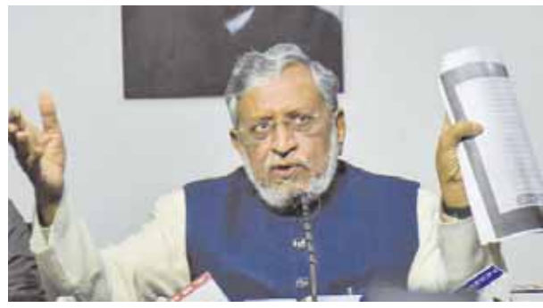
Former Bihar deputy chief minister and BJP MP Sushil Kumar Modi addresses a press conference regarding the recent hooch tragedy in Saran district, in Patna on Sunday