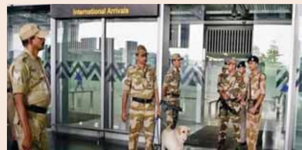
measures, including installing additional X-ray machines for baggage checks. The government official said that the BCAS is conducting the study to understand the immigration area at the airport and whether there is enough holding area for passengers during the immigration process. As per international standards, there are specified requirements in terms of holding area and the effort is to assess the situation, including with respect to passenger throughput, so that there is no congestion at immigration once international air travel

In recent weeks, domestic and international passengers have complained about congestion at the Indira Gandhi International Airport (IGA) that led to long queues and waiting hours. The situation has improved now, with the authorities putting in place various