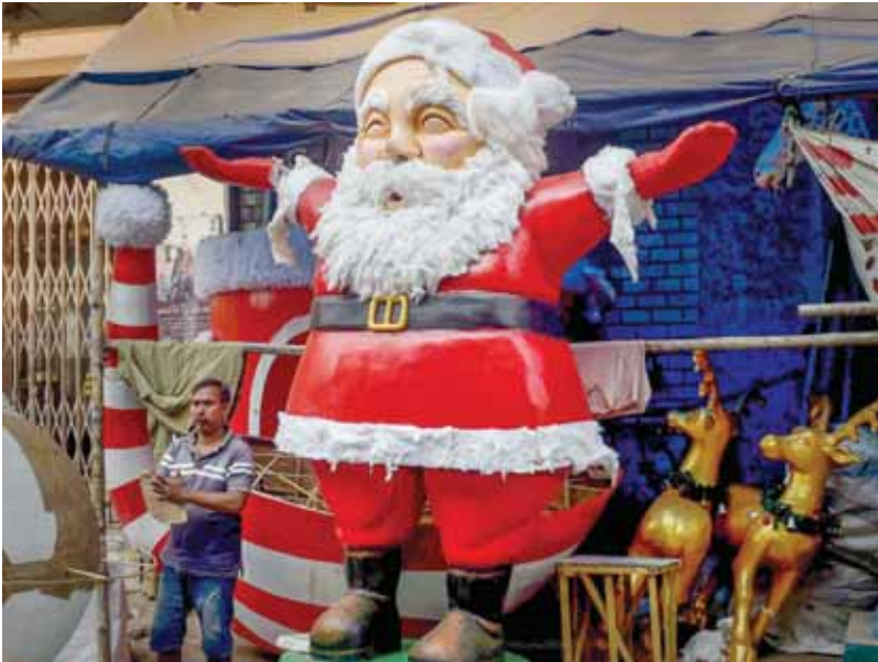
Workers prepare a Santa Claus statue ahead of the Christmas celebrations in Kolkata