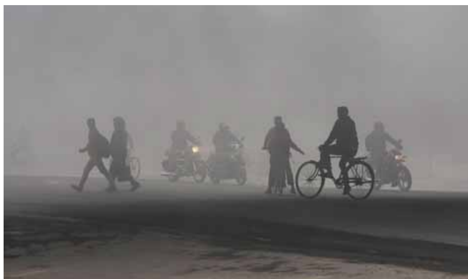
Commuters ply on the road amid low visibility due to dense smog on a cold winter morning, in New Delhi, Monday.

The fog brought the national Capital's air quality to the "very poor" category as the city's minimum temperature settled at 6 degrees Celsius, two notches below the season's average. Dense to very dense fog is predicted over the plains in