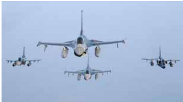
The IAF recently held a major exercise in the northern frontier near Arunachal.

An image from China's Bangda Airbase, which lies just 150 km northeast of Arunachal Pradesh, shows the presence of a state-of-the-art WZ-7 'Soaring Dragon' drone.