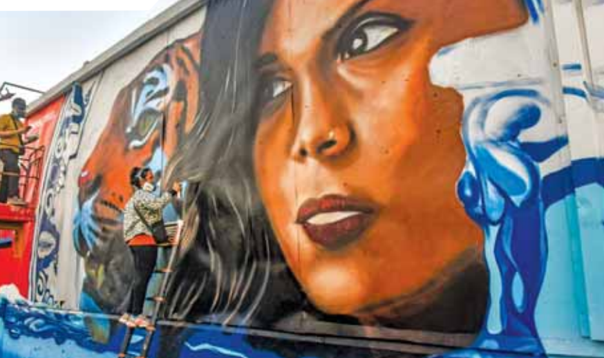
Artists give final touches to Mural to mark the 75 years of friendship between India and Netherlands, in New Delhi