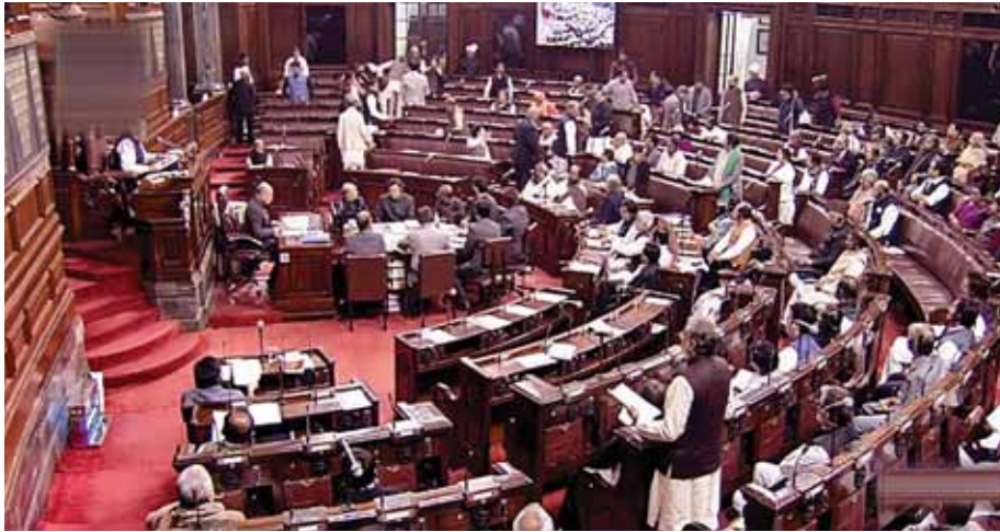
Opposition MPs walk out from the Rajya Sabha during the ongoing Winter Session of Parliament, in New Delhi, Monday.