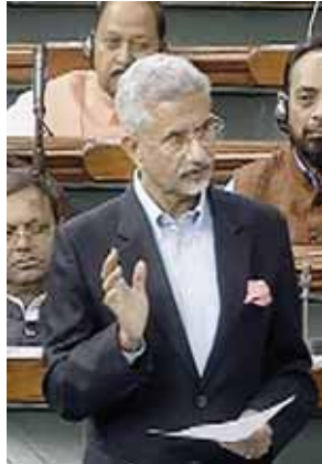
External Affairs Minister S Jaishankar speaks in the Lok Sabha during the ongoing Winter Session of Parliament, in New Delhi, Monday.

The Minister made these remarks during the debate on