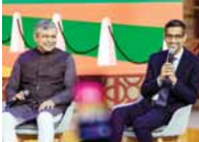
Union Minister for Electronics & Information Technology Ashwini Vaishnaw with Google CEO Sundar Pichai during the Google for India Summit 2022, at Pragati Maidan in New Delhi on Monday

"Given the scale and technology leadership it (India) will have, it's important to make sure you are balancing, putting in safeguards for people. You're creating an innovative framework, so that com-