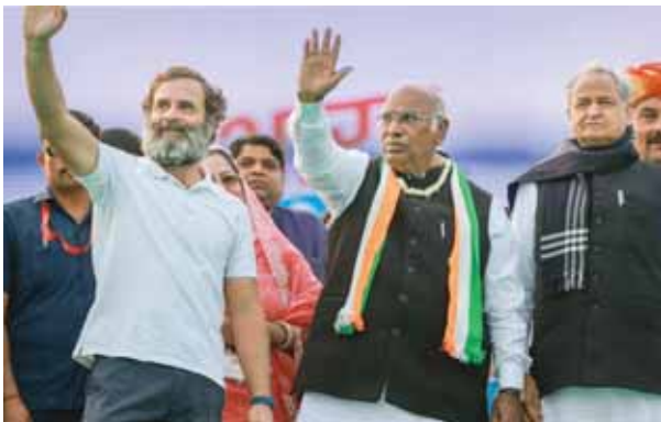
Congress leader Rahul Gandhi with party president Mallikarjun Kharge and Rajasthan CM Ashok Gehlot at a public meeting during the Bharat Jodo Yatra in Alwar on Monday

He hit out at BJP leaders for criticising the use of English in schools, saying that children of Home Minister Amit Shah, BJP chief ministers, MPs and MLAs study in English medium schools while they talk against the use of English language. “The Yatra has been