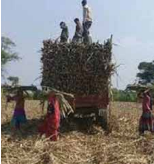
2021-22 marketing year.

India exported a record 111 lakh tonnes of sugar in