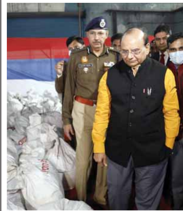
Lt Governor Vinai Kumar Saxena, with Delhi Police Commissioner Sanjay Arora, looks at narcotics and psychotropic substances seized under the 'Nasha Mukht Bharat Abhiyan' before their incineration, in New Delhi on Wednesday

The civic officials had earlier said that the deadline to flatten the Ghazipur landfill is December 2024 while efforts are on to raze the Bhalaswa dumping site by July next year.