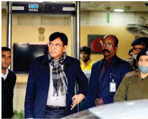
Union Health Minister Mansukh Mandaviya arrives to hold a meeting with senior officials and experts on the Covid-19 situation, in New Delhi on Wednesday

"Covid is not over yet. I have directed all concerned to be alert and strengthen surveillance. We are prepared to manage any situation," Union Health Minister Mansukh