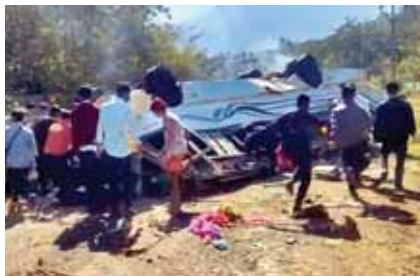
Locals gather at the site of the accident after a school bus overturned on Old Cachar Road, in Noney district on Wednesday

about the accident of a bus carrying school children at the Old Cachar Road today. SDRF, Medical team and MLAs have rushed to the site to coordinate the rescue operation. Praying for the safety of everyone in the bus," Chief Minister N Biren Singh tweeted, sharing a video clip of the overturned bus.