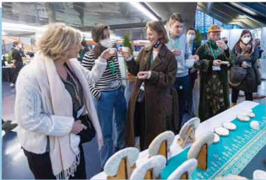
Participants tasted Chinese tea in the China Pavilion set up during the second phase of the COP15 at the Montreal Convention Center on December 7.

During the second phase of COP15 held in Montreal of Canada, China's contribution to biodiversity conservation impresses the participants.