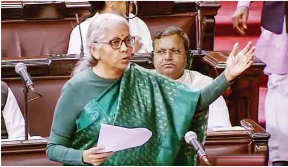
Finance Minister Nirmala Sitharaman speaks in the Rajya Sabha during the Winter Session of Parliament in New Delhi on Wednesday

Sitharaman, who is scheduled to present the next Union Budget on February 1, said, "Because of the targeted approach in which the government decided to give relief during Covid and address concerns given as inputs from