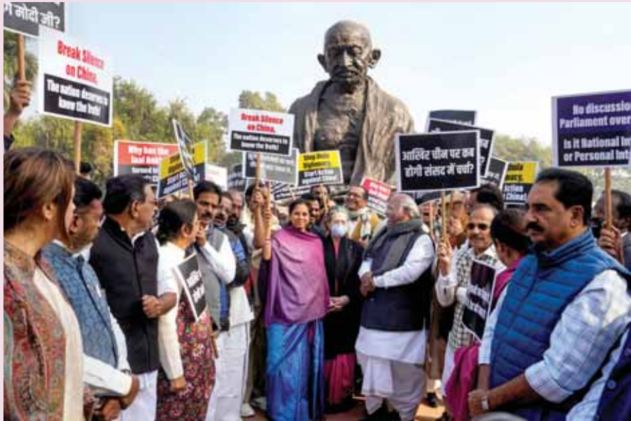
Congress MPs Mallikarjun Kharge, Sonia Gandhi, P Chidambaram, KC Venugopal, DMK's TR Bалу and other members during a protest near the Gandhi Statue, demanding discussion on national security and Indo-China border dispute issue during the Winter Session of Parliament, in New Delhi on Wednesday

Sonia Gandhi said when facing a significant national challenge, it has been the tradition in the country to take