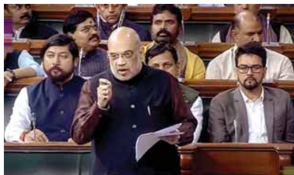
Home Minister Amit Shah speaks in the Lok Sabha during the Winter Session of Parliament, in New Delhi on Wednesday

"We have mapped the drug network across the States. No matter how big the criminal is, in the next two years