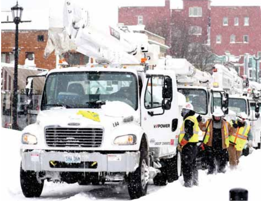
Utility trucks line up in Buffalo, N.Y., where thousands remain without power after blizzard conditions on Monday

"It's hard to say," Serreze said. "But are the dice a little bit loaded now? Absolutely."