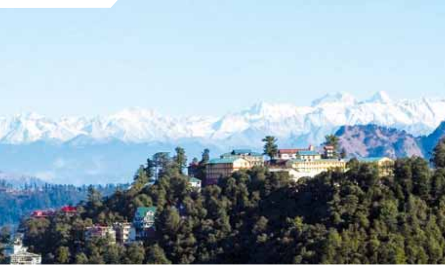
Snow-covered Himalayas mountain range after fresh snowfall, seen from Shimla