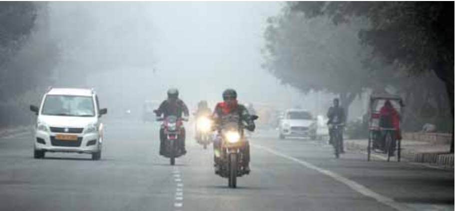
Commuters ply on the road a cold winter morning in New Delhi on Tuesday

As per the data released by the weather station, the obser-