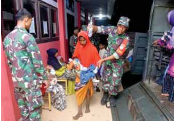
Indonesian soldiers help ethnic Rohingya women and children to step out of a military truck upon arrival at a temporary shelter after their boat landed in Pidie, Aceh province, Indonesia on Monday

Also on Friday, another group of 58 Rohingya — all