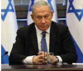
■ JERUSALEM

Over 1,000 senior Israeli air force veterans, including a former Israeli chief of staff, on Monday urged the country's top legal officials to stand tough against the incoming government.