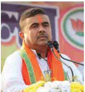
PIONEER NEWS SERVICE ■ KOLKATA

Almost 72 hours have elapsed since a massive explosion on Friday night took down a partly built two-storey house and caused three deaths and several injuries at Bhupatinagar village in East Midnapore district but neither the Superintendent of Police nor the district forensic team have visited the area, locals on Monday rued.