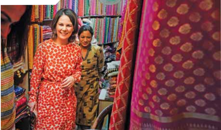
Minister for Foreign Affairs of Germany Annalena Baerbock visits Kinari Bazaar, at Chandni Chowk in Old Delhi