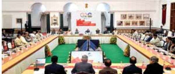
Prime Minister Narendra Modi attends the all-party meeting on G20 summit in New Delhi on Monday

Other Chief Ministers who attended the meeting were Andhra Pradesh's Jagan Mohan