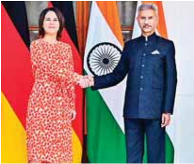
External Affairs Minister S Jaishankar with Minister for Foreign Affairs of Germany Annalena Baerbock during a meeting, in New Delhi on Monday

As regards the issue of oil, he said, "The European Union from February to November has imported more fossil fuel from Russia than the next 10 countries combined. The oil import in European Union is six times what India has imported, gas is infinite times because we don't