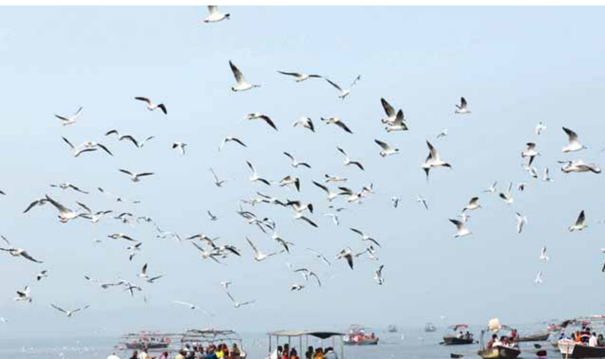
Siberian birds flying over Yamuna river in foggy weather in Prayagraj

Hospital employees, staff members and paramedical students also presented bouquets to the Mayor and accorded her a warm welcome in the hospital premises.