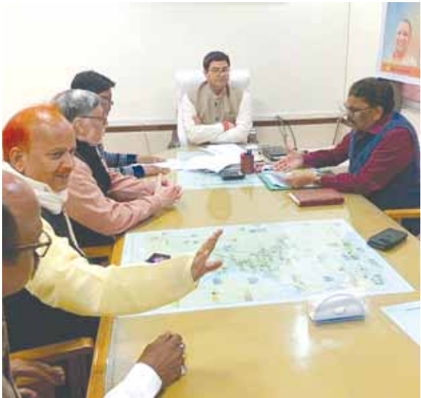
Power employees holding a talk with PVVNL MD in Varanasi on Monday.

Apart from meeting with MD, the representative of JAC also met the directors (Personnel and Administration). Later, the MD assured the power staff of withdrawing action taken against some during the boy-