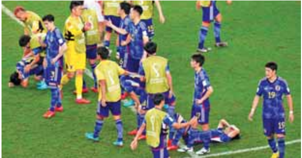
Japan players are dejected after Croatia's win in the World Cup round of 16 soccer match between Japan and Croatia on Monday

England's Kane scored for the 52nd time for his country to move within one of Wayne Rooney's England record. He