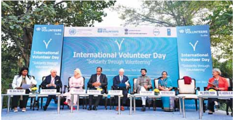
The Union Minister for Information & Broadcasting, Youth Affairs and Sports, Anurag Singh Thakur addressing at the International volunteer day, in New Delhi on December 05, 2022

"He has proved time and time again that he is able to deliver. He is an amazing cricketer and so beautiful to watch but also he has got an amazing record, especially in the IPL, and a ridiculously good average. I rate him very highly."