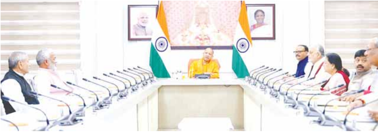
Chief Minister Yogi Adityanath chairing the cabinet meeting at his official residence in Lucknow on Monday