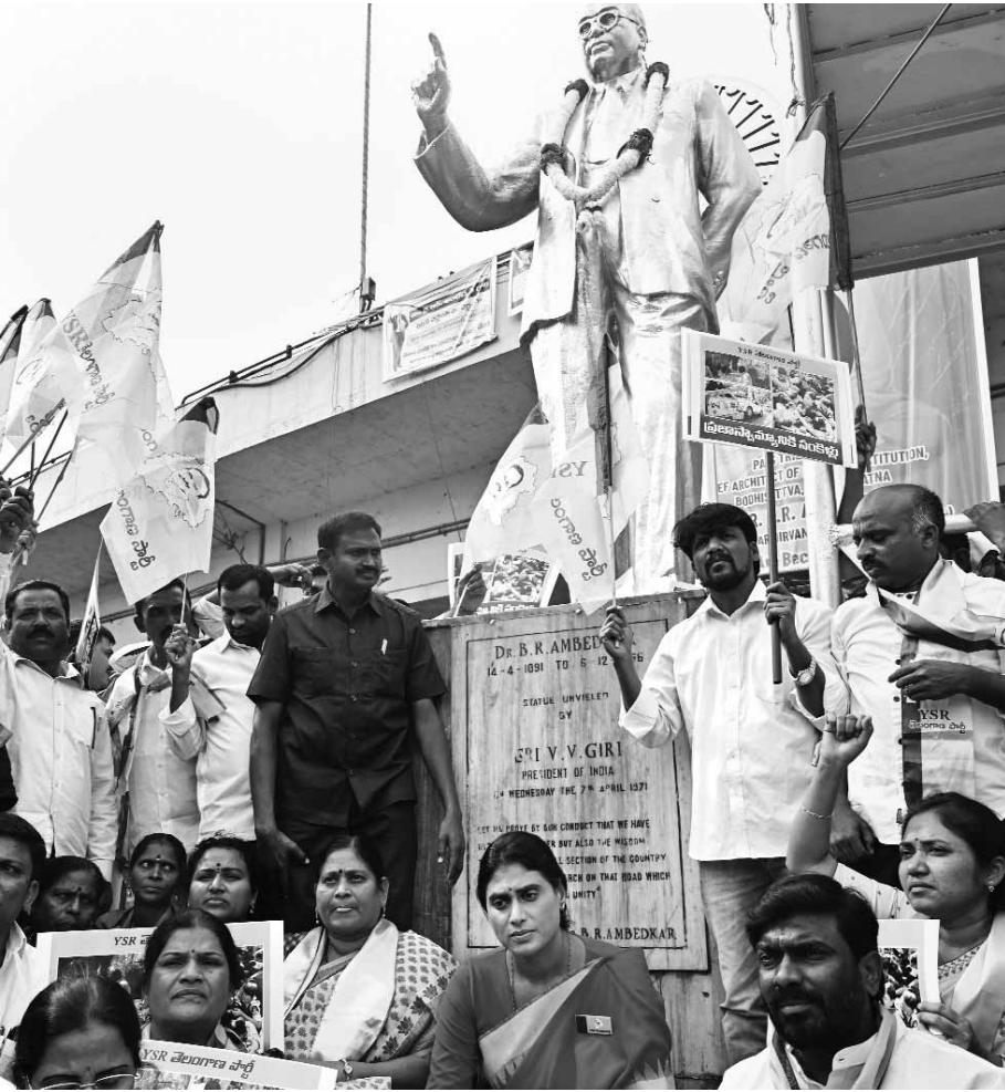
YSR Telangana Party president YS Sharmila with supporters stages a protest after reportedly denial of permission for her 'padayatra', in Hyderabad on Friday

The complainant (a candidate) had alleged that the accused (a teacher of the institute) was in possession of questions for the said examination disclosing leakage of paper by him in connivance with unknown officials of APPSC.