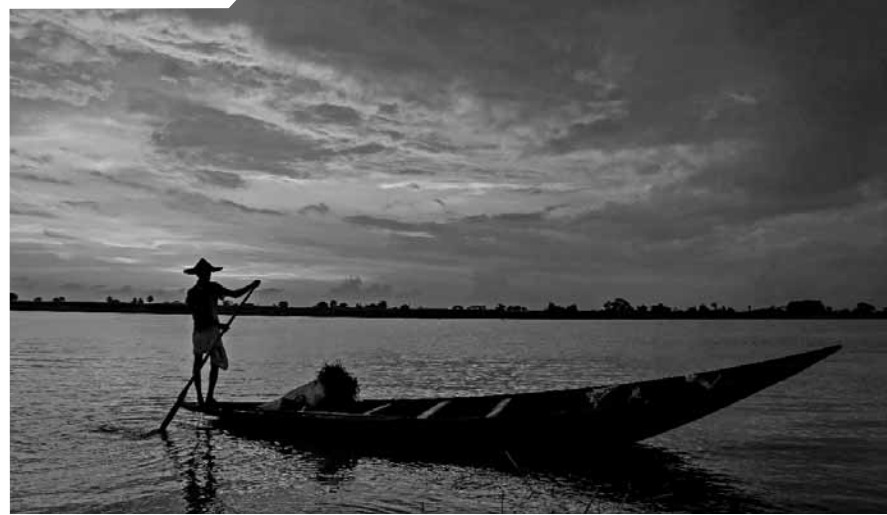
A fisherman rows across the Hooghly river during sunset, in Nadia district