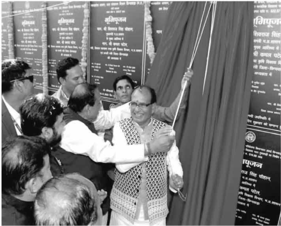
Chief Minister Shivraj Singh Chouhan participated in Mukhya Mantri Jan Seva Abhiyan approval letter distribution programme at Bichua in Chhindwara district on Friday.

being done for the development of cities like villages. Soon a state-level conference of the representatives of the urban bodies will be organized like the conference of Sarpanchas. Chouhan said that Rs 7 crore has been sanctioned for the development of Chhindwara city. Giving information about the PESA Act, Chief Minister Chouhan said that the Act is not against anyone, it is in fact beneficial for all. Now no tribal will be able to usurp the land of another. If the land has been usurped, the Gram Sabha will have the right to take it back. Chief Minister Chouhan said in strong words that I will not allow the vicious cycle of religious conversion and love jihad to continue on the land of Madhya Pradesh. This is not love but only Jihad.