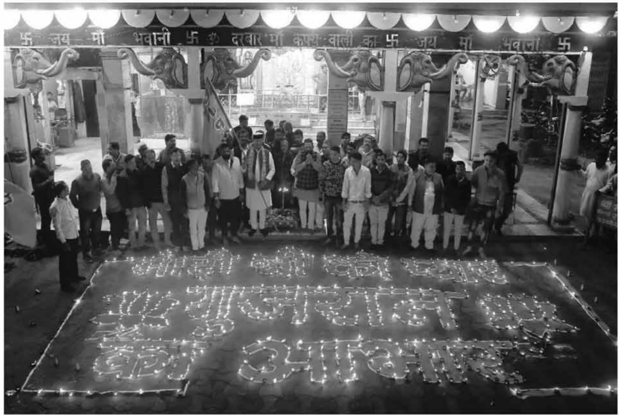
BJP workers light lamps to celebrate the party's victory in Gujarat State Assembly elections, in Bhopal on Friday.

from December 12 to 16 due to Cyclone Maudas which will reach Chennai by the night of December 10. Its effect will be visible in Madhya Pradesh from December 12 and this will increase the chances of rain. Light clouds may remain in Barwani, Betul, Itarsi, Bhopal, Indore, Sagar, Rewa, Chhindwara and Shahdol from the night of December 12. Light rain may occur in Rewa, Sagar, Bhopal, Barwani, Chhindwara, Itarsi, Damoh and Umaria on the night of December 13. Cloud cover in Barwani, Indore, Bhopal, Sagar, Rewa, Singrauli, Betul and Khandwa would be witnessed and light to moderate clouds may remain in Madhya Pradesh till December 15.