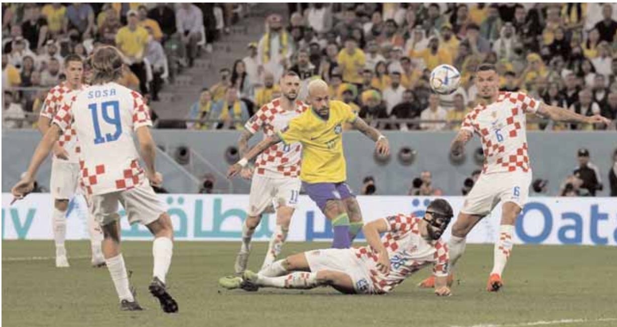
Brazil's Neymar, centre, kicks the ball besides Croatia's Josko Gvardiol, bottom, Croatia's Dejan Lovren, right, Croatia's Marcelo Brozovic, background, and Croatia's Borna Sosa, left, during the World Cup quarterfinal soccer match between Croatia and Brazil, at the Education City Stadium in Al Rayyan, Qatar, on Friday

Croatia will next face either Argentina or the Netherlands to try to return to the World Cup final four years after los-