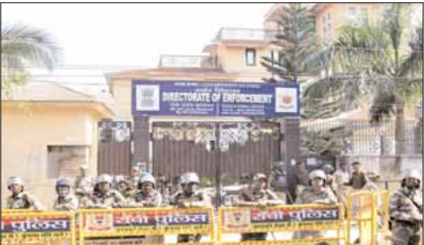
A view of the fortified ED office in Ranchi.