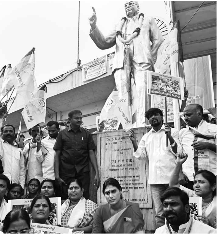
YSR Telangana Party president YS Sharmila with supporters stages a protest after reportedly denial of permission for her 'padayatra', in Hyderabad on Friday

The complainant (a candidate) had alleged that the accused (a teacher of the institute) was in possession of questions for the said examination disclosing leakage of paper by him in connivance with unknown officials of APPSC.