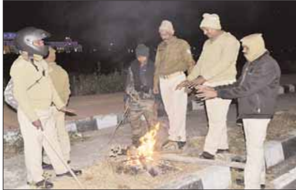
Policemen warm themselves around a bonfire near the State Assembly building during cold weather in Ranchi on Friday.

There will be fog in the morning of December 9 and the wind will increase the cold. The sky will be cloudy till late night, there may be an increase of two to three degrees in the minimum temperature. There is a possibility of further fall in Jharkhand from December 11. Cold wave is going on in many districts of Jharkhand. A drop in the minimum temperature has