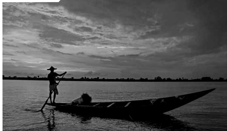
A fisherman rows across the Hooghly river during sunset, in Nadia district