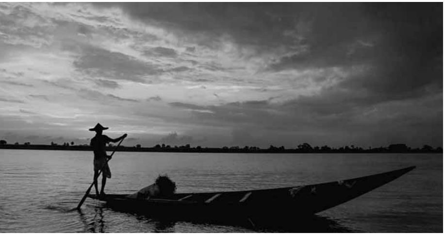
A fisherman rows his boat across the Hooghly river at sunset, in Nadia district on Friday

“Let the Dravidian model guide (the nation) not only in social justice but also in ecological justice,” Stalin said in a tweet, after launching the mission at the TN Climate Summit 2022. During the budget for 2021-2022, the state government announced the launch of the Tamil Nadu Climate Change Mission for an outlay of Rs 500 crore to undertake climate change management.