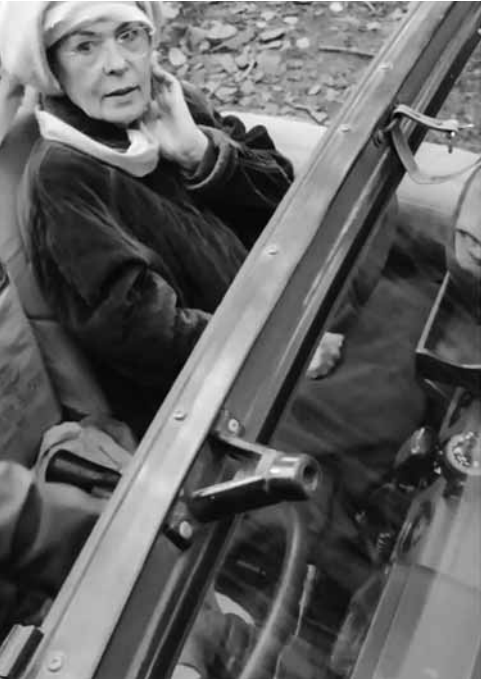
Congress leaders Sonia Gandhi and Rahul Gandhi during a safari, at Ranthambore National Park in Sawai Madhopur, Rajasthan

In Viramgam constituency, which was represented by Congress in assembly, people greeted Yogi with chants of Jai Shri Ram, and after Yogi’s appeal to vote for BJP, they voted en masse for the party following which Hardik Patel won there by the margin of 51,707 votes.