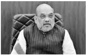
his personal intervention.

On Thursday, the MVA parliamentarians had written to Shah warning that the Karnataka-Maharashtra border row had reached a stage where it could erupt into full-blown violence and had sought