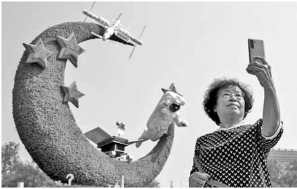
China's space program

Even tiny shards of metal can pose a danger and the number of objects is growing rapidly.