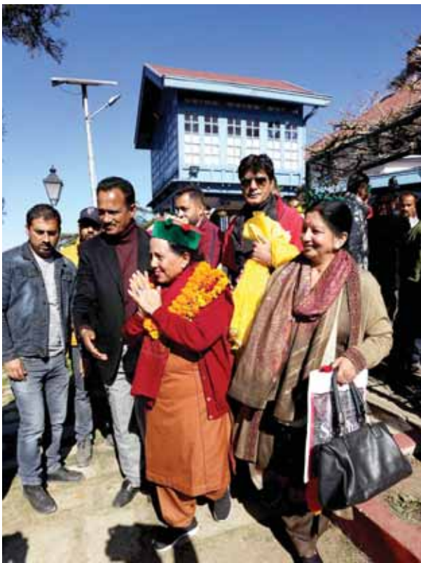
Himachal Pradesh Congress President Pratibha Singh being congratulated by supporters after the party's victory in the State Assembly elections, in Shimla on Friday

Former State chief of the party Sukhwinder Singh Sukhu and outgoing legislature party