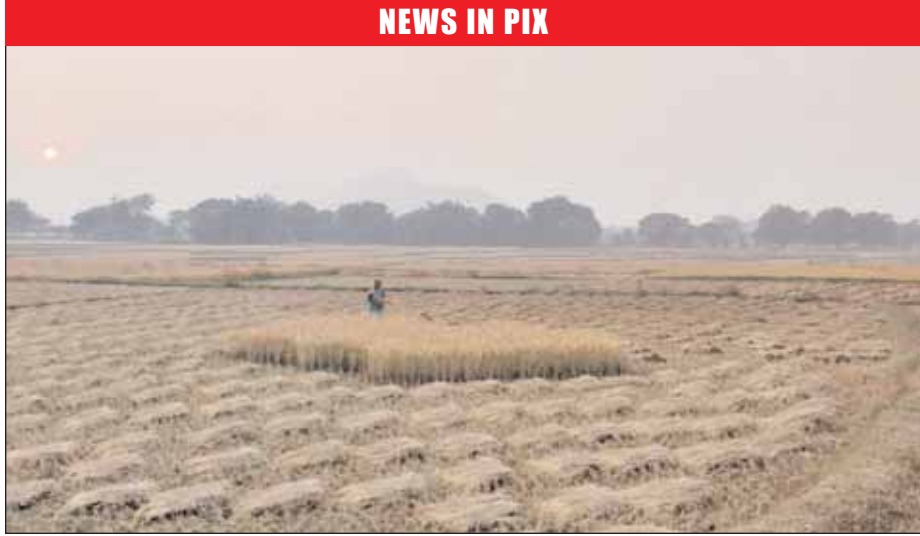
A woman farmer harvests paddy in a field on the outskirts of Ranchi on Friday.