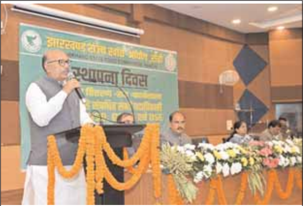
Jharkhand Assembly Speaker Ravindranath Mahato addresses a gathering during the Foundation Day celebration of Jharkhand State Food Commission in Ranchi on Friday.

The Speaker said that food and civil supplies is a big issue. The government supplies ration to the shops of the public distribution system, huge machinery is