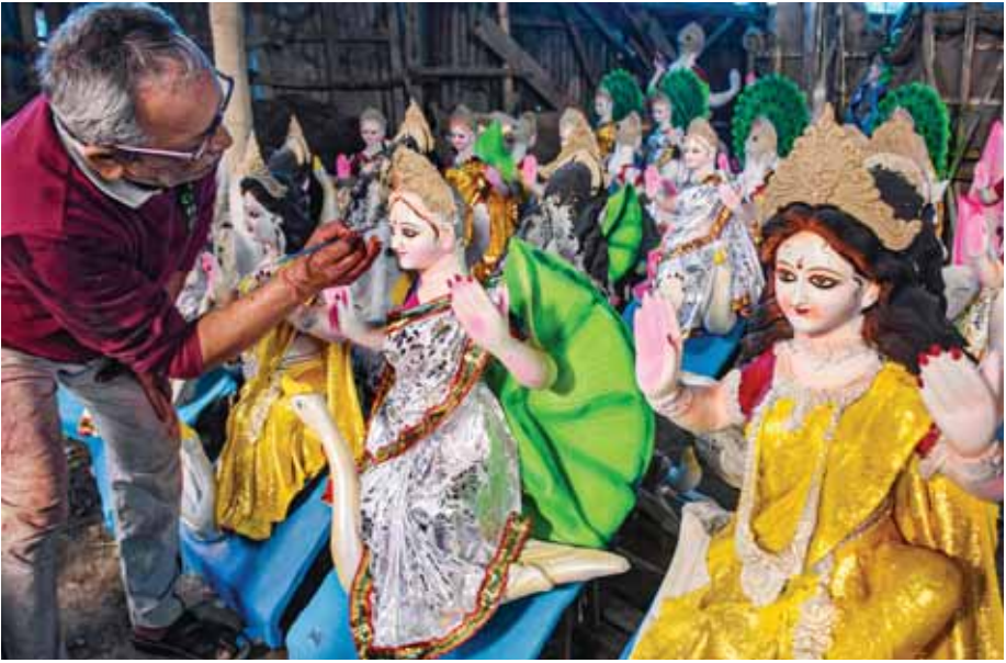
An artist prepares an idol of the goddess Saraswati ahead of the upcoming festival of Sarasvati Puja in his workshop in Guwahati on Wednesday