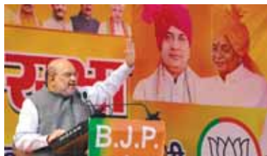
Union Home Minister Amit Shah addresses a meeting in Atrauli on Wednesday

Shah said he had visited this place in 2014, 2017, and 2019 and asked for people's support and they supported the BJP. "Now in 2022 Yogi has to be made Chief Minister again. Bua and Bhatija cannot do good to the State," he said. "Now there is a toilet in every house of the poor, electricity in every house. This is because of the vision of Prime Minister Narendra Modi and Chief Minister Yogi Adityanath. Even