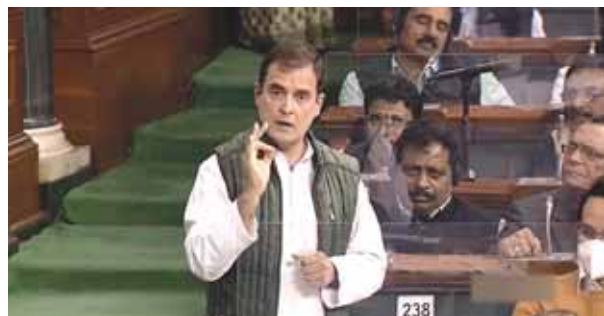
Congress MP Rahul Gandhi speaks in the Lok Sabha during ongoing Budget Session in New Delhi on Wednesday

Rahul accused the Government of killing small and medium industries and wiping-out jobs from the country. "The Government has repeatedly attacked the two