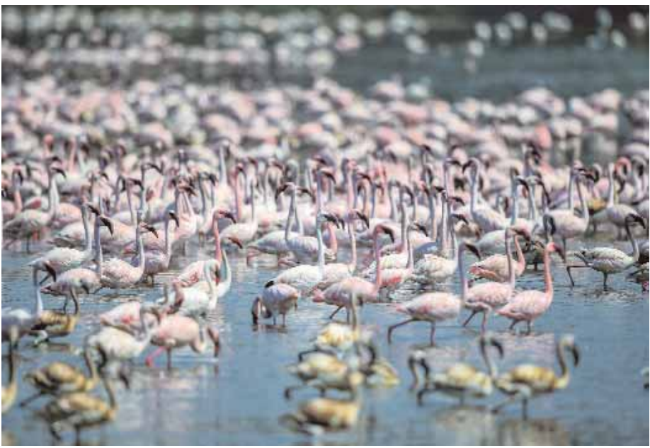
Flock of flamingos on a wetland in Seawoods area of Mumbai on Wednesday

Meanwhile, 113 fresh Omicron cases were recorded in Maharashtra, taking the total number of the new Covid-19 variant cases to 3,334.