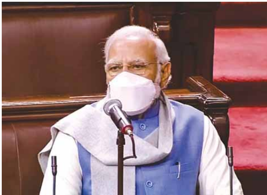
Prime Minister Narendra Modi in the Rajya Sabha during ongoing Budget Session in New Delhi on Wednesday

Explaining the key points of the Budget presented by Finance Minister Nirmala Sitharaman, Modi said it "gives poor, middle class and the youth opportunities for economic growth and self-reliance".