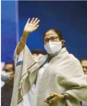
West Bengal CM and TMC’s re-elected chairperson Mamata Banerjee interacts with party workers after the party’s organisational election in Kolkata on Wednesday

constitutional duties,” the Governor said wondering whether a Chief Minister was constitutionally correct in not receiving a Governor in a State programme. “On Republic Day she did not receive me the Governor ... which has perhaps never happened in the history of Indian democracy,” Referring to her “horse” remark he said “I am amused by what she said today ... are we to engage in mud-slinging like this, asking her to communicate to him personally if there were any issues instead of making things public. “Madam Chief Minister if you have anything consult me ... do write to me,” instead of making things public, he said. The Governor and the Chief Minister had been at loggerheads ever since he assumed office in 2019 with the ruling Trinamool Congress often accusing Raj Bhavan of acting like a BJP party office and the Governor an agent of the saf-ron outfit. Meanwhile in an unrelated development Banerjee, who was re-elected the TMC chairperson on Wednesday, urged her party leaders not to indulge in infighting and put up a united fight against the BJP instead. “I want all my party leaders and workers to promise they will not fight among themselves. Infighting will not be tolerated...groups within the party will not be tolerated. There are no different groups in TMC, the party is one united group,” Banerjee said reminding the leaders that they would have to fight hard to win all the 42 Lok Sabha seats in the 2024 general elections.