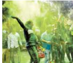
TMC supporters celebrate during counting day of municipal election, at Salt Lake in Kolkata, on Monday

In Chandannagar, the TMC won 31 seats. The Left won 1 and the BJP and the Congress could win none whereas in Bidhannagar adja-