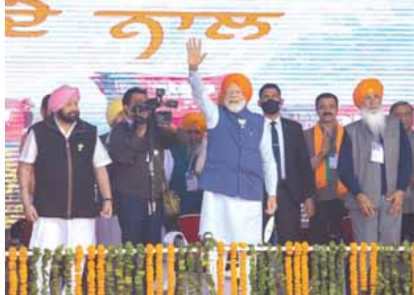
Prime Minister Narendra Modi with former Punjab Chief Minister &amp; Punjab Lok Congress President Captain Amarinder Singh and others during a rally ahead of the Punjab Assembly elections, in Jalandhar, on Monday

Punjab...I want to serve Punjab by making it drug-free...I understand your pain...I want to give a safe environment for the youth of Punjab," he said.