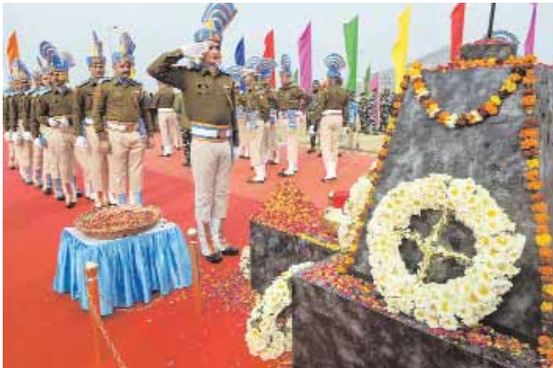
Central Reserve Police Force (CRPF) personnel pay tribute to those who were killed in the 2019 suicide bombing attack by militants in Pulwama, at a memorial in Lethpora on Monday. 40 CRPF personnel were killed in the attack (L). An army person stands guard near the national flag, on the third anniversary of 2019 Pulwama terror attack, along the LoC in Poonch district on Monday (R)