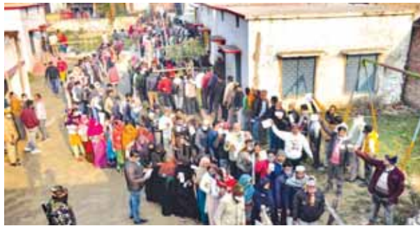
Citizens wait to cast their vote at a polling booth, during the second phase of Uttar Pradesh Assembly elections, in Moradabad, on Monday PTI

An average voter turnout of 39.07 per cent was recorded till 1 pm on Monday in Uttar Pradesh as polling picked up pace after a slow start. In the first phase of Assembly elections for 58 Assembly constituencies on February 10,