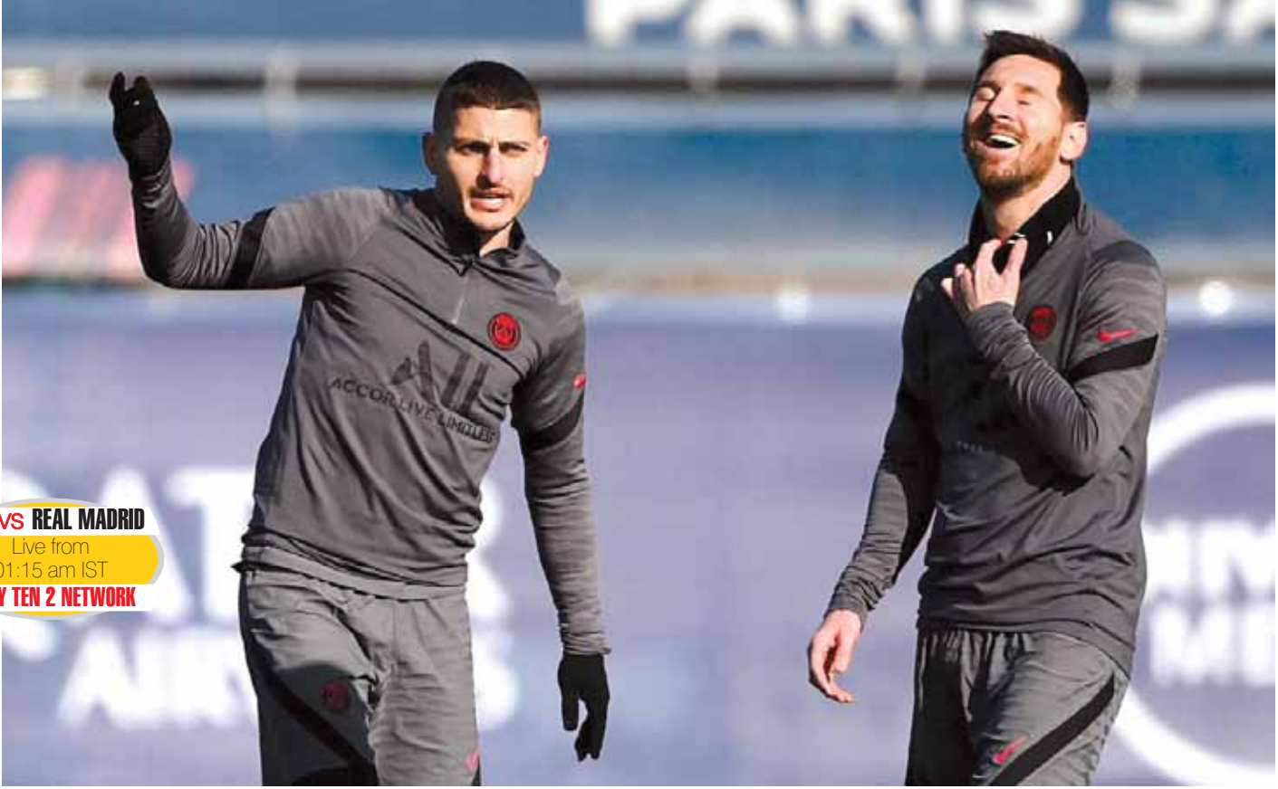
PSG VS REAL MADRID Live from 01:15 am IST SONY TEN 2 NETWORK

Joao Cancelo, rested like Kevin De Bruyne and Aymeric Laporte in the Premier League at the weekend, will fill in at right back with Oleksandr Zinchenko set to cover on the left. City, the beaten finalist last season, is heavy favorite against a Portuguese opponent which is making only its second appearance