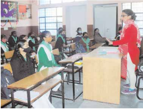
Children attend a class after schools reopened for nursery to Class VIII standard students, as Covid-induced restrictions ease, at a School in New Delhi on Monday

"My child was in class 2 when COVID-19 started and now he is in class 5. Covid has impacted studies and it is good that schools are reopening. I hope students stay safe and