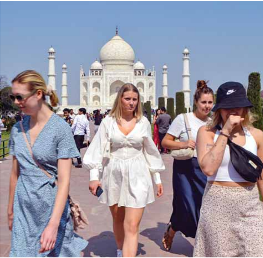
Foreign tourists visit the Taj Mahal on a warmer sunny day, in Agra on Tuesday