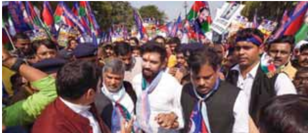
Lok Janshakti Party (Ramvilas) chief Chirag Paswan with supporters during their Bihar Bachao protest march towards Rajbhawan, in Patna on Tuesday