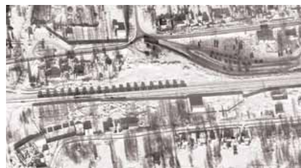
This Feb 13, 2022, satellite image provided by Maxar Technologies shows the armor and artillery loaded on flatcars and railyard in Yelnya, Russia, about 300 kilometres (186 miles) north of the border with Ukraine. AP/PTI