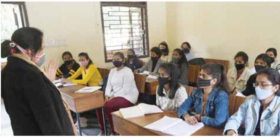
Students attend a lecture at the Miranda House College. Delhi University reopened for classes on Thursday

Principals, however, said the turnout was better than their expectations. According to teachers, attendance was higher among second year stu-