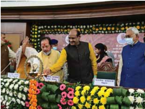
Lok Sabha Speaker Om Birla on Thursday inaugurates an Orientation Programme for Members of Bihar Legislative Assembly and Bihar Legislative Council and addressed the Members of both the Houses of Bihar legislature at Patna on the occasion of foundation day of Bihar Legislative Assembly. Deputy Chairman Rajya Sabha Harivansh, Chief Minister Nitish Kumar, Speaker of Bihar Legislative Assembly, Vijay Kumar Sinha, Leader of Opposition, Bihar Legislative Assembly Tejashwi Prasad Yadav and several other dignitaries graced the occasion