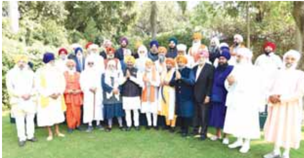
Prime Minister Narendra Modi meets with prominent Sikh personalities at his residence in New Delhi on Friday

According to a Press statement from the Sikh representatives who attended the meet-