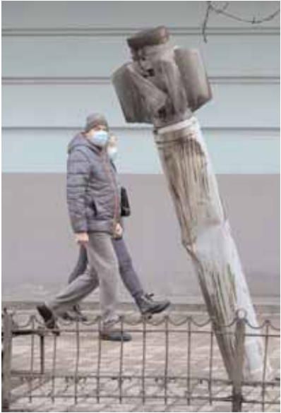
People pass by an unexploded missile fired by pro-Russian separatists in Ukraine's east and taken to Kyiv as a reminder of war, in Kyiv, Ukraine, Friday, Feb. 18, 2022. Russia has announced massive nuclear drills while Western leaders grasp for ways to avert a new war in Europe. Tensions are soaring after unusually dire U.S. warnings that Moscow could order an invasion of Ukraine any day

Speaking at the U.N. Security Council, U.S. Secretary of State Antony Blinken revealed some conclusions of U.S. Intelligence in a strategy that the U.S. And Britain have hoped will expose and preempt any invasion planning. The U.S. Has declined to reveal much of the evidence underlying its claims.