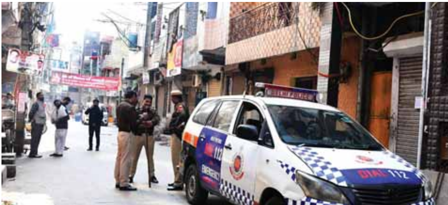
Delhi Police personnel stand outside the sealed house at Old Seemapuri from where an IED was found by the police in New Delhi on Friday