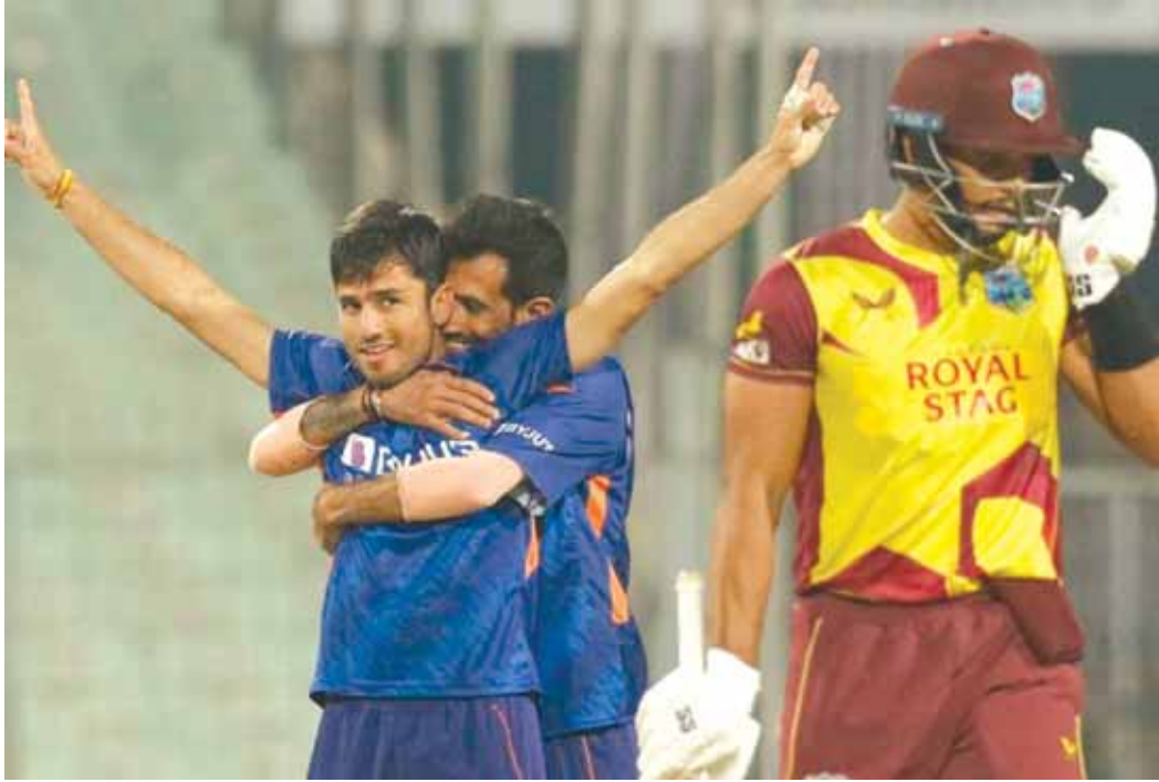
World Cup on October 24 last year.

Kohli hit his 30th fifty in the shortest format, his first since the 57 versus Pakistan in the T20