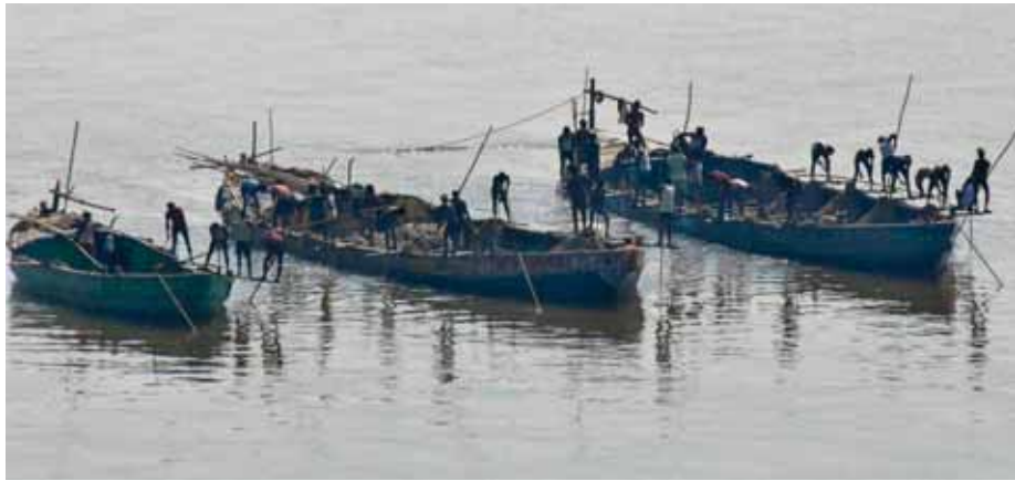
People engaged in sand mining activities in the River Ganga despite Bihar Government’s ban in Patna on Friday