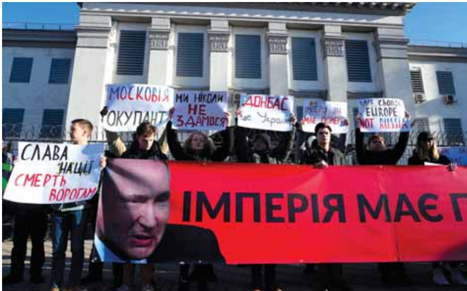
Protesters hold posters reading: "We will never surrender! Donbass is Ukraine, The empire must die" and a banner "The empire must die" in front of Russian Embassy in Kyiv, Ukraine, on Tuesday

White House press secretary Jen Psaki also alluded to the Russian action as being an invasion in a twitter post commenting on Germany chancellor Olaf Scholz decision to halt the Nord Stream 2 gas pipeline in response to Russia's actions.