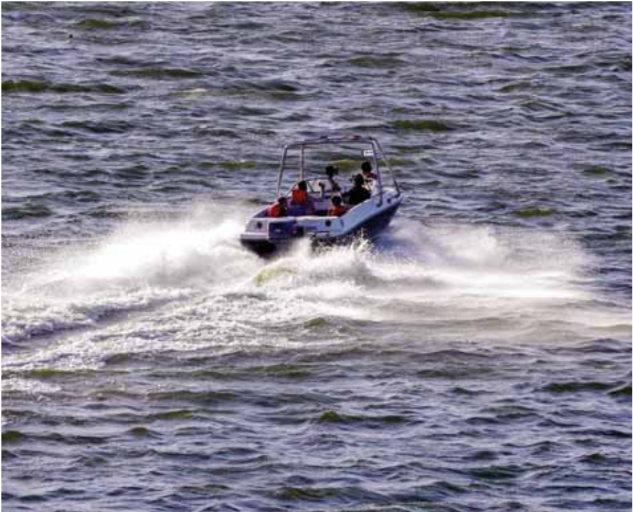
Tourists ride a speed boat at Ana Sagar Lake, in Ajmer on Tuesday

He wants to gift this wall hanging carpet to the actor and hopes that the Bollywood star accepts it.