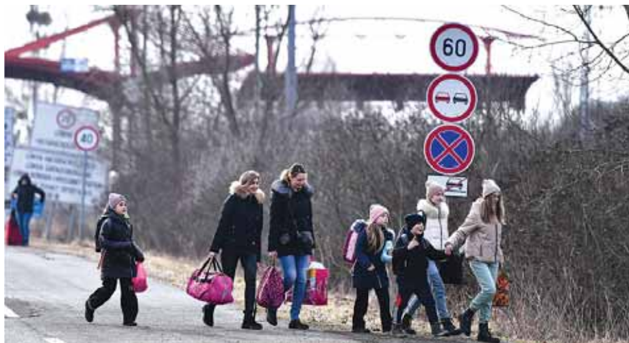
People flee from Ukraine at the Hungarian-Ukrainian border, in Lonya, Hungary, on Friday. Hungary has extended legal protection to those fleeing the Russian invasion

The US and other global powers slapped ever-tougher sanctions on Russia as the