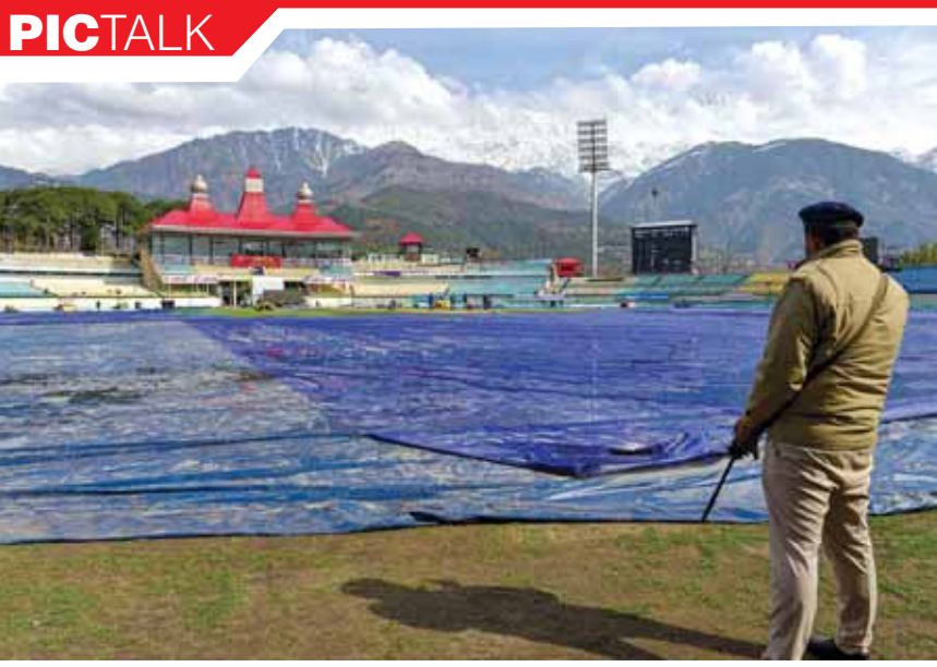
Preparations for the 2nd T20 match between India and Sri Lanka, in Dharamsala

pristine, hilly forest of Andhra Pradesh. Sandalwood smuggling operations in such a locale make much more cinematic sense than a film studio. Secondly, Delhi will have to develop cinema-related infrastructure if directors have to save costs of transporting crew, transport and equipment from outside. Thirdly, Sisodia can take a novel initiative and try bringing all States on a single platform for a single-window access to filmmakers. In India, 14 States have their own film facilitation policies while 18 offer various incentives to filmmakers. And now, the Union Government is also jumping into the fray, having decided to frame a model film policy and coordinate with States to set up film promotion offices. The absence of friendly local policies force producers to look for locales abroad even though film shooting is cheaper in India. A cohesive Centre-States effort is needed to make Delhi, the seat of governance, be the natural intersection between national cinematographic legislation, India's internal cinematographic market, cinema's cultural values and film-makers' freedom of expression.