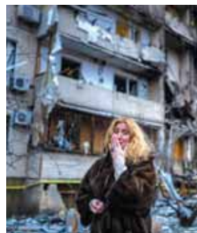
there. There are more than 15,000 Indians, including students now in that country.

The last three countries share land borders with Ukraine. India is trying to bring out its citizens from these countries as war rages