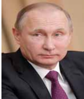
AP ■ BRUSSELS