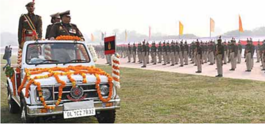
The Passing out Parade of batch number 2 of Recruit Constables (Male & female) of Secretariate Security force was held at Delhi Police Academy, Wazirabad campus, in New Delhi on Friday.