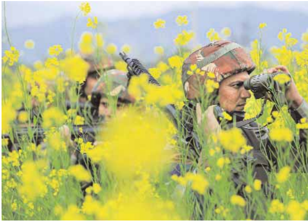
Indian Army soldiers patrol near the Line of Control (LOC), in Akhnoor, about 65kms from Jammu on Friday

On their part the foot soldiers of the Indian army have been discharging their duties