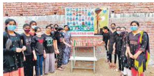
Students observing Black Day to mark terrorist strike in Pulwama, in Nalgonda on Monday