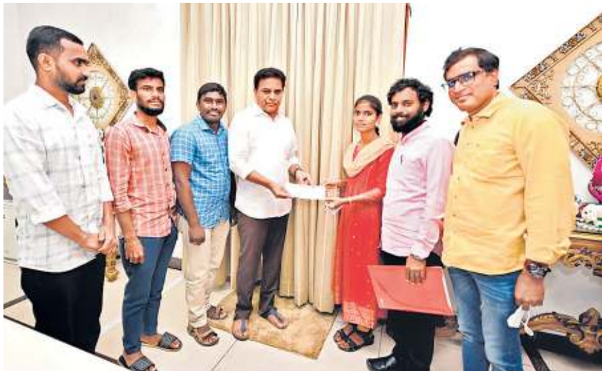
IT Minister K T Rama Rao presenting cheques to the girl students in Hyderabad on Monday