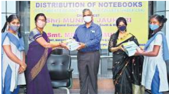
NTPC officials distributing notebooks to poor students in Secunderabad on Monday