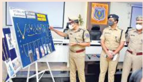
Police officials showing seized ornaments to media persons in Hyderabad on Monday