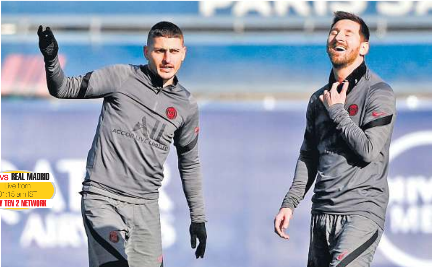
PSG VS REAL MADRID Live from 01:15 am IST SONY TEN 2 NETWORK

Joao Cancelo, rested like Kevin De Bruyne and Aymeric Laporte in the Premier League at the weekend, will fill in at right back with Oleksandr Zinchenko set to cover on the left. City, the beaten finalist last season, is heavy favorite against a Portuguese opponent which is making only its second appearance