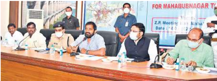
Minister for Excise V Srinivas Goud at Zilla Parishad meeting in Mahabubnagar on Monday

Master plan forms the backbone of the development of the city that is why the suggestions and advice of officials concerned are crucial. The current population of Mahabubnagar city is 3.5 lakh. It is likely to increase to 10