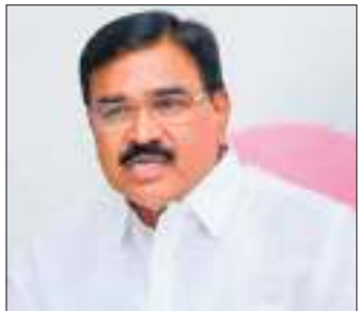
agricultural sector by 2024.

The Union Ministry of Power on Friday said that the country will replace diesel with renewables to eliminate the use of diesel in the