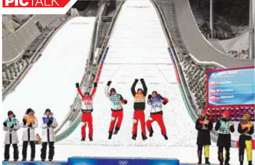
Austrian skiers (centre) after winning gold in the men's team ski jumping event at Winter Olympics