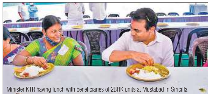
Minister KTR having lunch with beneficiaries of 2BHK units at Mustabad in Siricilla.

KTR addressed a function organised on the occasion of the