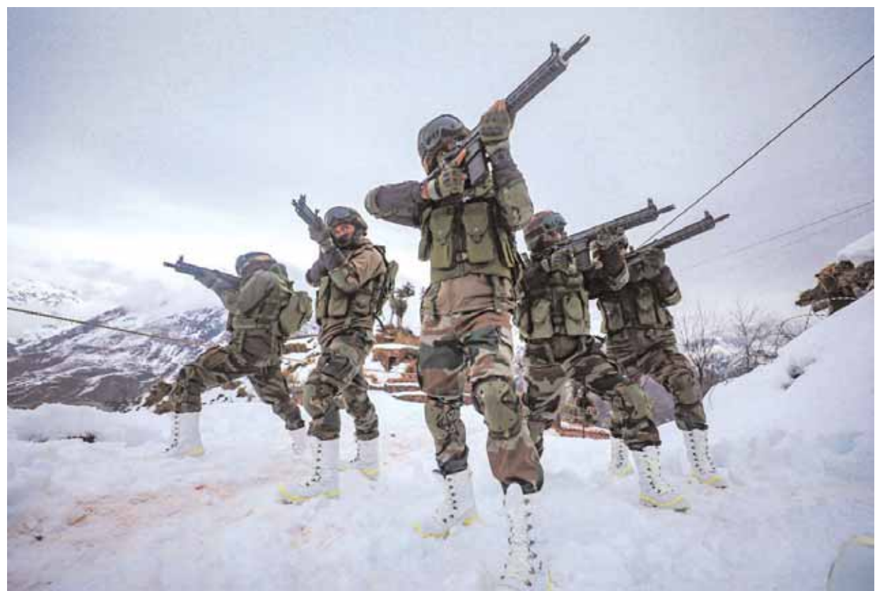
Army jawans patrol in a snow-covered area near the LOC in Poonch on Wednesday

and the south runway for arrivals. Later, the shift in charge decided to close the south runway but failed to inform the air traffic controller of the south tower," said officials. As a result, the two flights were given permission for take-off at the same time from the converging runways. This resulted in a situation where the aircraft moving in the same direction were about to collide with each other. A radar controller saw this and immediately intervened to alert the aircraft.