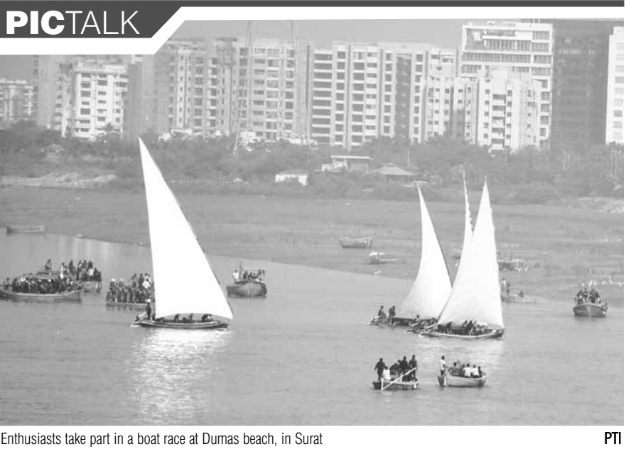
Enthusiasts take part in a boat race at Dumas beach, in Surat