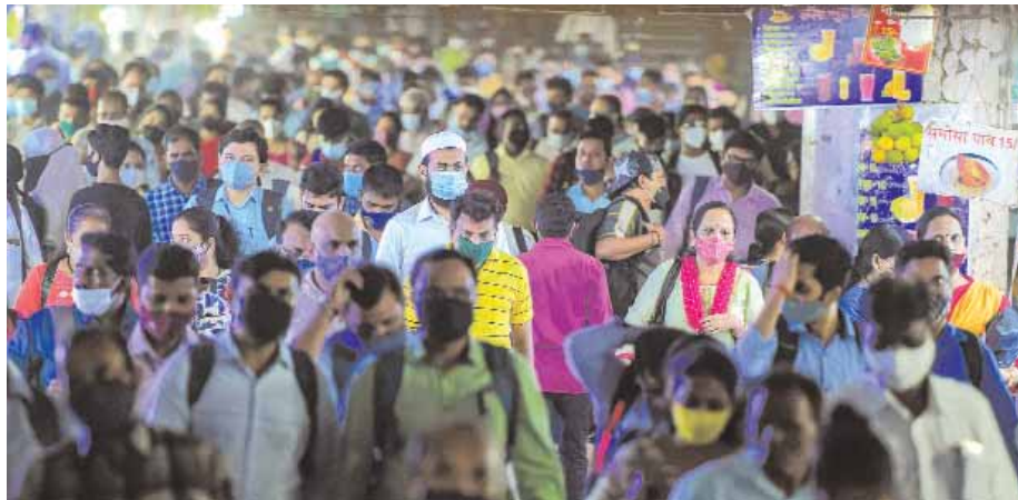
A crowded subway at Chhatrapati Shivaji Maharaj Terminus railway station amid concern over rising cases of Omicron variant of Covid-19 across the country, in Mumbai on Wednesday

"The daily cases are projected to peak on January 23 in India and stay below the four