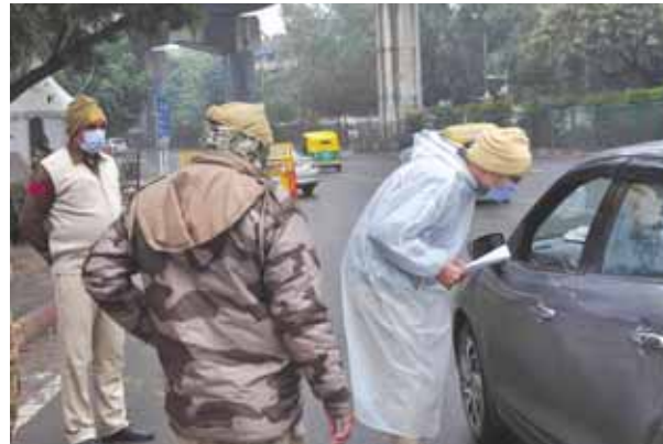
Delhi Police check commuters during weekend curfew to curb spread of Covid-19 on Saturday

On the other hand, Mumbai on Saturday reported 20,318 cases in the last 24 hours, marginally lower than Friday's 20,971. The city logged 5 Covid-related deaths. On the whole, Maharashtra added 41,434 new Covid cases, marginally higher compared to Friday. Thirteen people died in the last 24 hours in the State. Of the total cases, 82 per cent are asymptomatic, down from 84 per cent.