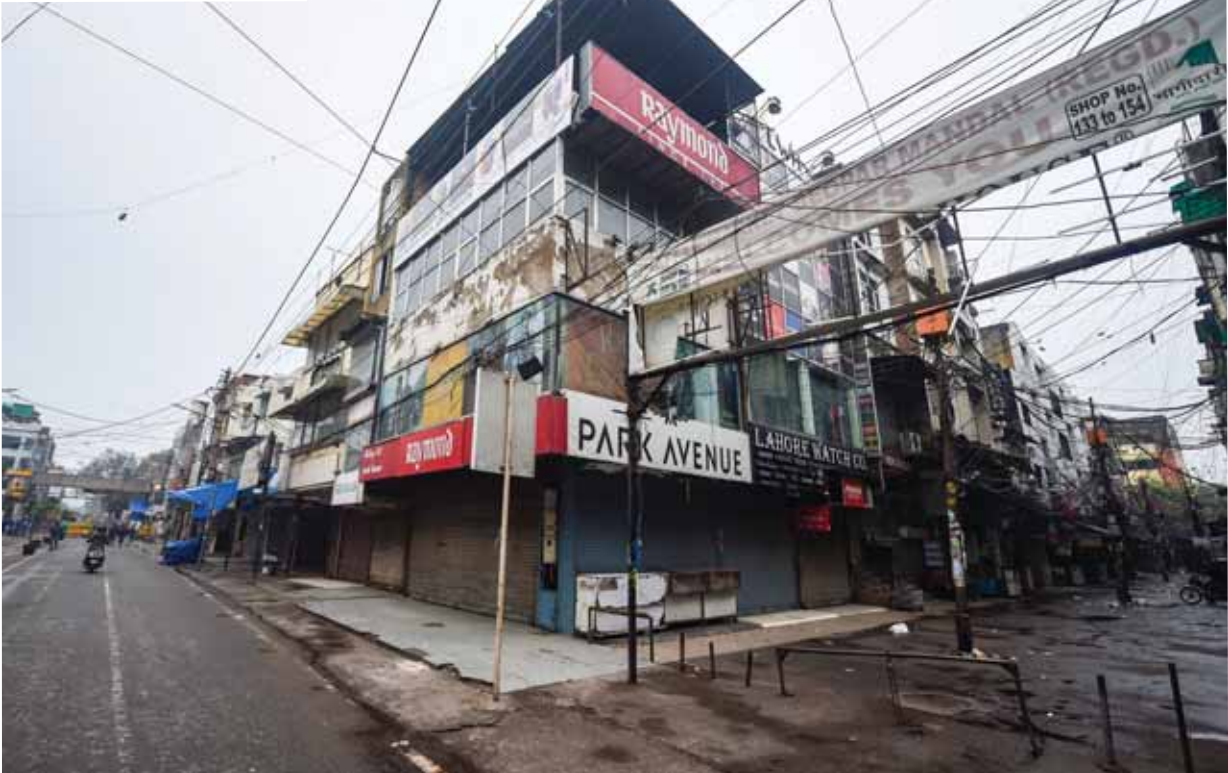
Karol Bagh market wears a deserted look during the weekend curfew imposed by the Delhi Government to curb the spread of Covid-19, in New Delhi on Sunday