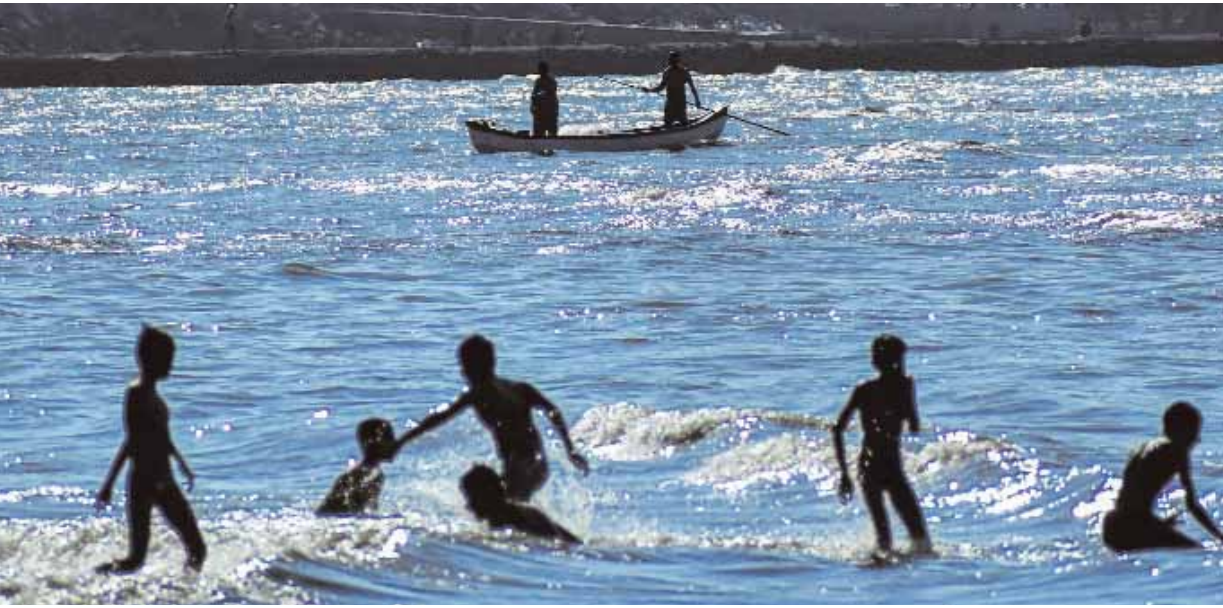
Children play in Arabian sea at Dadar Chowpatty amid restrictions imposed due to rising Covid-19 cases in Mumbai, on Sunday