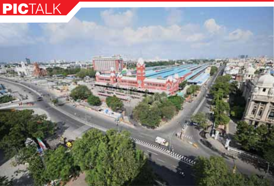
Deserted city streets during curfew imposed by the State Government, in Chennai

The second question relates to herd immunity. The COWIN website says 88 crore people have received the first dose so far and 63 crore, both doses. There is still time for us to reach vaccination-led herd immunity. Do we at least have infection-led herd immunity, considering we have already faced two major waves? A related question is, with the original virus regularly mutating, do we need to achieve herd immunity for each variant? Or achieving it once is enough? If antibodies made when infected with one virus variant can protect against other variants, we can have broad protection at the national level. Is that the best to hope for?