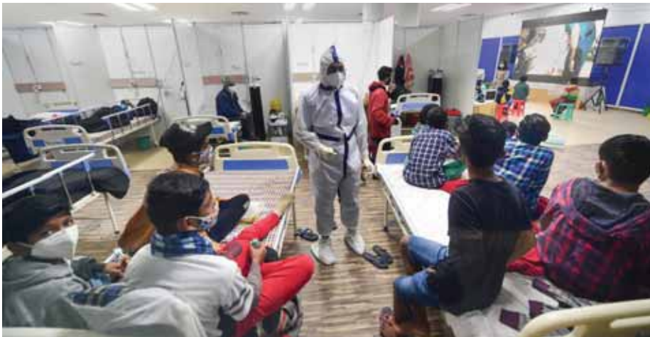
A health worker interacts with Covid-19 infected children inside the Covid Care Centre of the Commonwealth Games Village, in New Delhi, on Sunday

The Prime Minister's (PM) high-level meeting was held a day after the Election Commission of India (ECI)