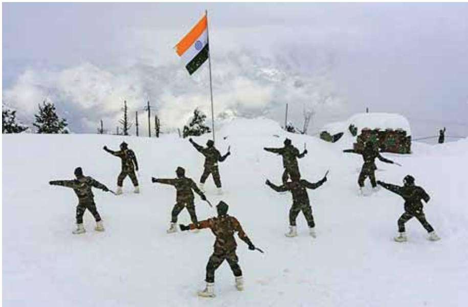
Troops of the Indian Army perform 'Khukuri Dance' in the snow-clad ranges of the Tangdhar sector in the Kupwara district of North Kashmir