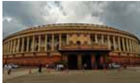
a Parliament Secretariat official said.

"The customary joint address to the Parliament by the President of India before the Union Budget requires a month-long preparation as the minutest details have to be worked upon. But the Secretariat will leave no stone unturned for a smooth Presidential Address and presentation of the Union Budget"