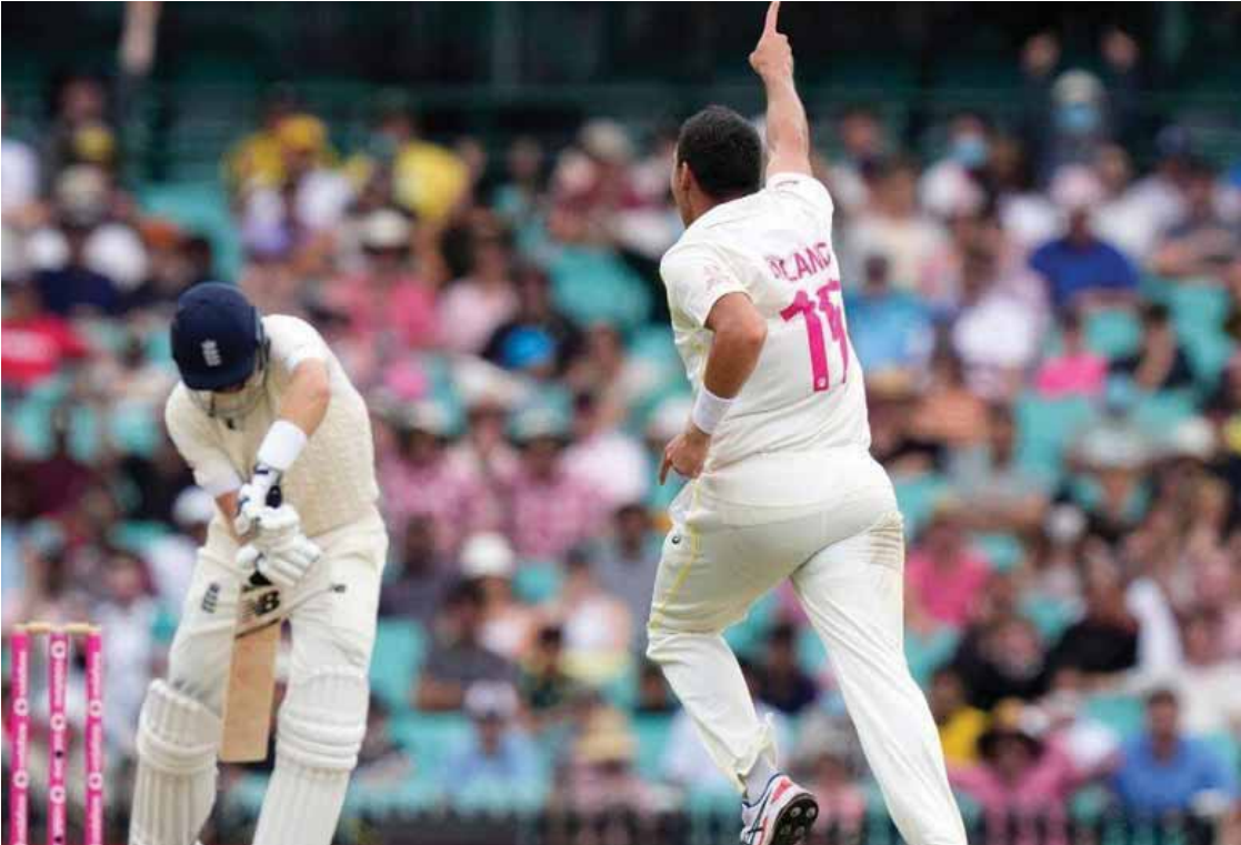
Nathan Lyon and Steve Smith in the final three overs. Earlier in the session, Stokes, no stranger in proving to be an immovable object for Australia after his heroics in the 2019 Ashes series in England, did not appear to let the pain of his left side injury curtail his attacking shots as he crushed ten boundaries and a six as part

England's tailenders resisted Australia's bowlers in fading light Sunday to clinch a draw on a dramatic final day of the fourth Test in fading light at the Sydney Cricket Ground. Jack Leach, Stuart Broad and then Jimmy Anderson batted out the final 10 overs under immense pressure, after Pat Cummins and Scott Boland took three quick wickets in the final session before Steve Smith removed Leach with two overs remaining to set up a nervous finale to a gripping test match. At stumps, England finished 270-9 with Broad unbeaten on eight and Anderson not out on zero to give England its best result of the five-match series which Australia leads 3-0. With the final hour approaching, Cummins removed Jos Buttler and Mark Wood in the space of three balls to turn the test on its head after it was looking increasingly likely that England would earn a draw after its most determined batting effort of the series. Scott Boland then continued his incredible start to test cricket by having first-innings centurion Jonny Bairstow caught at bat pad by Marnus Labuschagne for 41. It was Boland's 14th wicket in just his second test after making his test debut at Melbourne's 3rd test where he was named man of the match. But Broad and Leach saw out the remaining 10 overs despite Australia have all its fielders around the bat in catching positions as the fading light meant Australia had to bowl spinners