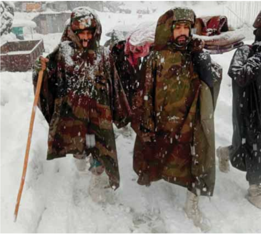
Chinar Corps of the Indian Army carry a pregnant women on a stretcher for urgent medical assistance, during heavy snowfall near Rannagiri in Shopian

New Delhi: Covid vaccination certificates issued in the five poll-bound states will not have Prime Minister Narendra Modi’s photo since the model code of conduct has come into force there, official sources said on Sunday. The Union Health Ministry has applied necessary filters on the Co-WIN platform to exclude Modi’s photo from the vaccine certificate, a source said. According to sources, the filters were applied on Saturday night soon after the poll schedule was announced. Assembly elections in Uttar Pradesh, Uttarakhand, Punjab, Manipur and Goa will be held between February 10 and March 7 in seven phases with the counting of votes on March 10, the Election Commission announced on Saturday. With the announcement of the schedule, the Model Code of