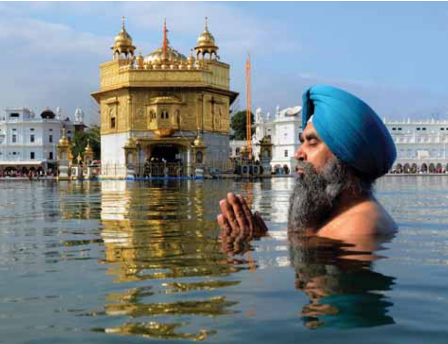
A devotee takes a dip in the holy sarovar (pond) on the occasion of the birth anniversary of the 10th Sikh Guru Gobind Singh, at the Golden Temple in Amritsar on Sunday