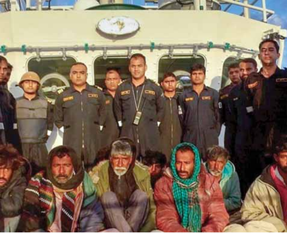
Indian Coast Guard (ICG) personnel with 10 crew members of the Pakistani boat 'Yaseen', who were apprehended by them from Indian waters at Arabian Sea on Saturday night

'Ankit' during an operational patrol at the Arabian Sea apprehended a Pakistani fish-