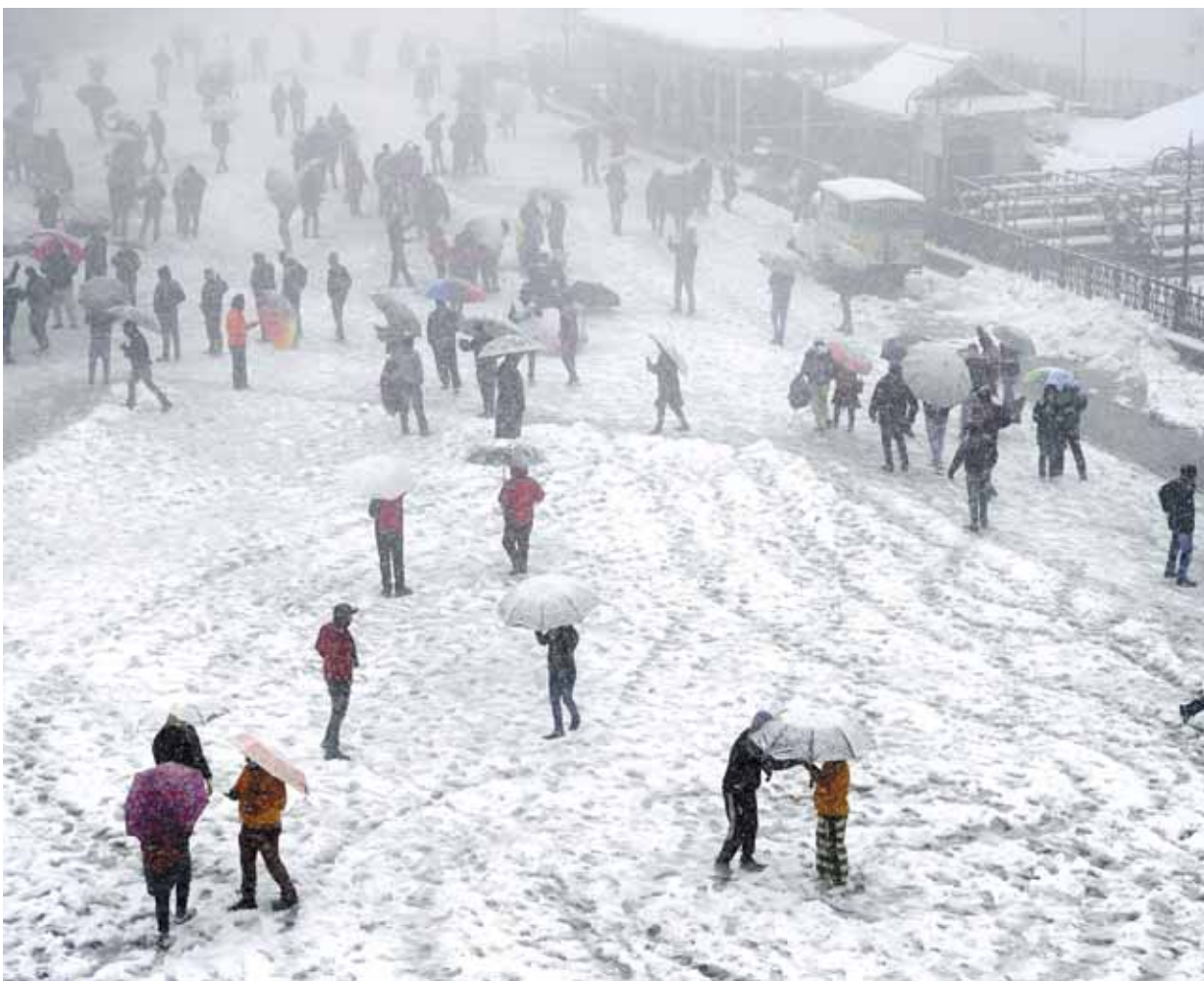
WALKING IN A WINTER WONDERLAND: Tourists and locals enjoy a walk on the Ridge during a snowfall in Shimla, on Sunday

The magnitude of land holding, location of land in approximately 4,900 pockets across the country, inaccessible terrain in many places and the association of various stakeholders makes this survey one of the largest land surveys in the country. Continued on page 2