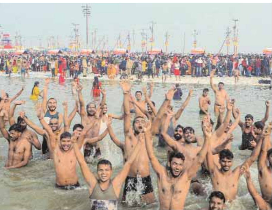
Devotees react as they take a holy dip in the Ganga river on ‘Makar Sankranti’ in Prayagraj, on Friday

doses with Maharashtra,” the statement added. At a meeting of Chief Ministers and ministers of various states called by Prime Minister Narendra Modi to take stock of the Covid-19 situation across the country, the Maharashtra government had asked the Centre to provide 40 lakh Covaxin and 50 lakh Covishield doses to increase the vaccination coverage. Talking to media persons after the meeting, State Public Health Minister Rajesh Tope had said: “Covaxin is required for the vaccination for the 15-18 age group and Covishield for people over 60 years of age and the frontline workers.”