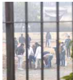
National Security Guard and police personnel cordon off the area after an Improvised Explosive Device was found inside a bag, at Ghazipur flower market in New Delhi on Friday.

An FIR have been registered at Delhi Police Special Cell under the Explosives Act and a police team will also be receiving a detailed report by the NSG on the IED samples collected. According to National Security Guard