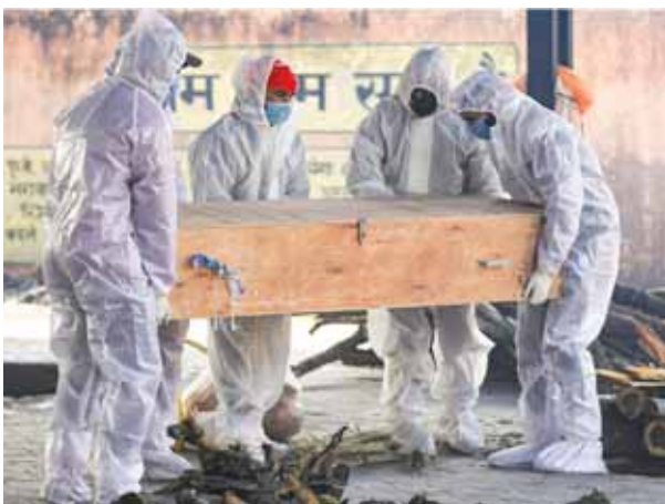
Relatives and health workers wearing PPE carry the body of a Covid-19 victim for cremation, at Shastri Nagar cremation ground in Jammu on Friday.

Overall, fresh Covid-19 cases in India rose by 7 per cent to nearly 2.64 lakh in the last 24 hours, a day after a record rise of more than 50,000 had