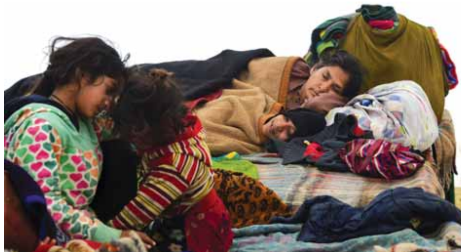
The homeless rest inside a night shelter on a cold winter morning, in New Delhi, Sunday

Meanwhile, various regions of North India on Sunday witnessed foggy conditions that