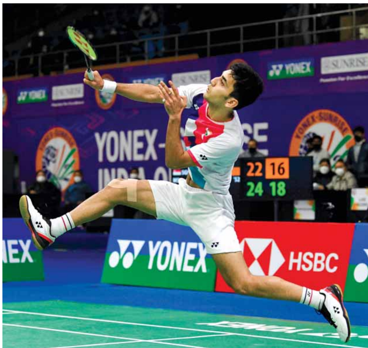
India's Lakshya Sen produced a magnificent effort to beat world champion Loh Kean Yew of Singapore 24-22 21-17 in the final of men's singles at the Indian Open. This is Sen's first BWF World Tour Super 500 title and third overall