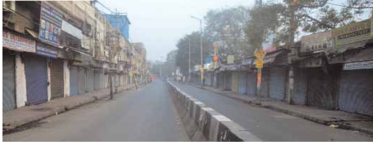
Closed shops at a market during the weekend curfew imposed by the Delhi Government to curb the spread of Covid-19, in New Delhi on Sunday