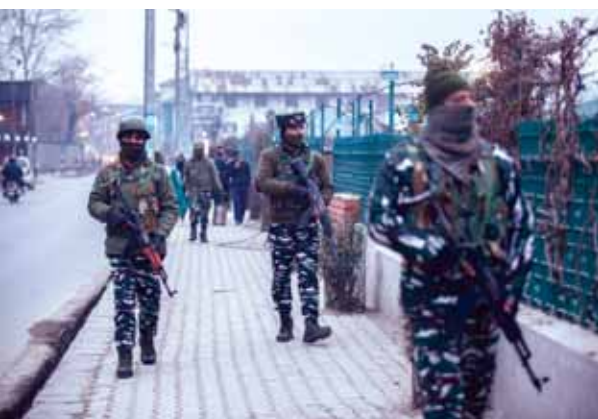
Paramilitary soldiers patrol a closed market during a weekend lockdown in Srinagar. Authorities announced complete restriction on non-essential movement during weekends to curb the spread of the coronavirus

vaccination drive as it completes a year, Prime Minister Narendra Modi said it has added great strength to the fight against the pandemic and has resulted in saving lives and protecting livelihoods.