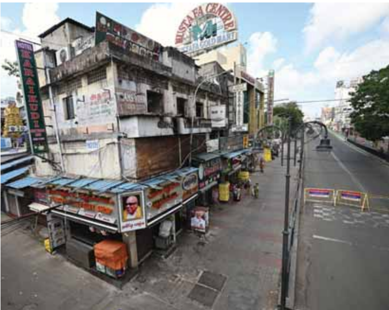
Deserted roads during full lockdown imposed by Tamil Nadu Government to curb the spread of Covid-19, at T Nagar in Chennai, on Sunday (L), needy collect free food distributed by volunteers during full lockdown in front of Central Railway Station in Chennai, on Sunday (R)