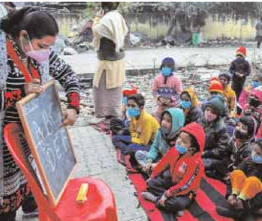
A volunteer teaches underprivileged children in an open classroom in Moradabad, on Sunday

From Page 1 On this occasion, Akhilesh Yadav said that people of Dalit and Backward society have understood that the BJP is working on the policy of privatisation so that reservation can be abolished and the Constitution of the country can be weakened.