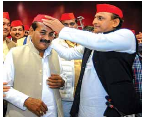
Former UP minister Dara Singh Chauhan (L) joins the Samajwadi Party in presence of party president Akhilesh Yadav, at party office in Lucknow, Sunday

"All the Dalit and backward society people have now been mobilised. Nothing can stop