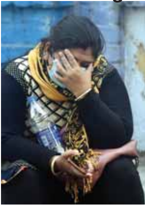
A relative of a Covid patient waits outside a State Government-run Covid hospital, amid concern over spread of Covid-19, in Kolkata, on Sunday

Kolkata: West Bengal's Covid-19 tally rose to 18,82,761 on Saturday as 19,064 more people tested positive for the infection, 3,581 less than the previous day, a health bulletin said. The State's coronavirus death toll rose to 20,052 as 39 more patients succumbed to the infection, the highest single-day toll since the recent surge in Covid-19 cases, it said. West Bengal's positivity rate slightly improved to 29.52 per cent from 31.14 per cent on the previous day, the bulletin said. Kolkata recorded 4,831 new cases, 2,036 less than the previous day, followed by 3,496 infections in neighbouring North 24 Parganas district, it said. The metropolis registered the highest number of fresh