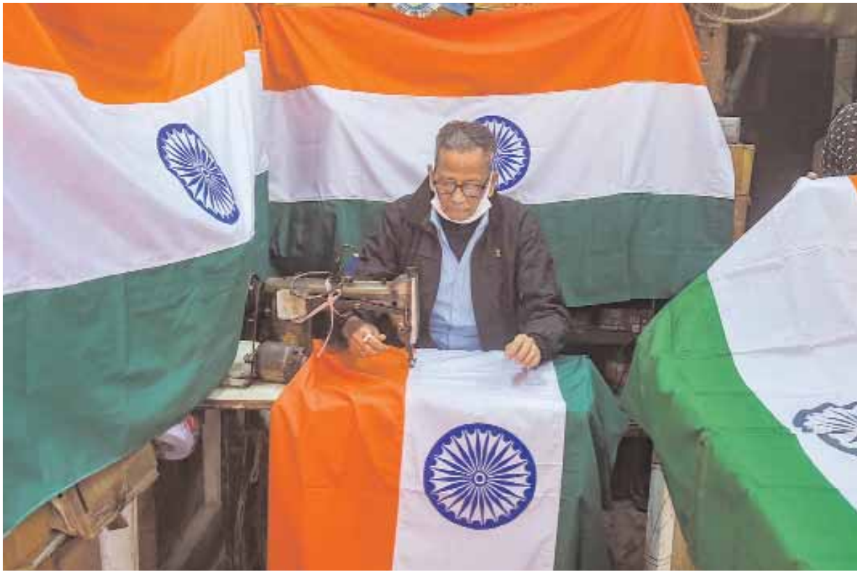
A tailor stitches national flags at his workshop-cum-shop ahead of the Republic Day celebration in Kolkata on Thursday

On its part, the BJP – which has emerged as the single largest in the Nagar Panchayat polls in the State –has captured power in 25 urban self bodies, while it expects to capture power in six other Nagar Panchayats.