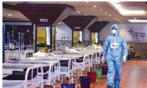
A medic walks inside the Shehnai Banquet Hall, a Covid-19 care centre, in New Delhi on Thursday

Similarly, Karnataka too saw a huge surge Thursday recording 47,754 fresh cases. Out of these cases, 30,540 are