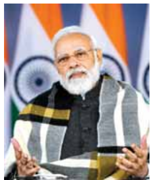
Prime Minister Narendra Modi addresses a programme organised by Brahma Kumaris as part of national launch ceremony of 'Azadi Ka Amrit Mahotsav se Swarnim Bharat Ke Ore' via video conferencing, in New Delhi

Lok Sabha Speaker Om Birla, Rajasthan Governor Kalraj Mishra, Rajasthan Chief Minister Ashok Gehlot, Gujarat Chief Minister Bhupendra