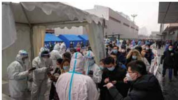
Medical workers scan codes on people's smartphones at a mass coronavirus testing site in Beijing on Monday

The Omicron variant is also constantly moving northwards with infection prevalent