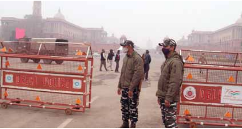
Security beefed up at Rajpath in view of the forthcoming Republic Day celebrations, in New Delhi on Monday

These personnel include deputy commissioners of police, assistant commis-