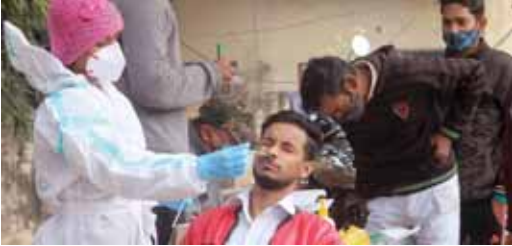
A health worker wearing personal protective equipment collects a nasal swab sample to test for the Covid-19 virus in New Delhi on Monday Ranjan Dimri | Pioneer

On January 13, Delhi had reported 28,867 Covid-19 cases, the sharpest single-day spike since the beginning of the pandemic. With the addition of new cases on Monday, the active Covid-19 cases in Delhi stands at 39,380. Of these, 36,838 patients are in home isolation. A total of 2,290 Covid-19 positive patients are admitted in hospitals, of which 808 are on oxygen support, including 160 patients who are on ventilators, the data showed.