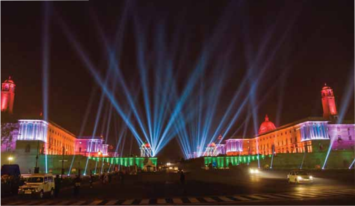
Government buildings along the Rajpath, illuminated in the colours of the Tricolour ahead of Republic Day, at Vijay Chowk in New Delhi on Monday