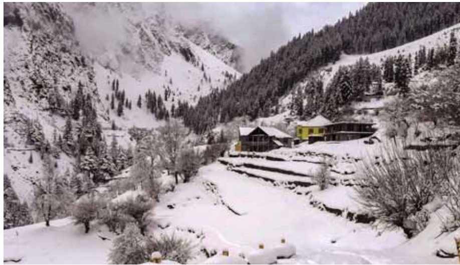
Snow-covered Salgran village following fresh snowfall in Lahaul &amp; Spiti district on Monday

Due to this, Mumbai's Air Quality Index (AQI) on Monday rose to a whopping 502, as per the System of Air Quality Weather Forecasting