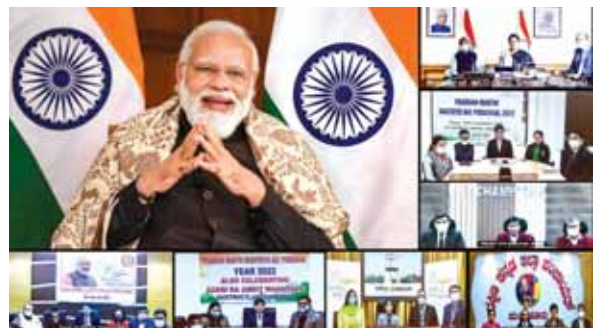
Prime Minister Narendra Modi with the Pradhan Mantri Rashtriya Bal Puraskar awardees, through video conferencing, in New Delhi on Monday