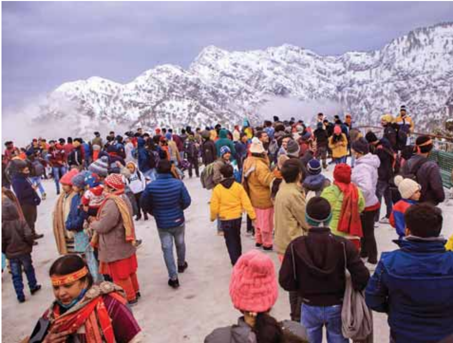
Devotees walk on the snow-covered path leading to the shrine of Mata Vaishno Devi after heavy snowfall, near Katra in Reasi district on Monday