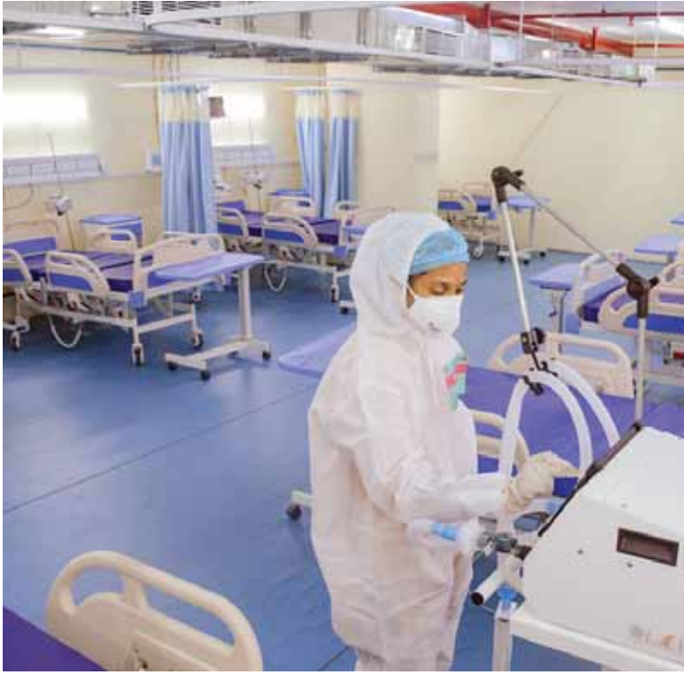
A health worker prepares a pediatric Covid-19 ward at a hospital, in preparation for potential Covid-19 spread among children, after schools reopened for all classes in Maharashtra, in Thane on Monday

Later in the evening, Pawar thanked all those who wished him and prayed for his speedy recovery. "I am in good health and taking all the necessary precautions as advised by my doctor. Thank you for your prayers and good wishes for a speedy recovery," the NCP chief tweeted.