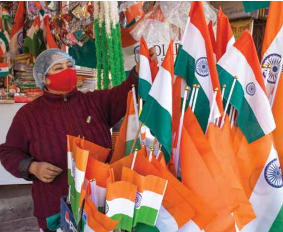
A vendor selling Tricolor flags waits for customers ahead of Republic Day, in Guwahati on Monday

Taylor said that after this incident he was suffering from stress which severely impacted his mental and physical health. "The 'businessman' wanted a return on his investment which I could not and would not give. It took me four months to report this offense and interaction to the ICC," said Taylor, adding that ICC is going to impose a multi-year ban on him. "And so, I would like to let you know that on Tuesday January 25 I am checking into a rehabilitation center to get clean and to get my life back on track," said Taylor in his four-page long letter.