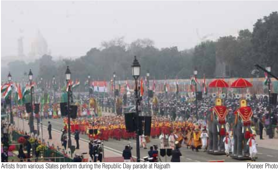
Artists from various States perform during the Republic Day parade at Rajpath