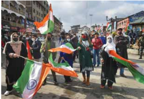
Social activists hold national flags during Republic Day functions at Lal Chowk in Srinagar on Wednesday