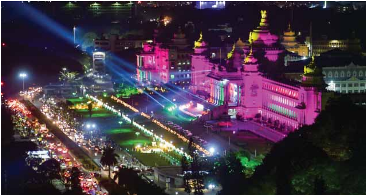
An illuminated Vidhana Soudha during the 73rd Republic Day celebrations, in Bengaluru, on Wednesday

The data is also presented in a break-up in terms of how long cases have been pending, from 0-5, 6-10, 11-20, 21-30, 31-40 years and 40-plus years. The justice clock also shows the Case Clearance Rate.