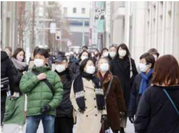
People wearing face masks to protect against the coronavirus walk on a street Wednesday, Jan. 26, 2022

Earlier this month, the previous highest number of cases - 9.5 million - was recorded amid a 71 per cent spike from the week before, as the hugely contagious omicron variant swept the world. WHO