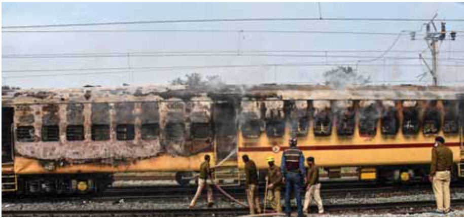
Railway Protection Force personnel try to douse the fire in a train set ablaze by aspirants, during their protest over alleged erroneous results of Railway Recruitment Boards-Non Technical Popular Categories (RRB-NTPC) exams, at Gaya Junction railway station on Wednesday

The job aspirants set a train on fire in Gaya in Bihar, engaged in stone pelting, and resorted to violence at several