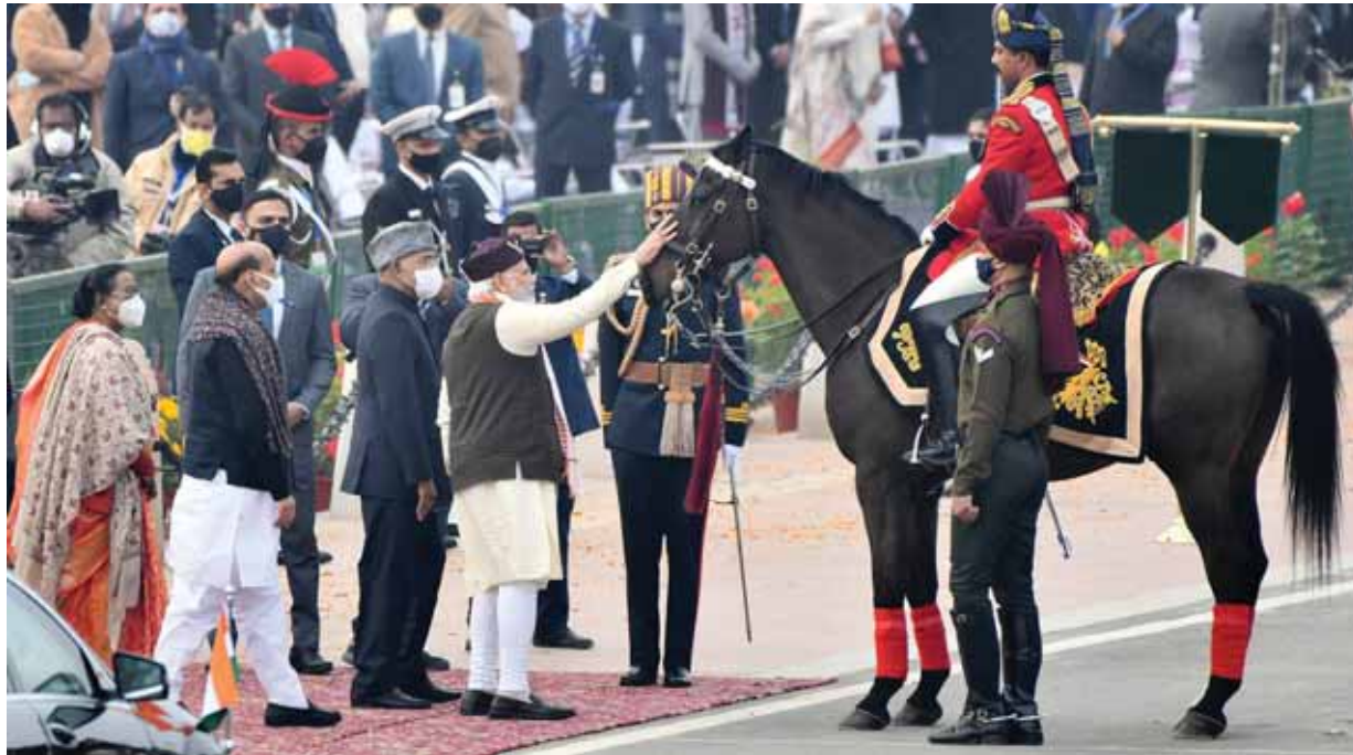
Prime Minister Narendra Modi caresses an elite horse guard "Virat" after the Republic Day Parade 2022