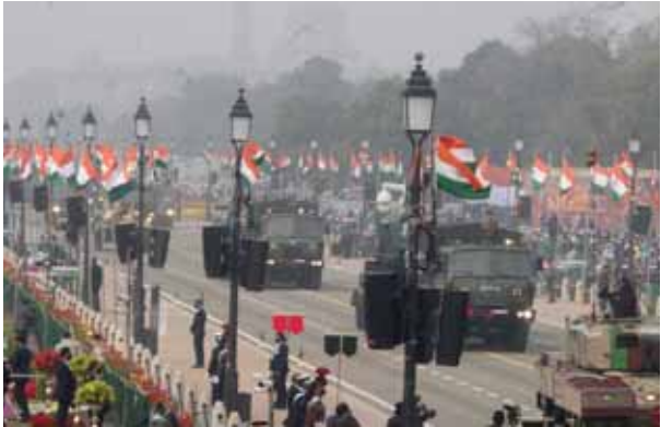
Army tanks being displayed during the Republic Day parade at Rajpath