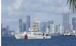
The U.S. Coast Guard ship Bernard C. Webber, leaves the coast guard base, Monday, July 19, 2021, in Miami Beach, Fla. The U.S. Coast Guard is searching for 39 people after a good Samaritan rescued a man clinging to a boat off the coast of Florida

Migrants have long used the islands of the Bahamas as a steppingstone to reach Florida and the United States. They typically try to take advantage of breaks in the weather to make the crossing, but the vessels are often dan-