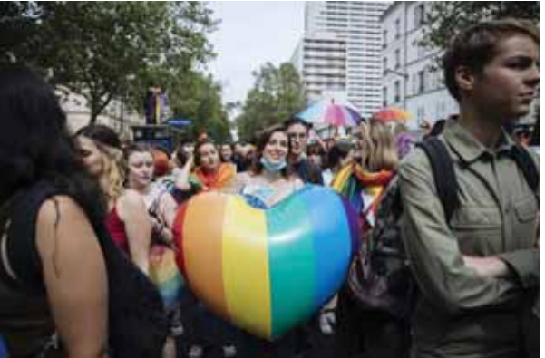
FILE - A participant holds a rainbow heart during the annual Gay Pride march in Paris, June 26, 2021. The National Assembly approved a new law unanimously Tuesday Jan. 25, 2022 evening, putting into law new measures that ban so-called conversion therapies and authorize jail time and fines for practitioners who use the scientifically discredited practice to attempt to change the sexual orientation or gender identity of LGBTQ people. The legislation includes criminal penalties for people who are convicted of trying to "convert" LGBTQ people to heterosexuality or traditional gender expectations

The French government's equalities and diversity minister, Elisabeth Moreno, described so-called conversion therapies