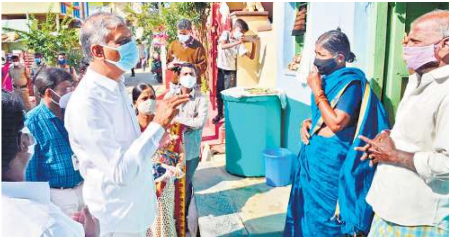
Minister for Health T Harish Rao interacting with people as part of door-to-door fever survey in Siddipet on Saturday

The Minister said that door to door fever survey is being implemented to check the spread of the disease and sought cooperation of the people to the exercise. The government has kept the test and home isolation kits ready to face any eventual-ity. The minister was interact-