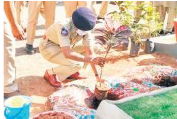
Police Commissioner N Swetha planting a sapling at Gajwel police station on Saturday