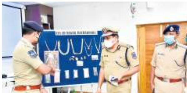
Police officials displaying seized gold ornaments in Hyderabad on Saturday