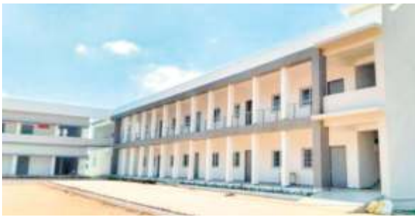
A school renovated with the aid from MJR Trust in Nagarkurnool district