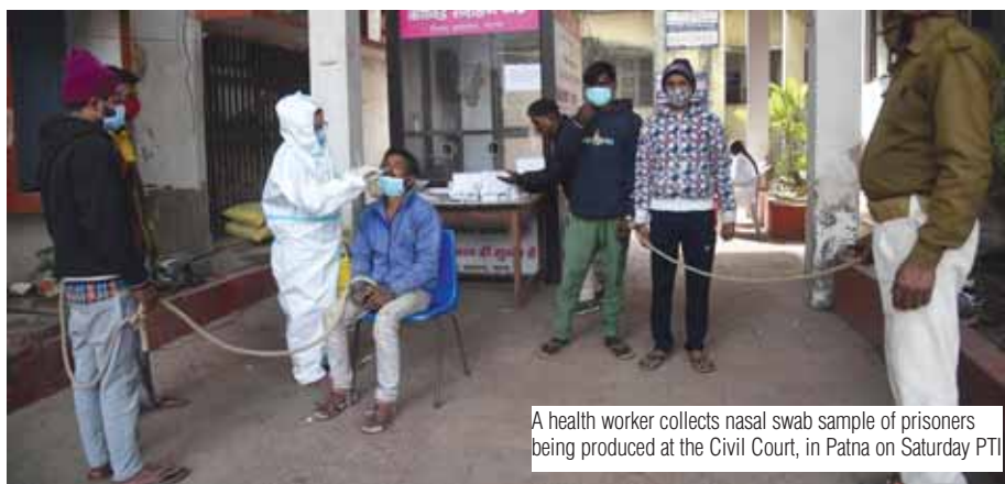
A health worker collects nasal swab sample of prisoners being produced at the Civil Court, in Patna on Saturday

"Omicron is now in community transmission in India and has become dominant in