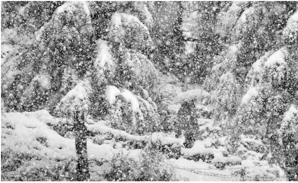
A woman walks through a trail during heavy snowfall in Dharmasala on Sunday