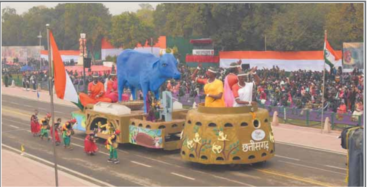
Chhattisgarh's tableau depicting the state's "Godhan Nyay Yojana" on Sunday took part in the full-dress rehearsal of the Republic Day parade at Rajpath in New Delhi.

A court sent the Naxalite to judicial custody.