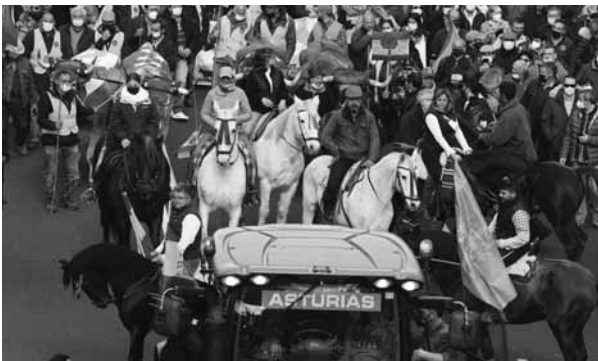
People on horseback follow a tractor during a march in defence of Spanish rural areas during a protest in Madrid, Spain, Sunday, Jan. 23, 2022. Members of rural community are demanding solutions by the government for problems and crisis in the Rural sector

Farmers, cattle-breeders, hunters and opposition supporters descended Sunday on the Spanish capital of Madrid to protest environmental and economic policies by Spain's left-of-center government that they say are hurting rural communities. Sunday's protest was organized by Alma Rural 2021, a platform representing over 500 rural organizations from all corners of Spain. Members of opposition parties, ranging from centrists to far-right supporters, also attended. The demonstration came as Spanish politicians are campaigning before an early election in Castilla-Leon, a vast region northeast of Madrid where proposals against depopulation and agricultural policies are taking center stage. Carlos Bueno, head of Alma Rural 2021, said the protest aimed to