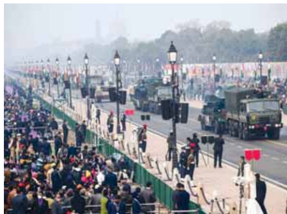
Army columns on display during the full dress rehearsal of the Republic Day Parade 2022, at the Rajpath in New Delhi, Sunday

Overall, the parade will see six marching contingents