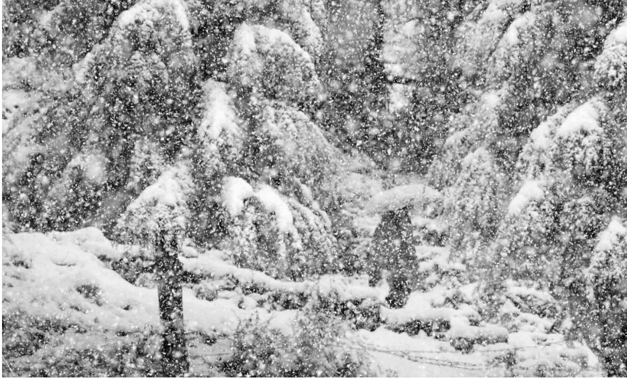
A woman walks through a trail during heavy snowfall in Dharmasala on Sunday