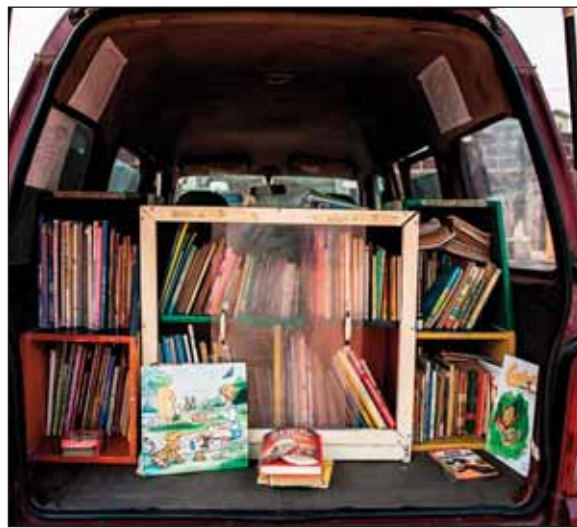
Representational picture of a mobile van with books. File