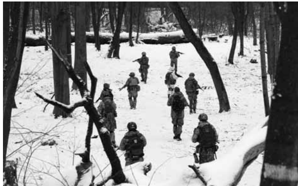
Members of Ukraine's Territorial Defense Forces, volunteer military units of the Armed Forces, train in a city park in Kyiv, Ukraine, Saturday. Dozens of civilians have been joining Ukraine's army reserves in recent weeks amid fears about Russian invasion

Russia's Foreign Ministry on Sunday rejected a British claim that Russia was seeking to replace Ukraine's government with a pro-Moscow administration, and that former Ukrainian lawmaker Yevheniy Murayev was being considered as a potential candidate. Britain's Foreign Office on Saturday also named several other Ukrainian politicians it said had links with Russian intelligence services, along with Murayev who is the leader of a small party that has no seats in parliament. Those politicians include Mykola Azarov, a former prime minister under Viktor Yanukovich, the Ukrainian president ousted in a 2014 uprising, and Yanukovich's former chief of staff, Andriy Kluyev. "Some of these have contact with Russian intelligence officers currently involved in the planning for an attack on Ukraine," the Foreign Office said.