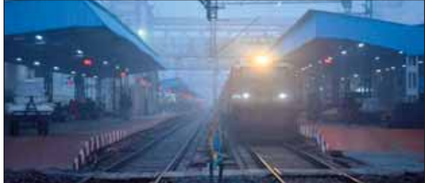
A passenger train moves slowly at railway track, amid low visibility due to fog on a cold winter morning at Hatia Railway station in Ranchi on Sunday.

Jharkhand witnessed rains and fog across all districts due to two weather phenomena affecting the weather conditions in the country. According to meteorological department the State will experience rainy weather for the next two days Monday and Tuesday due to western disturbance passing through Pakistan extending between 3.1 km and 7.6 km above mean sea level. IMD's Ranchi Meteorological Centre has said that the north and central part of Jharkhand will have the maximum impact of the weather change which is also set to bring down the temperature. After more than a week of poor weather due to western disturbance, the weather condition had improved in Jharkhand with a