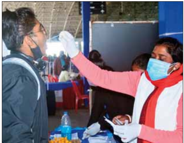
A government health worker takes swab samples from a passenger for COVID-19 test, amid concern over rising Omicron cases at Birsamunda Airport in Ranchi on Sunday.

Jharkhand has passed the peak period of the third wave of the Covid 19 pandemic during the second week of this month, after which the cases started falling. But, health experts have warned that any relaxation or compromise with the Covid appropriate behaviour may trigger the spread of the virus. The health experts have said that a low mortality rate, beds in hospitals less occupied this time doesn't mean that the pandemic has reduced to the level of the common cases of cough and fever. They have pointed out that from 20 December 2021 till January 22, as many as 102 people lost their lives. However, more than 50 per cent of cases are related to comorbidity where the deceased was suffering from one or other diseases. Fifty