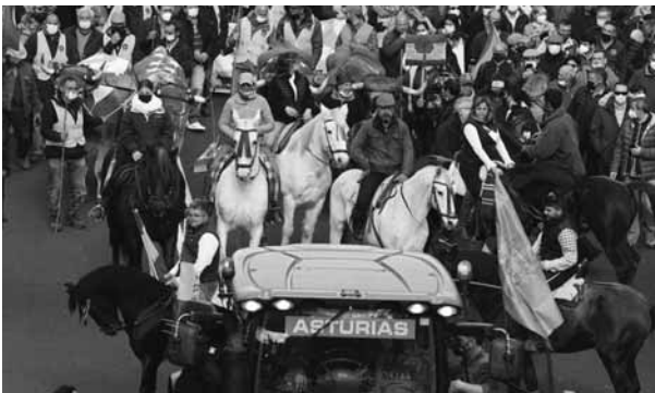
People on horseback follow a tractor during a march in defence of Spanish rural areas during a protest in Madrid, Spain, Sunday, Jan. 23, 2022. Members of rural community are demanding solutions by the government for problems and crisis in the Rural sector