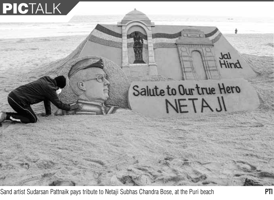
Sand artist Sudarsan Pattnaik pays tribute to Netaji Subhas Chandra Bose, at the Puri beach

Ministers have Congress roots. Tripura's is a similar case. Manipur is no different. Even the JD(U), BJP's ruling ally in Bihar, was shocked when six of its seven MLAs in Arunachal Pradesh went over to BJP. In the run-up to the current Assembly election in Uttar Pradesh, as many as 36 MLAs have switched sides benefiting the Samajwadi Party mostly, but also BJP and RLD. There is nothing to write home about when it comes to morality and ethics helping legislators resist the lure of power or other considerations to switch loyalties. State legislatures in the 1960s and 1970s witnessed several instances of brazen defections. The most glaring is the example of Gaya Lal, an independent MLA from Haryana, who changed parties twice within a few hours and for the third time a few days later. The phrase that describes turncoats, "Aaya Raam, Gaya Ram" immortalised him. The growing spate of defections led to the Anti-Defection Act but legislators took advantage of the myriad loopholes. Legislators switching sides in Karnataka in 2019 found an entirely new way to defect without punishment: They simply resigned before any activity of theirs could lead to their disqualification. Defections subvert democracy. They ridicule people's mandate. If resignation or re-election is enough to circumvent the anti-defection law, then the law needs replacing. A stronger law can revive a voter's belief in democracy better than a pledge to Him.