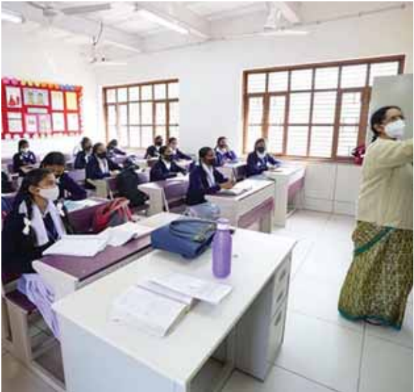
STAFF REPORTER ■ NEW DELHI

Govt school students to be assessed on impact of mindset curricula too, say DoE’s new guidelines