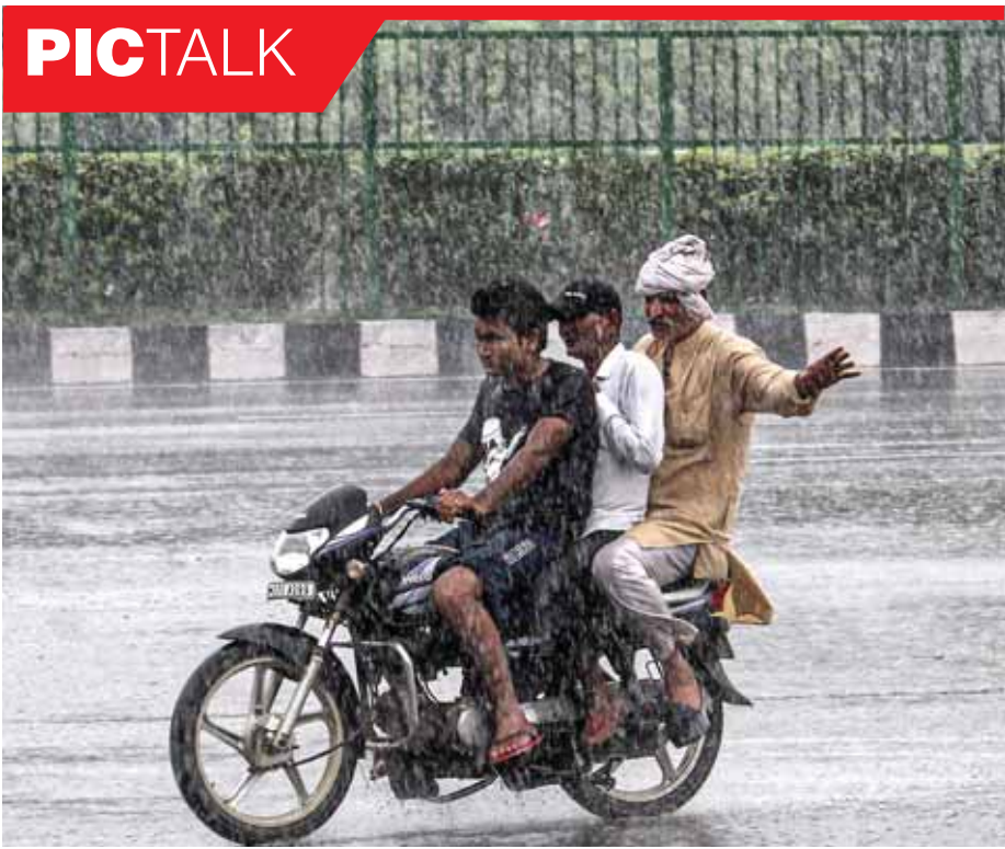
Three men brave the rain on a bike on the Delhi-Gurugram Expressway in Gurugram on Friday