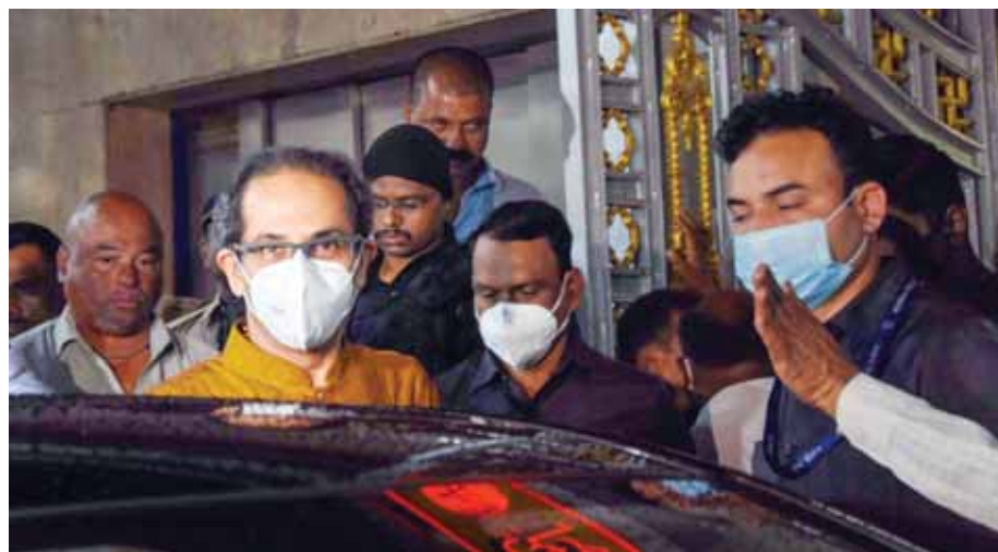
Former Maharashtra Chief Minister and Shiv Sena Chief Uddhav Thackeray arrives for a press conference at Shiv Sena Bhavan in Mumbai on Friday

"The manner in which the BJP formed a Government and appointed a so-called Shiv Sainik as the Chief Minister surprises me. After the 2019 Assembly polls, I was talking about sharing the Chief Minister's post on a rotational basis. Shiv Sena and the BJP had reached an understanding over the rotational Chief Ministership. Had then BJP president Amit Shah kept his