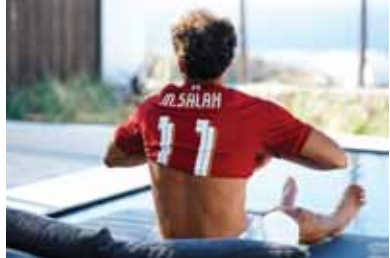
LIVERPOOL

Mohamed Salah ended speculation over his Liverpool future on Friday by signing a new contract that will reportedly run until 2025. Salah, who has scored 156 goals in 254 appearances for Liverpool, had entered the final year of his previous contract with talks stalling over the 30-year-old's wage demands. However, the Egypt forward said he has more trophies at Anfield in his sights after finally putting pen to paper. "I feel great and excited to win trophies with the club. It's a happy day for everyone," Salah told Liverpool's website. "It takes a little bit of time, I think, to renew, but now everything is done so we just need to focus on what's next." Since joining from Roma in 2017, Salah has become a fundamental part of Jurgen Klopp's side, helping establish them as serial contenders for domestic and European success.