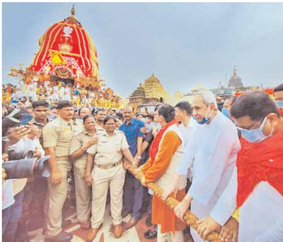
Odisha Chief Minister Naveen Patnaik pulls the chariot along with others during the annual Rath Yatra of Lord Jagannath, in Puri on Friday

Nupur Sharma said she was getting death threats so she could not go to other states for appearance in court cases. During this hearing, Justice Suryakant reprimanded Nupur Sharma in the court.