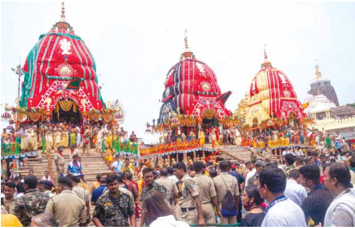
Devotees throng the chariots of Lord Jagannath, Lord Balabhadra and Goddess Subhadra during the annual Rath Yatra of Lord Jagannath which commenced amid tight security in Puri on Friday. The 'Yatra' commenced on Friday after two years of a break due to the Covid-19 pandemic