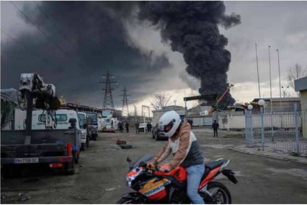
Ukraine's biggest port. The island sits along a busy shipping lane.

The airstrikes followed the pull-out of Russian forces from Snake Island on Thursday, a move that was expected to potentially ease the threat to nearby Odesa, home to