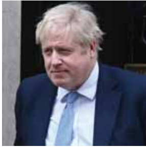
LONDON

British Prime Minister Boris Johnson, still under the shadow of the partygate scandal of COVID law-breaching parties in Downing Street, has been hit with yet another drunken scandal as an ally in charge of discipline within the governing party resigned. Chris Pincher, 52, stepped down as the Deputy Chief Whip of the Conservative Party on Thursday night after admitting in his resignation letter that he “drank far too much” and “embarrassed myself and other people”. There have been growing calls for Johnson to suspend him from the party after allegations emerged of him groping two men at a private members’ club in London. “Last night I drank far too much,” reads Pincher’s resignation letter. “I think the right thing to do in the circumstances is for me to resign as deputy chief whip. I owe it to you and the people I’ve caused upset to, to do this,” he said. “The Sun” newspaper first reported the resignation, saying the senior Conservative MP was drinking at the Carlton Club in central London when he is said to have assaulted two other male guests.