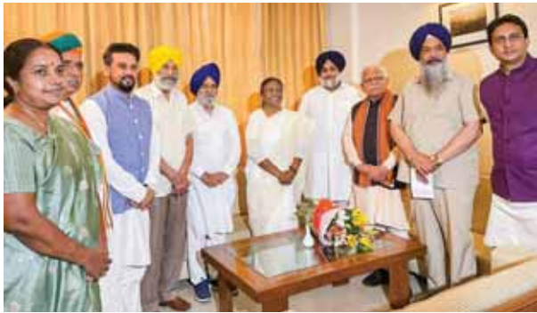
NDA presidential candidate Droupadi Murmu with Union Ministers Anurag Thakur and Arjun Ram Meghwal, and Haryana Chief Minister Manohar Lal Khattar meets Shiromani Akali Dal President Sukhbir Singh Badal and other leaders

New Delhi: The Shiromani Akali Dal (SAD), which exited from NDA in the wake of the farmers’ agitation and former Prime Minister HD Deve Gowda’s Janata Dal (S) on Friday announced support for NDA’s presidential nominee Draupadi Murmu. SAD chief Sukhbir Singh Badal said that they have decided to support the NDA’s presidential candidate. He said they would never go with the Congress because of the atrocities they had committed on the Sikh community. PNS