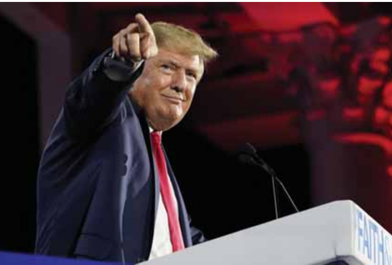
AP ■ SIOUX CENTER (IOWA)

Stunning new revelations about former President Donald Trump’s fight to overturn the 2020 election have exposed growing political vulnerabilities just as he eyes another presidential bid. A former White House aide this week described Trump as an unhinged leader with no regard for the safety of elected officials in either party as he clung to power on Jan. 6, 2021. The testimony from the congressional panel investigating the Capitol attack provided a roadmap for prosecutors to potentially charge Trump with a crime, some legal experts say. Republican voters — and Trump’s would-be rivals in the 2024 presidential race — took notice. Here in Iowa, the state expected to host the first presidential nominating contest in roughly 18 months, several voters signalled Thursday that they were open to another presidential candidate even if Trump were to run again. At the same time, some conservative media outlets issued scathing rebukes of the former pres-