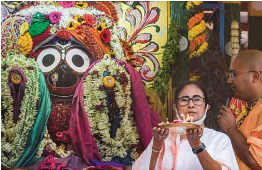
West Bengal Chief Minister Mamata Banerjee offers prayer during the 51st ISKCON Rath Yatra in Kolkata on Friday.

BJP’s national vice-president and party MP Dilip Ghosh said that this changed stance of Banerjee is because of the realisation that Yashwant Sinha will be defeated by a huge margin. “She is now claiming that had the BJP informed her in advance, she could have given a positive consideration on Murmu’s nomination. Then