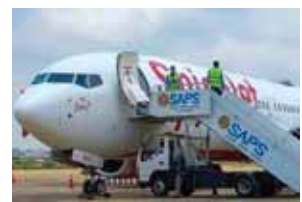
Dubai-bound SpiceJet aircraft after its landing at Karachi Airport

Two mid-air incidents on a single day occurred involving SpiceJet aircraft on Tuesday. While a SpiceJet B737 flight SG-11 (Delhi-Dubai) was diverted to Karachi due to an indicator light malfunctioning in the morning, another of its aircraft, flying from Kandla in Gujarat, made a priority landing at the Mumbai airport later in the day after its windshield cracked at 23,000 feet altitude.