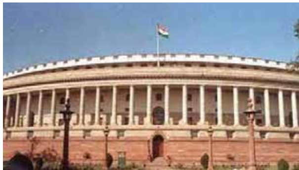
Exterior view of the Rajya Sabha Secretariat building in New Delhi.

The Rajya Sabha Secretariat that came into being with about 200 officers and staff in 1952 has expanded to 1,700 personnel now with 10 different services with the needs of the times. The reviews of the working of the secretariat undertaken so far by parliamentary pay committees and a couple of internal committees were limited to staff requirement, their salaries.