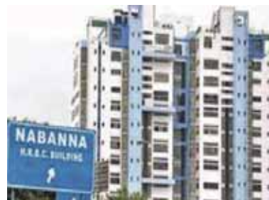
Exterior view of the Nabanna residential complex in Kolkata.

The Bengal Government has banned using mobile phones by visitors and the police staff, inside the residential premises of Bengal Chief Minister Mamata Banerjee. Visitors and policemen on duty will also not be allowed to use their phones at State secretariat Nabanna which houses the Chief Minister's office.