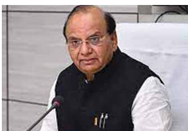
removal of electric poles and power transformers have been

Sources said that Lt Governor was informed that most of the work related to