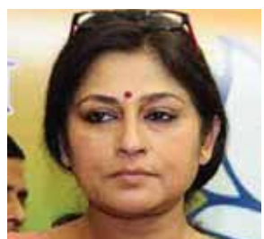
Portrait of Rupa Ganguly.

Even as Bengal BJP leaders continued to leave the party to join the Trinamool Congress, there were speculations about former saffron Rajya Sabha MP Rupa Ganguly's future course of action after she was scene holding discussions with Trinamool Congress spokesperson. According to sources the two leaders recently spoke to each other for quite sometime in the sidelines of a public programme.