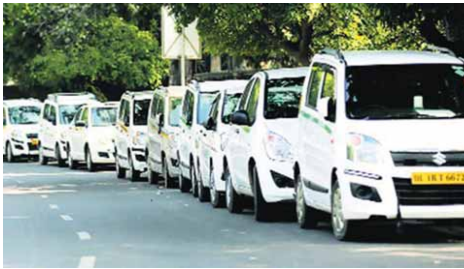
It comes into effect, the cab Aggregators cannot charge double the base fare, as specified by the Transport Department, GNCTD from time to time. They will only be

The draft proposed that the cab Aggregators who increase the fare during the peak hour demand and festivals period cannot double the price. Once