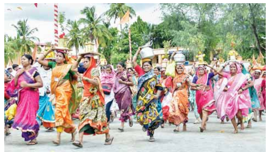
Women of the 'Varkari' movement run with tulsii plant on their head as they participate in 'Gol Ringan' during Sant Tukaram Maharaj Palkhi procession, in Solapur.

The CGHS covers all current and retired Central Government staff and kin. The OPD consultation charge for a CGHS beneficiary at most of the empanelled hospitals, including Max, Fortis, Medanta, etc, is Rs 150 per visit, while non-CGHS rates at these hospitals range from Rs 500 to Rs 2,000.