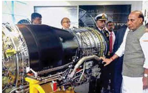
Defence Minister Rajnath Singh with French company Safran Group delegation.

The MRO facility through direct foreign investment of $US 150 million in Hyderabad is expected to create 500-600 highly skilled jobs. The facility will be able to overhaul over