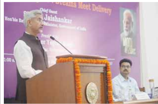
Union External Affairs Minister S Jaishankar during a discussion on the book 'Modi@20: Dreams Meet Delivery', at Delhi University on Tuesday.