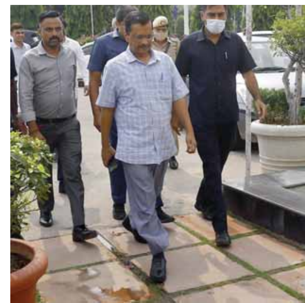
There are talks that Delhi might be converted into a Union Territory but Delhiites will not stand it: Kejriwal