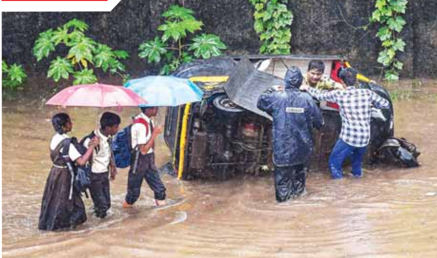
Students walk past as people try to repair an auto-rickshaw on a flooded road amid heavy rain, in Mumbai