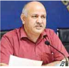
Deputy CM Manish Sisodia

In a statement, Raj Niwas said that the L-G was deeply concerned over the conditions of maintenance, disrepair and cleanliness of roads and footpaths in the National Capital. Even after launching the cleanliness drive to clear the roads of debris and encroachments he stroved to get all road-owning agencies like MCD, NDMA,