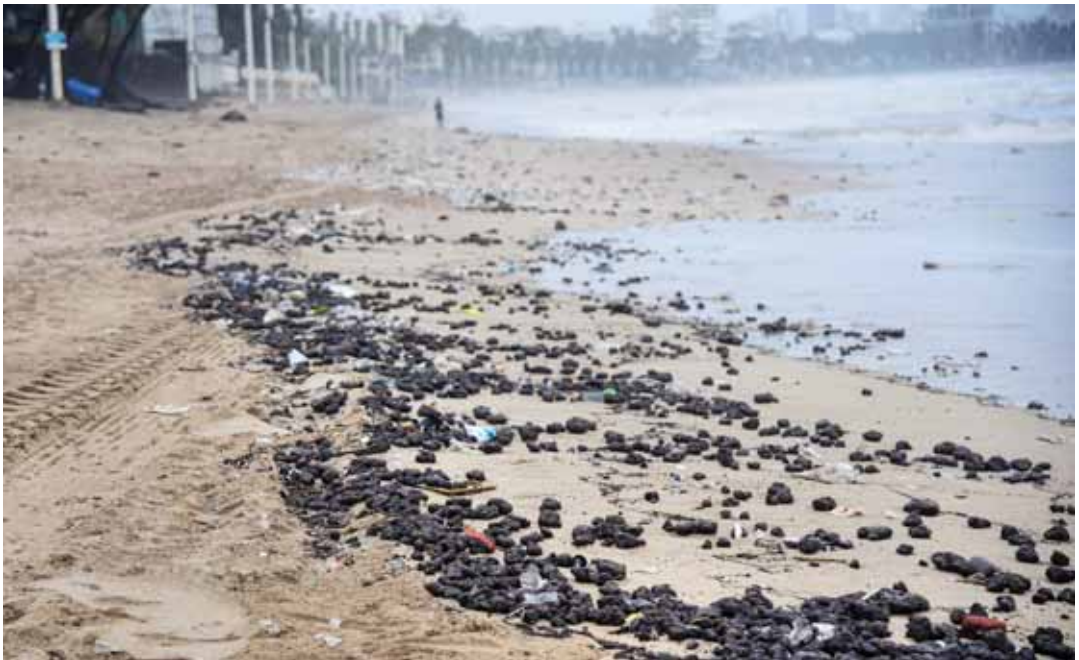
Tarballs seen along the Juhu beach in Mumbai on Friday

The opposition candidate contesting against NDA nominee is former Minister in Vaipayee government Yashwanth Sinha. JMM, the ruling party in Jharkhand- a tribal party- is also considering support to Murmu but has yet not made any official announcement to effect.