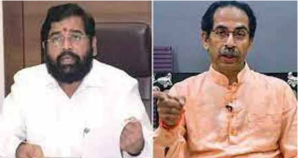
PTI ■ NEW DELHI

The Supreme Court on Friday agreed to hear on July 11 a fresh plea of the Uddhav Thackeray led faction challenging appointment of Eknath Shinde as chief minister of Maharashtra.