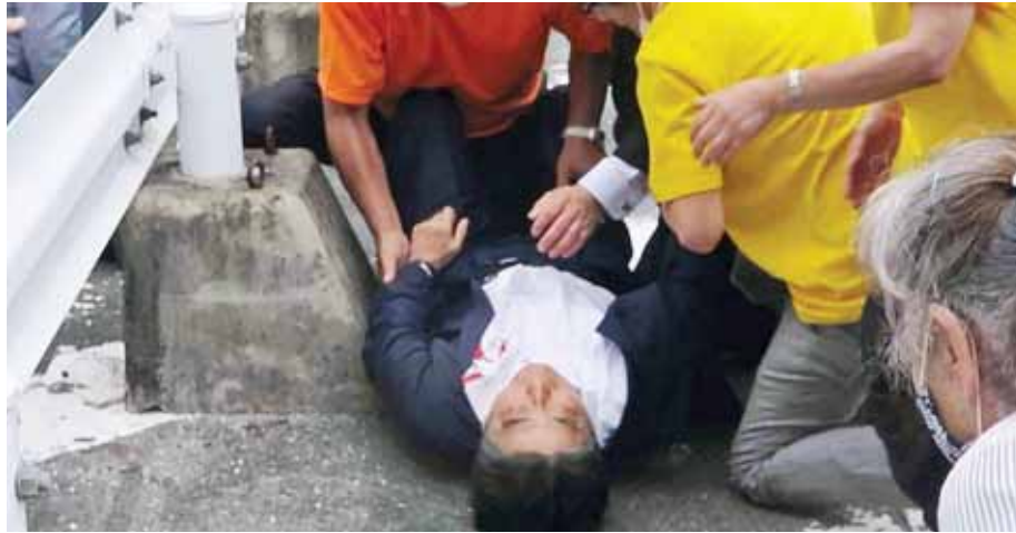
In this image from a video, Japanese former Prime Minister Shinzo Abe is attended on the ground in Nara, western Japan, after being shot on Friday