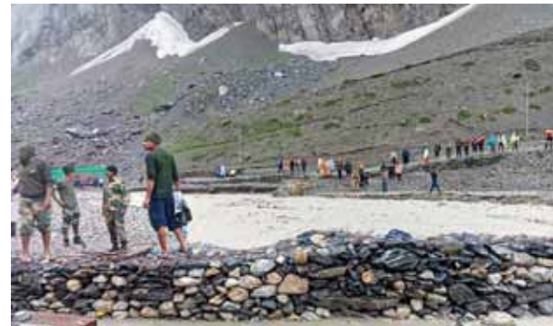
Rescue operation after a cloudburst that hit near the base camp of the holy cave shrine of Amarnath in south Kashmir Himalayas on Friday

According to preliminary reports, the cloudburst hit the Amarnath cave shrine area around 5.30 pm in which about two dozen tents/langars were washed away. Due to the huge presence of pilgrims in the area, several were washed away in