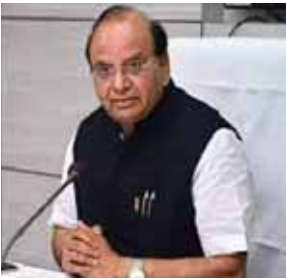
LG Vinai Kumar Saxena

The L-G applauded the seamless coordination between various road owning agencies- Municipal Corporation of Delhi (MCD), New Delhi Municipal