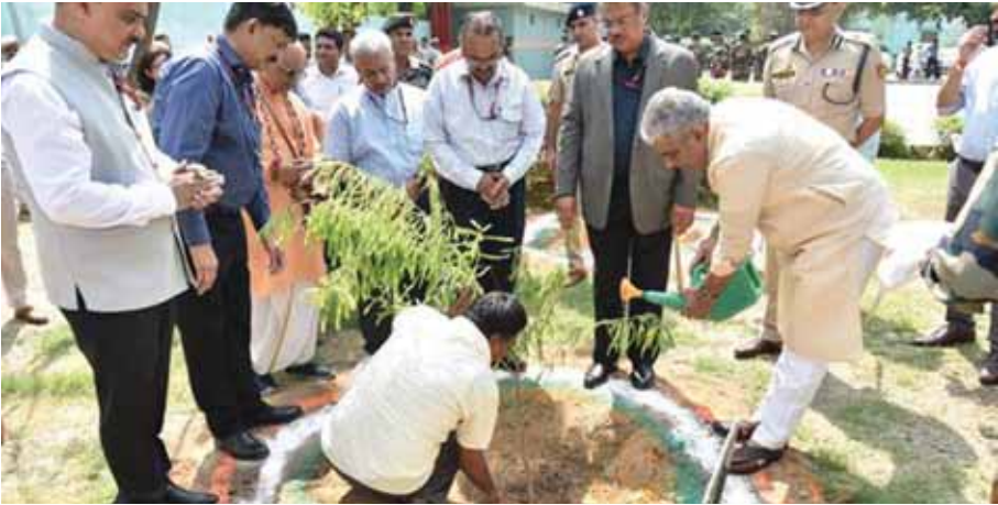
Union Environment Minister Bhupender Yadav plants a sapling at an event "Hariyali Mahotsav" — Tree Festival on Friday at Talkatora Stadium, New Delhi, celebrating the nation's zeal for planting trees and saving forests. The event was organised in collaboration with the State Governments, police institutions of the Delhi Government for undertaking plantation drives creating awareness about the importance of trees to protect Mother Earth

Khan's demand came after former chief minister and member of G-23 Prithviraj Chavan claimed that seven party legislators indulged in cross-voting and party should take action against them. AICC sources said that Prakash has been tasked to prepare a report which includes the fall of the coalition MVA government with Shiv Sena and NCP as other prime partners.