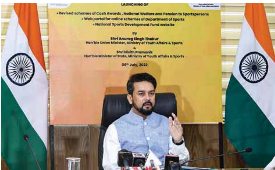
Union Minister for Youth Affairs and Sports & Information & Broadcasting Anurag Singh Thakur speaks at the launch of the web portal of the revised schemes of cash prizes, national welfare and pension to sportspersons, in New Delhi on Friday