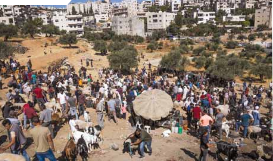
Palestinians at a livestock market in preparation for Eid al-Adha, in the West Bank city of Bethlehem