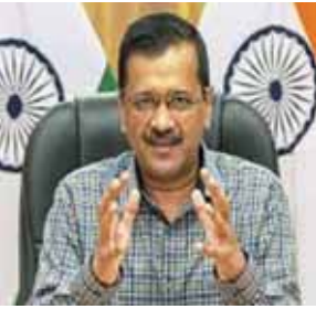
CM Arvind Kejriwal

This has led to the Raj Niwas to issue a statement saying the order by the Chief Secretary to all road owning agencies to undertake repair/maintenance/improvisation works of at least one road per zone (end to end -on both sides) along the length