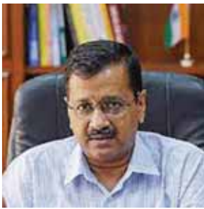
STAFF REPORTER ■ NEW DELHI

The AAP on Saturday dubbed the setting up of a delimitation commission for Delhi by the Union Home Ministry as an "eyewash" and alleged that it is yet another "tactic" of the BJP-led Centre to further delay the municipal polls in the national Capital. The party also contended that the Home Ministry cannot set up a delimitation commission before it determines the total number of municipal wards in accordance with the provisions of the amended Delhi Municipal Corporation Act and termed the move "illegal". "We are happy that the Centre has constituted a committee for delimitation of MCD wards. But no order has been issued on how many wards will