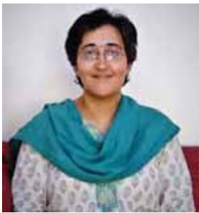
STAFF REPORTER ■ NEW DELHI

The AAP on Saturday dubbed the setting up of a delimitation commission for Delhi by the Union Home Ministry as an "eyewash" and alleged that it is yet another "tactic" of the BJP-led Centre to further delay the municipal polls in the national Capital. The party also contended that the Home Ministry cannot set up a delimitation commission before it determines the total number of municipal wards in accordance with the provisions of the amended Delhi Municipal Corporation Act and termed the move "illegal". "We are happy that the Centre has constituted a committee for delimitation of MCD wards. But no order has been issued on how many wards will