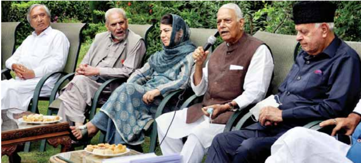
Presidential candidate of the combined Opposition parties Yashwant Sinha interacts with president of National Conference and People's Alliance for Gupkar Declaration (PAGD) Farooq Abdullah, PAGD leader Mehbooba Mufti, CPI-M Leader Yousuf Tarigami and other PAGD leaders during their meeting, at Farooq Abdullah's residence in Srinagar on Saturday

around 60 percent of people with cirrhosis within 10 years of their diagnosis, and the 2-year survival rate is 50 percent. Patients suffering with ascites may have the symptoms like painless swelling in the abdomen that worsens rather than going away; abdominal discomfort; weight gain; feeling full after eating a little, shortness of breath as pressure increases in the abdomen, pushing up on the diaphragm and reduction in the space for the lungs to expand.