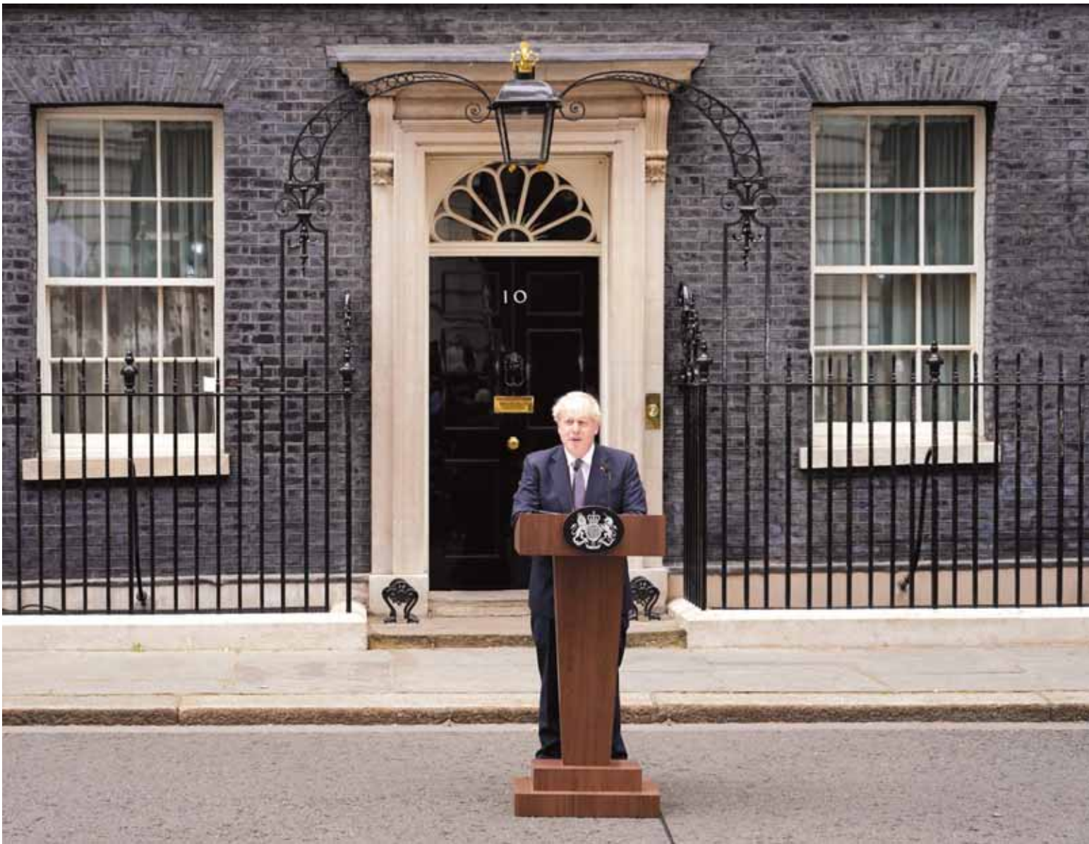
UK Prime Minister Boris Johnson reads a statement outside 10 Downing Street, London, after formally resigning as Conservative Party leader, in London on July 7, 2022

Johnson came to power in July 2019. He is a rare leader who always prefers an argument of “no ifs, no buts”. He has remained as the cheerleader of Brexit, and he has finally made it when two earlier British Prime Ministers miserably failed. Both David Cameron and Theresa May had to quit the Prime Minister office primarily because of issues cen-