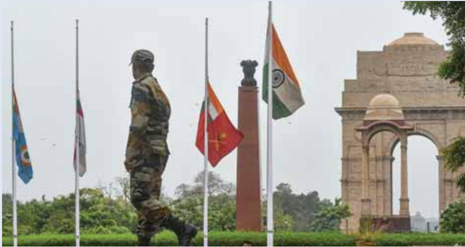
The Indian national flag flies half-mast at the National War Memorial to mourn the death of former Japanese Prime Minister Shinzo Abe, in New Delhi on Saturday.

"We, the leaders of Australia, India, and the United States, are shocked at the tragic assassination of former Japanese Prime Minister Shinzo Abe," US President Joe Biden, Prime Minister Narendra Modi and Australian Prime Minister Anthony Albanese said in a