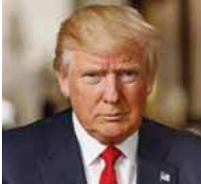
New Jersey Gov. Chris Christie's campaign that year.