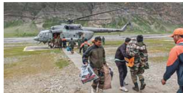
An IAF helicopter engages in rescue and relief operations at cloudburst affected areas near the Amarnath shrine.