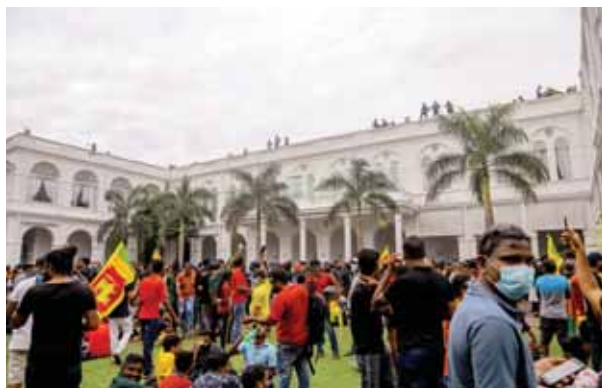
Protesters gather inside the official residence of Sri Lanka's President in Colombo, Sri Lanka on Saturday, demanding that Gotabaya Rajapaksa resign.

Earlier in the day, anti-Government protesters entered