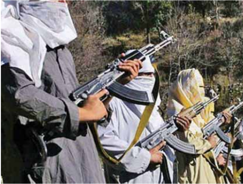
enemies of peace.