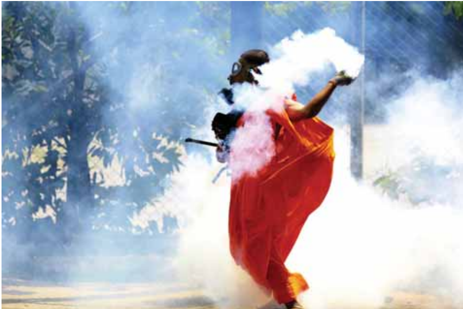
A man throws back a tear gas canister after it was fired by police to disperse protesters in Colombo, Sri Lanka.