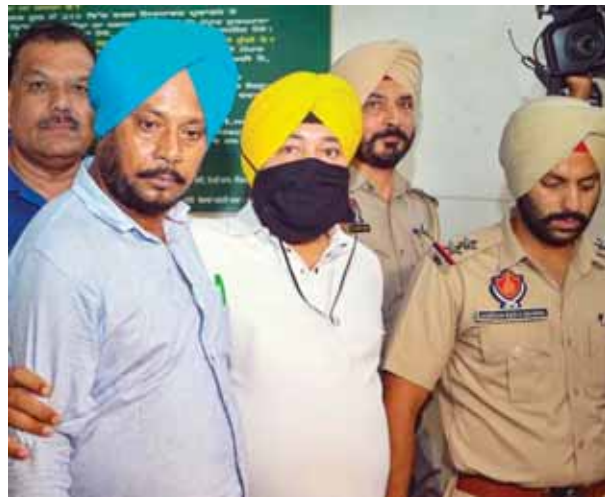
Singer Daler Mehndi being taken to jail after sentencing for his involvement in a human trafficking case, at District Court complex in Patiala on Thursday.