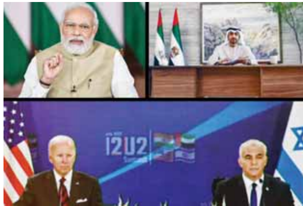
Prime Minister Narendra Modi addresses the I2U2 virtual Summit, in New Delhi, on Thursday

"It is clear that the vision and agenda of I2U2 are progressive and practical," Modi