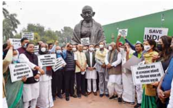
In this file photo Congress MP Rahul Gandhi with other Opposition parties' MPs protest over suspension of 12 Rajya Sabha MPs, during the Winter Session of Parliament. Demonstrations and dharnas will not be allowed in the precincts of Parliament House, as per a new circular by the RS Secretariat on Friday.