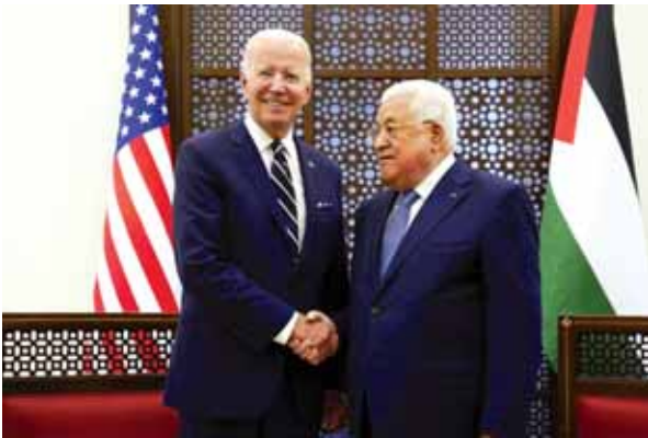
BETHLEHEM (WEST BANK)

US Prez says US wants more on Abu Akleh's death