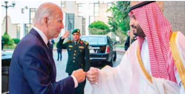
AP ■ JEDDAH

A crucial meeting to repair one of the world's most important diplomatic relationships began with a fist bump Friday as Saudi Crown Prince Mohammed bin Salman welcomed U.S. President Joe Biden at a royal palace.