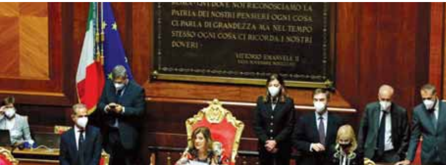
■ ROME

Italy entered into days of political and financial uncertainty Friday as Premier Mario Draghi weighed his options and political leaders considered theirs after coalition ally the 5-Star Movement sparked a crisis by withholding support on a government-sponsored bill.