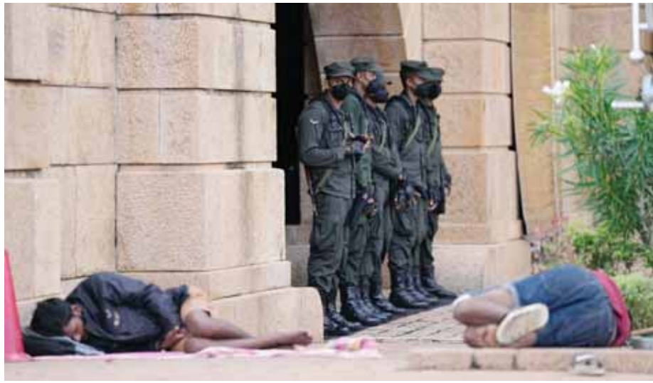
Army soldiers stand guard as protesters sleep by the entrance to the President's office in Colombo, on Friday.

Rajapaksa, currently in Singapore, emailed his resignation to Speaker Mahinda Yapa Abeywardena, who said on Friday that he accepted his resignation, which he received late on Thursday. Rajapaksa's resignation came two days after the embattled leader fled to the