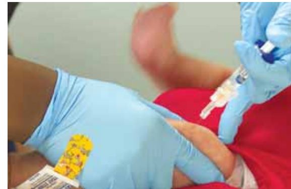
AP ■ GENEVA

About 25 million children worldwide have missed out on routine immunizations against common diseases like diphtheria, largely because the coronavirus pandemic disrupted regular health services or triggered misinformation about vaccines, according to the U.N.