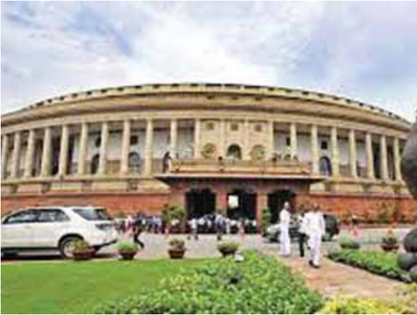
The Opposition meeting is likely to be litmus test of their unity after parties like JMM, Shiv Sena broke ranks to support the NDA nomination Draupadi Murmu in the

for Monsoon Session and deciding on the Vice Presidential candidate is likely to be in full attendance on Sunday. The Government has also called an all-party meeting on Sunday when Prime Minister Narendra Modi is expected to attend. If the Opposition will boycott this meeting or not is not known though. The invite has also been extended to Telangana Chief Minister and the head of Telangana Rashtra Samithi (TRS) K Chandrashekar Rao who during the last one day have reached out to all non-BJP and non-Congress party leaders to galvanise his own political force.