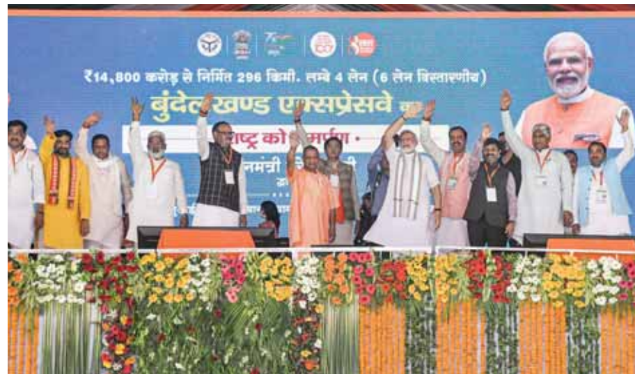
Prime Minister Narendra Modi with UP Chief Minister Yogi Adityanath, UP Deputy Chief Ministers Keshav Prasad Maurya and Brajesh Pathak, and UP BJP president SD Singh during the opening of Bundelkhand Expressway, in Jalaun on Saturday