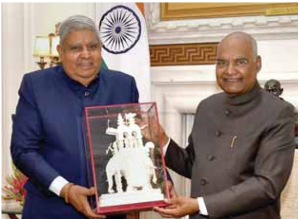
In this file photo, President Ram Nath Kovind poses with West Bengal Governor Jagdeep Dhankhar during a meeting, at Rashtrapati Bhavan in New Delhi

Didi-Dhankhar chemistry was worse than bad