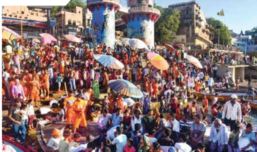
Varanasi: Kanwariyas (Lord Shiva devotees) at the Ganga ghat during the holy month of 'Shrawan', in Varanasi.