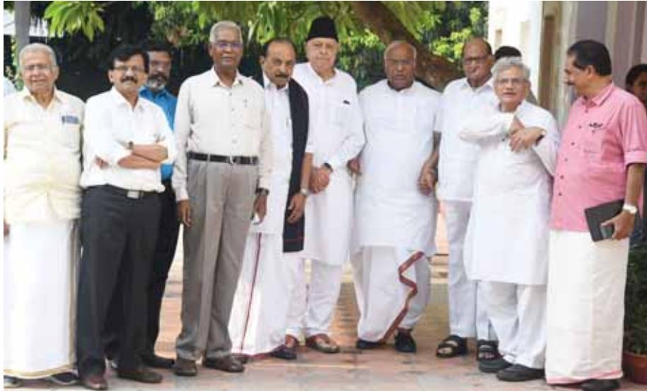
NCP chief Sharad Pawar, CPI(M) leader Sitaram Yechury, Shiv Sena leader Sanjay Raut, CPI leader D. Raja, JKNK Chief Farooq Abdullah and others after electing the combined Opposition parties' candidate for the vice-presidential elections, in New Delhi on Sunday.

candidate of the joint Opposition for the post of the Vice-President of India. I accept this nomination with great humility and thank the leaders of the Opposition for the faith they've put in me. Jai Hind ," Alva tweeted soon after the Opposition parties announced her name.