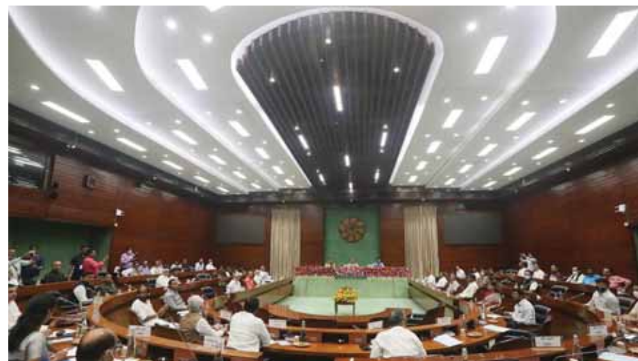
The all-party meeting being held ahead of the Monsoon Session of the Parliament, at Parliament House, in New Delhi, on Sunday.

During an all-party meeting convened on Sunday ahead of the Monsoon Session of Parliament, the DMK and AIADMK demanded that India intervene in Sri Lanka which is