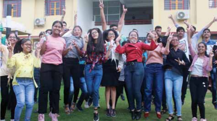
Students celebrate their success after announcement of ICSE Board Class 10th results, at Lt Atul Katarya Memorial School in Gurugram on Sunday

The Indian Certificate of Secondary Education (ICSE) examination was conducted in 61 written subjects of which 20 are Indian languages, nine foreign languages and one Classical language. The CISCE had on Saturday announced that marks of both first and second semesters will be given