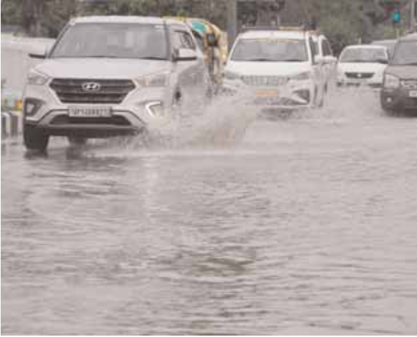
Vehicles ply on a flooded road during monsoon rain

Traffic is affected on the Najafgarh Road near Tooda