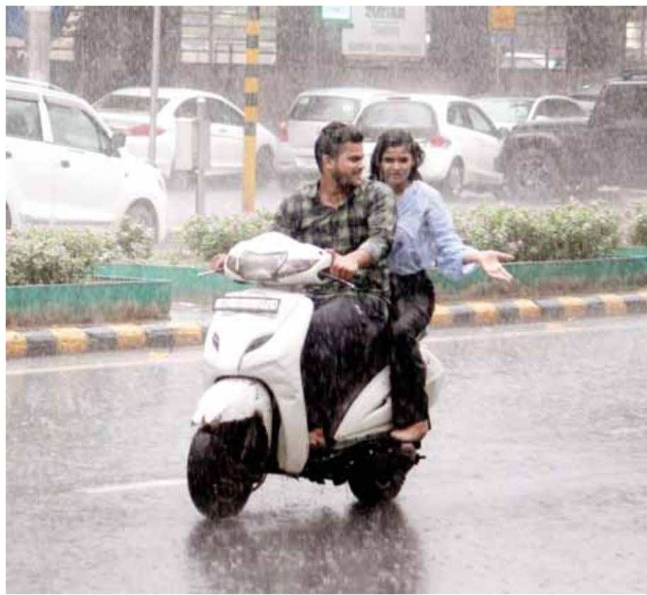
Commuters take a ride in heavy monsoon rain in national Capital on Wednesday