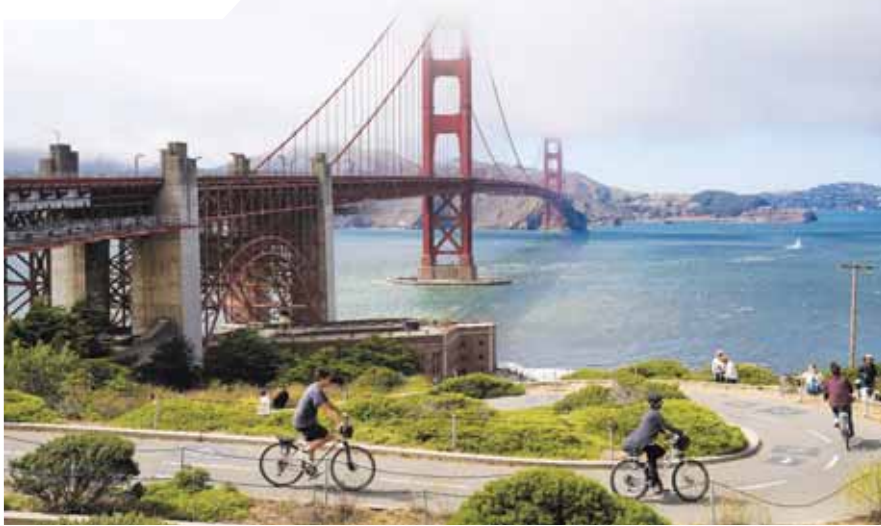
People visit the Golden Gate Bridge in San Francisco