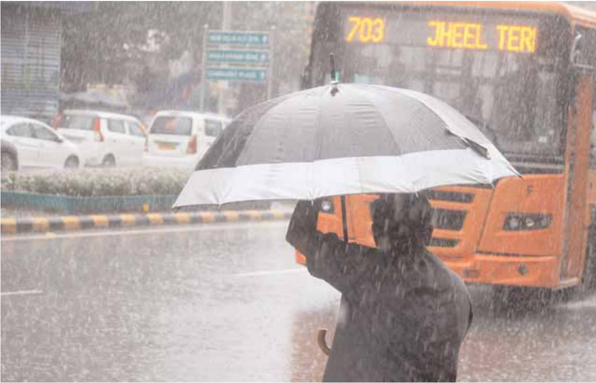
A man tries to protect himself from the rain in the national Capital on Wednesday

At least seven flights were diverted and 40 services were delayed at Delhi airport due to heavy rains. According to sources, at least 25 flight departures and 15 flight arrivals were delayed due to bad weather on Wednesday. Vistara said on Twitter that its two Mumbai-Delhi flights were diverted to other cities—one to Jaipur and another to Indore — due to heavy rains in Delhi. Sources said at least seven flights, including the aforementioned two of Vistara, were diverted to other cities from the Delhi airport.