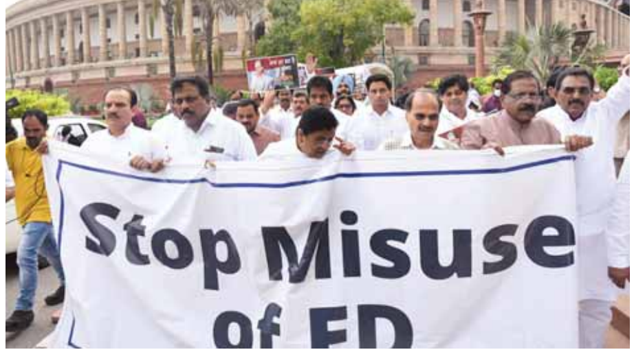
Congress MPs holding banner and placards stage a protest march at Parliament House complex to express their solidarity with the party chief Sonia Gandhi

The Enforcement Directorate (ED) on Thursday questioned Congress chief Sonia Gandhi in a money laundering case related to the National Herald newspaper. The issue of summons to the Congress president rocked Parliament even as the Congress workers took to the street to protest her questioning. The agency summoned her again on July 25 for further questioning, officials said. She was questioned for about two hours and was allowed to leave