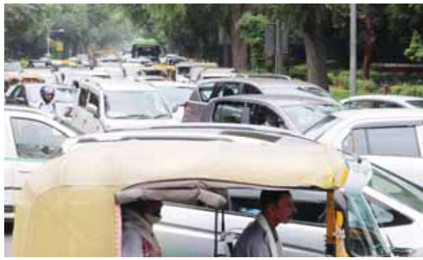
Heavy traffic at Akbar Road in New Delhi on Thursday

The Delhi traffic police announced the restrictions on Wednesday evening on Twitter. Many commuters used the same platform to report the traffic snarls and inconvenience caused because of the jams. Some of them also posted images of vehicles stuck in traffic jams and sought the attention of traffic police officers. The Delhi Police deployed a huge force and barricaded the