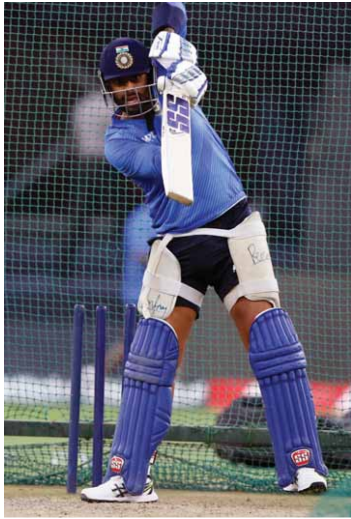
They have struggled to complete their 50-over batting quota in recent times. Since the 2019 World Cup, they have managed to bat full 50 overs just six times in 39 innings and that should be a concern for the side.

The Caribbean side would like to improve upon one crucial aspect.