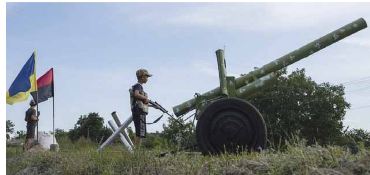
AP ■ KHARKIV (UKRAINE)

Russian shelling pounded a densely populated area in Ukraine's second-largest city Thursday, killing at least two people and injuring at least 21 with a barrage that struck a mosque, a medical facility and a shopping area, according to officials and witnesses at the scene.