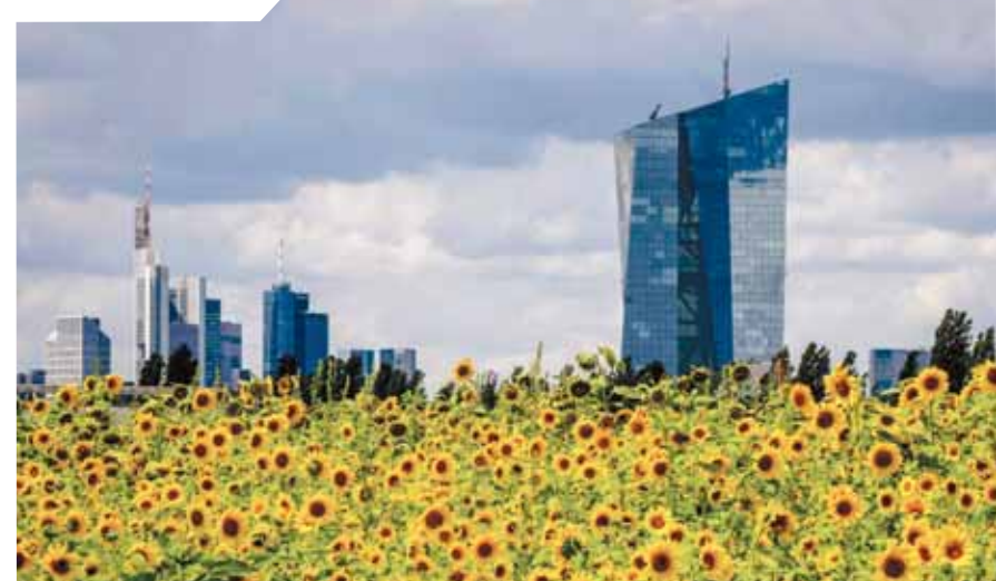
Sunflowers are in full blossom in front of the European Central Bank, in Frankfurt, Germany.