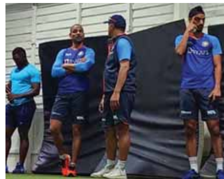
an ODI series last year. Regular skipper Rohit Sharma, senior batter Virat Kohli, Rishabh Pant, star all-rounder Hardik Pandya, Jasprit Bumrah, who led India in the rescheduled fifth Test against England, and Mohammad Shami have all been rested. It has opened a window of opportunity for the likes of Ruturaj Gaikwad, Sanju Samson, Ishan Kishan to make their presence felt.

Dhawan had earlier led India to Sri Lanka for