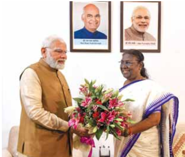
Prime Minister Narendra Modi presents a bouquet to President-elect Droupadi in New Delhi on Thursday

by Yashwant Sinha, value of which was 3,80,177. As the first preference votes secured by Droupadi Murmu was greater than the requisite quota, the Returning Officer, declared Droupadi Murmu duly elected to the Office of the President of India. In every round of counting, she received more than two-third votes. At least 17 MPs from Opposition parties cross-voted in the presidential election in favour of Murmu, sources said. After the announcement of the result, Opposition's presidential nominee Sinha extended best wishes to Murmu. "I join my fellow citizens in congratulating Murmu on her victory in the Presidential Election 2022. India hopes that as the 15th President of the Republic, she functions as the Custodian of the Constitution without fear or favour," Sinha tweeted. He said the issues he raised during his campaign remain pertinent and despite the outcome of the election, he believes it has benefited Indian democracy in two important