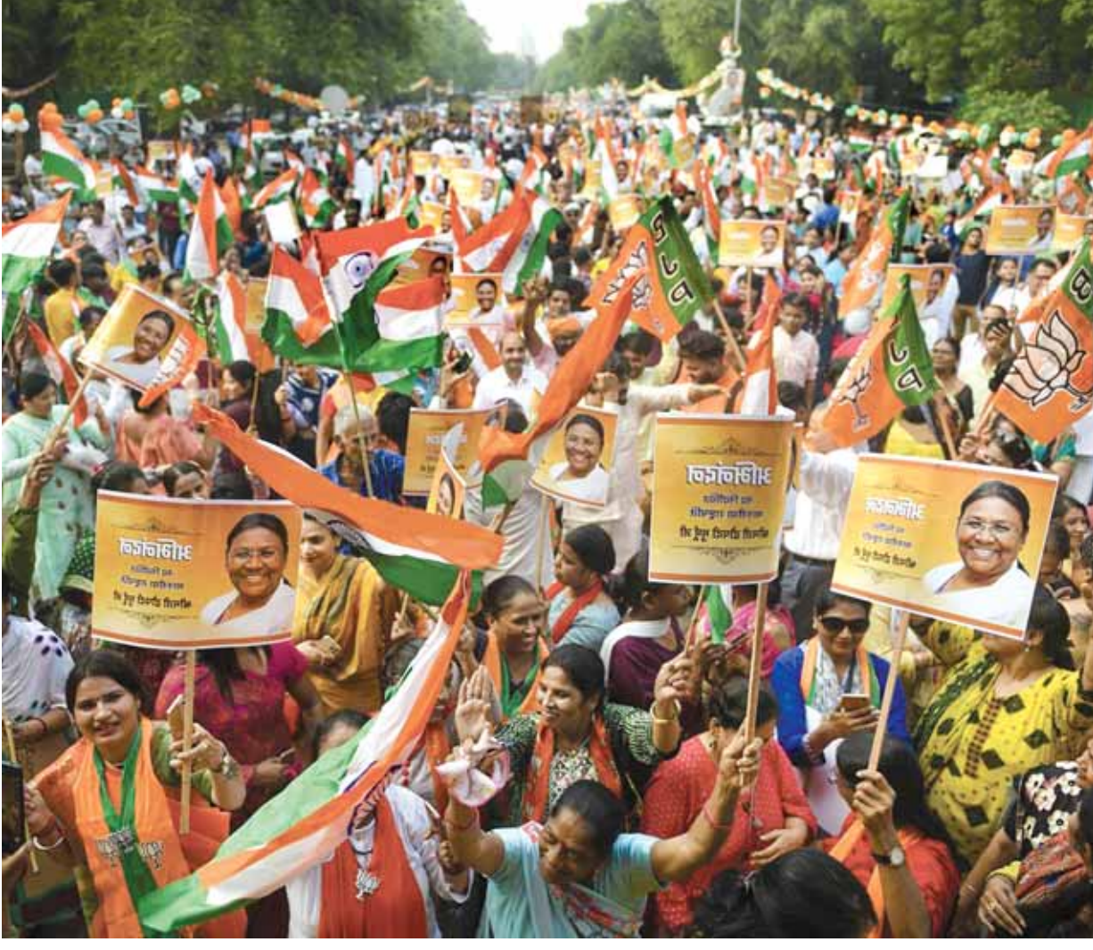
BJP workers and supporters celebrate NDA's presidential candidate Droupadi Murmu's victory in the Presidential elections, in New Delhi, on Thursday

ways. "It brought most Opposition parties on a common platform. This is indeed the need of the hour, and I earnestly appeal to them to continue — indeed, further strengthen — Opposition unity beyond the Presidential election. It must be equally evident in the election of the Vice-President," he said. In his congratulatory message, Prime Minister Narendra Modi said, "Murmu's life, her early struggles, her rich service and her exemplary success motivates each and every Indian. She has emerged as a ray of hope for our citizens, especially the poor, margin-