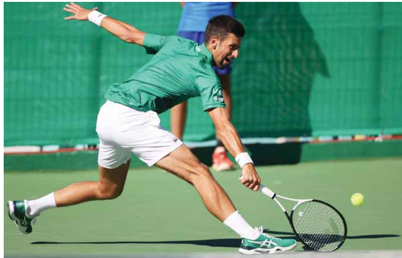
NEW YORK

Serena Williams was included on the entry list for the US Open on Wednesday as was Novak Djokovic even though his refusal to be vaccinated will bar him from entering the country.