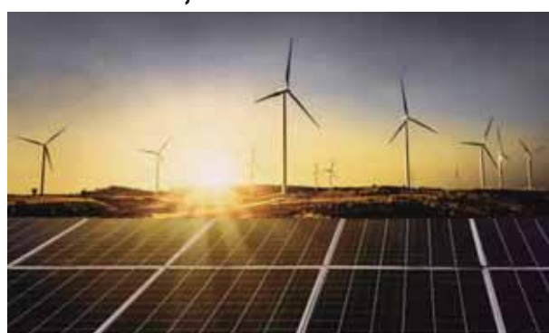
MoS for New and Renewable Energy Khuba said in a reply to the lower house.

The cumulative installed capacity of wind power projects in the country was at 40,788 MW as of June 30, 2022, the