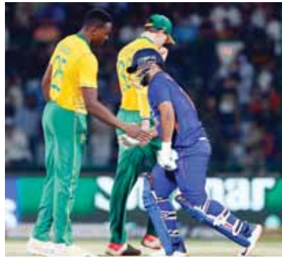
With the BCCI wrapping up the pending series which were postponed due to COVID-19, South Africa are coming for a

The three ODIs will be held in Ranchi (October 6), Lucknow (October 9) and Delhi (October 11).