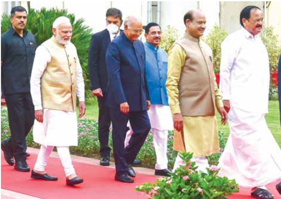
Outgoing President Ram Nath Kovind, Vice President Venkaiah Naidu, Prime Minister Narendra Modi, Lok Sabha Speaker Om Birla and others arrive to attend the farewell function of the outgoing President, at Parliament House Complex in New Delhi on Saturday (Report on Page 4)