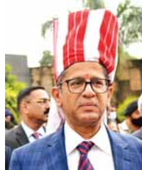
Chief Justice of India NV Ramana during a programme in Ranchi on Saturday

"Of late, we see the media running kangaroo courts, at times on issues even experienced judges find difficult to