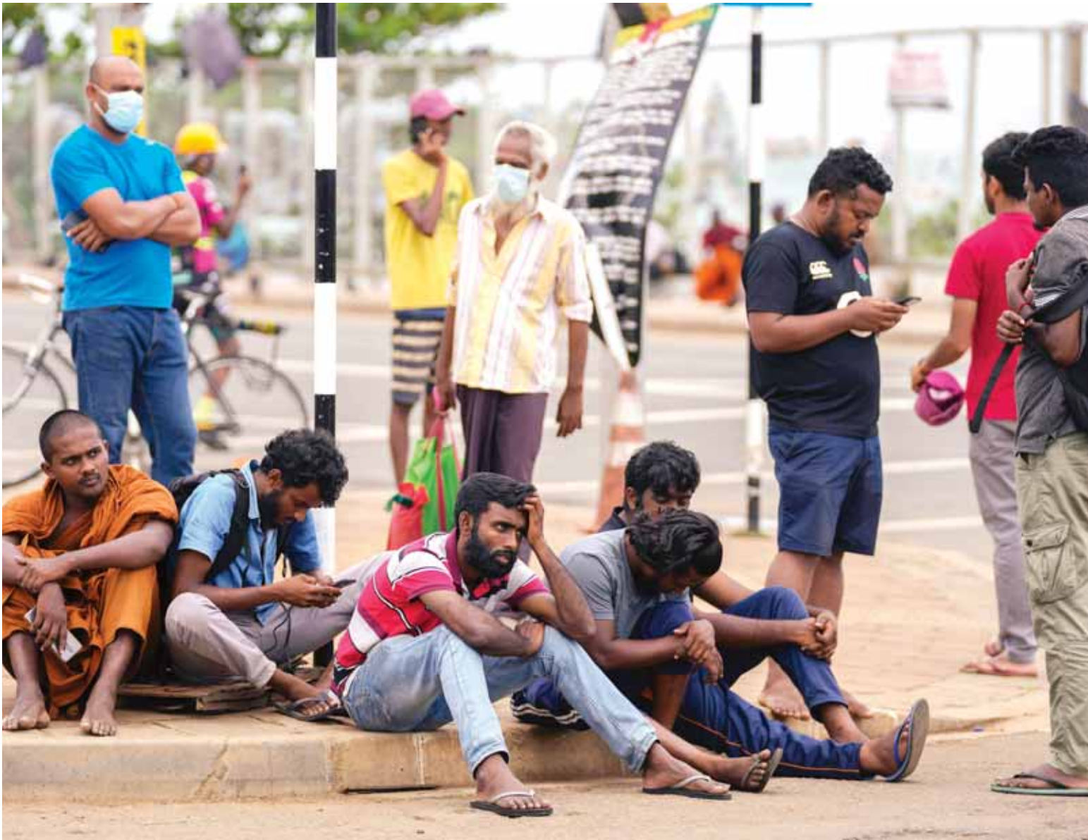
Dejected protesters sit on a street corner after they were evicted by the military from the presidential offices they had occupied for days, in Colombo on July 22, 2022

The worst economic crisis since decades with the powerful Rajapaksa clan being sidelined and angry Lankans venting their anger through protests is yet not over but there are some positive signs, albeit from outside — with the international community rushing to give helping hand to the debt-hit island. India, along with other nations, has extended Lanka credit line on favourable terms apart from supplying millions of dollars worth of rice, milk powder, medicine and other humanitarian aid, as well as diesel fuel and gasoline. But there are lessons to be learnt by other countries from the crisis to keep their economy afloat. On a closer look,