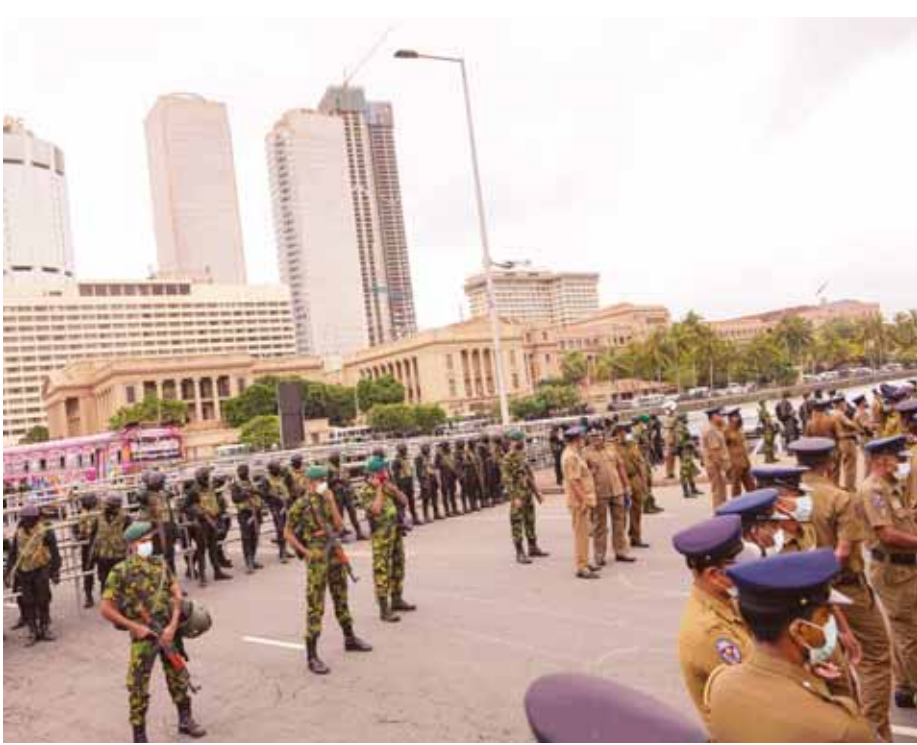
Police and army soldiers man a barricade outside the president's office premises after electing protesters in Colombo on Friday