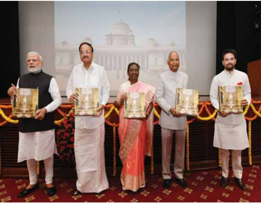
President Ram Nath Kovind receives the first copy of 'Interpreting Geometries: Flooring of Rashtrapati Bhavan' from I&B Minister Anurag Thakur. The book documents and analyses the intricate play of geometry applied to evolve the unique flooring patterns in Rashtrapati Bhavan PNS

Through another order dated October 4, 2018, the High Court had stayed further proceedings by trial court. During course of probe by Ranchi police, two juveniles were also tried but the Juvenile Justice Board through its order on July 6, 2018 acquitted two minor accused.