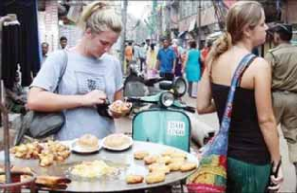
STAFF REPORTER ■ NEW DELHI

The Arvind Kejriwal Government has identified Chandni Chowk, one of the oldest markets which is also known for various popular food joints in Central Delhi and Majnu Ka Tila in north Delhi known for Chinese foods and shopping centres to be developed as food hubs.