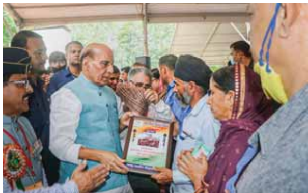
Defence Minister Rajnath Singh felicitates family members of a martyr during a programme commemorating 'Kargil Vijay Divas', in Jammu on Sunday.

Paying glowing tributes to the freedom fighters and the Armed Forces personnel who laid down their lives since Independence in the service of the nation, Rajnath Singh, who was in Jammu on the Kargil Divas said, “The Kargil war underlined the dire need to achieve cohesion and self-