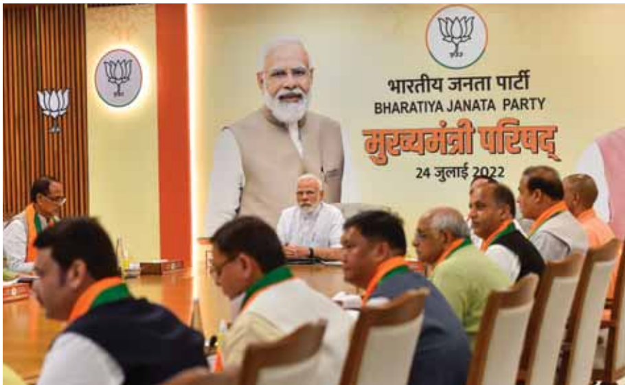
Prime Minister Narendra Modi during the Mukhyamantri Parishad meeting at BJP headquarters in New Delhi on Sunday

The PM participated in the 'Mukhyamantri Parishad' - BJP Chief Ministers' meeting - here at the party headquarters. Chief Ministers and deputy-Chief Ministers of BJP-ruled States attended the meeting presided by party president JP Nadda. The PM sought the Chief Ministers to ensure 'time' implementation' of welfare schemes and benefits reaching-out to the lowest in economic strata. The Assembly polls in several States including Gujarat, Himachal Pradesh,