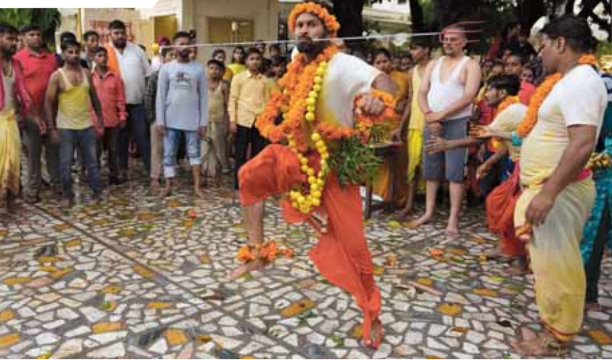
A Hindu devotee dances after piercing a rod as part of a ritual in the temple of goddess Sheetla Mata in Jammu