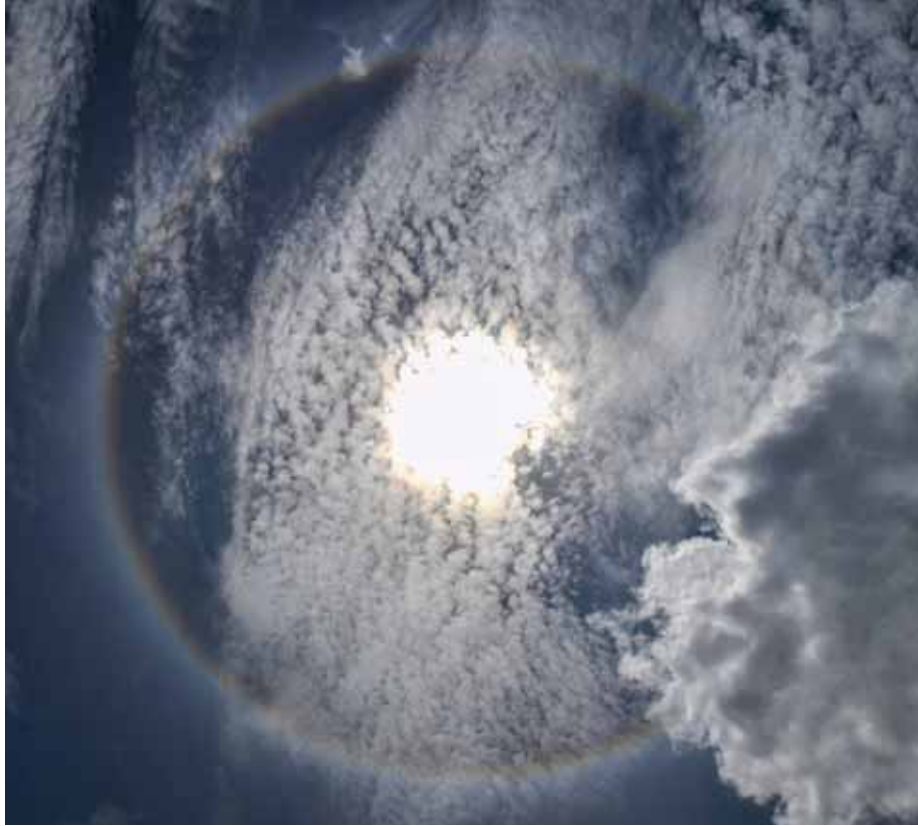
A sun halo is seen in the sky in Dehradun on Sunday.