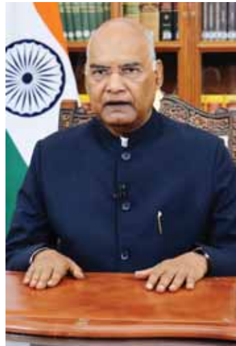
President Ram Nath Kovind addresses the nation on the eve of demitting office, in New Delhi on Sunday.