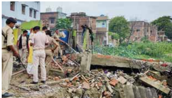
Police inspect the site of a blast in a house where firecrackers were being made illegally in Khoibagh market at Chapra in Saran district on Sunday.