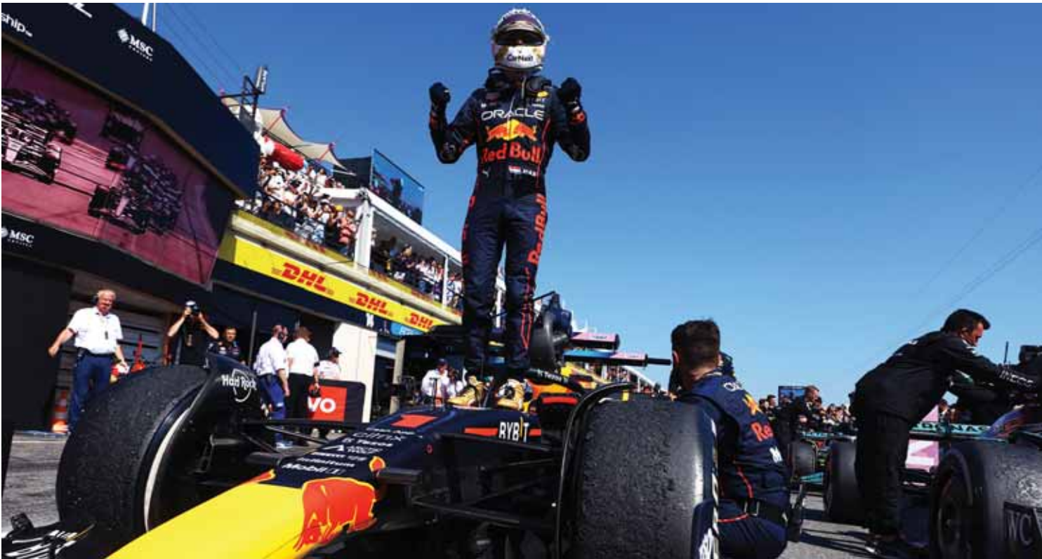
LE CASTELLET

World champion Max Verstappen took full advantage of Charles Leclerc crashing out of the lead to extend his advantage in this year's title race with a crushing victory ahead of Lewis Hamilton in Sunday's sun-baked French Grand Prix.