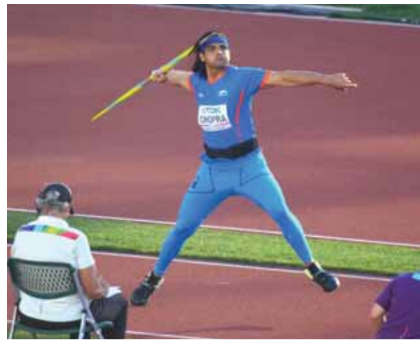
Athlete Neeraj Chopra competes in the men's javelin throw event at the World Athletics Championships, in Eugene, USA. Chopra won the silver medal with his best throw of 88.13m.

Chopra had topped the Group A qualification round and qualified for the final at