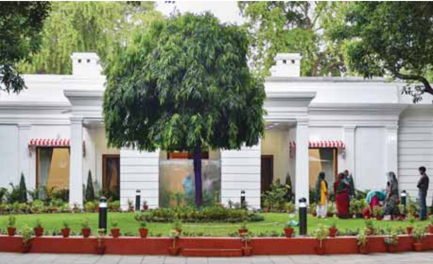
The outgoing President A view of the residence where outgoing President Ram Nath Kovind will stay post-retirement, at 12 Janpath in New Delhi.