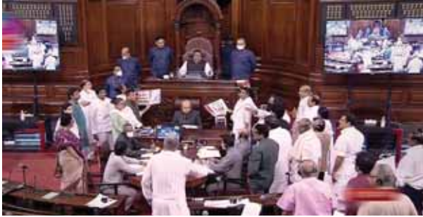
Opposition members protest in the Rajya Sabha during the ongoing Monsoon Session of Parliament, in New Delhi on Monday