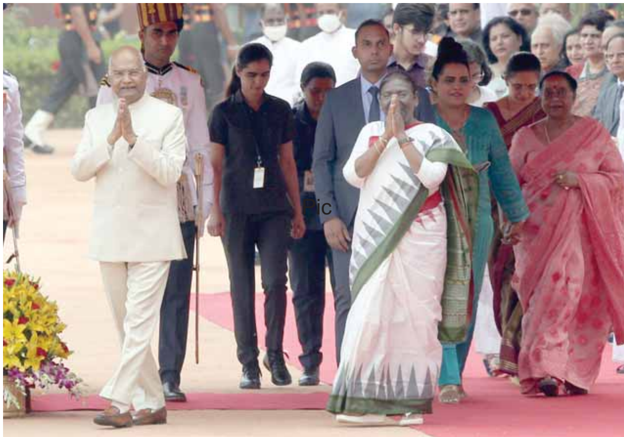
President Droupadi Murmu and outgoing President Ram Nath Kovind greet people after the presentation of the guard of honour by Tri-services personnel at the forecourt of the Rashtrapati Bhavan in New Delhi on Monday

Pratibha Patil, and former BJP president Murli Manohar Joshi too attended the swearing-in ceremony. "Your faith in me has given me strength. I have got this responsibility at such an important time as it is India's 75th year of