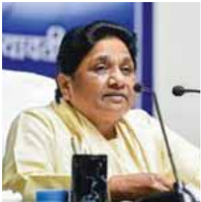
some of the ministers but efforts are on to save some “big fish of this game,” she alleged. Mayawati further targeted the government, claiming that communal and religious issues were raised regularly to disturb communal harmony and that a distorted picture of development was being presented through costly government advertisements. “The BJP government in the state is a victim of internal strife and casteist disturbances. For how long will development continue to be affected by casteism, communalism, cor- ruption and tussle among leaders? Such is the condition of their development claim that the new Bundelkhand Expressway collapsed in just four days,” she said. The former UP CM said that the way the GST tax had been imposed on essential items of daily use was a glaring proof of the anti-poor policy of the government. “Barring a handful of wealthy people, the income of most of the people of the country has declined. People are bearing the brunt of inflation. The price of INR is falling at a record level in the international market and the Central government should take some steps,” Mayawati said. The transfer of doctors in Uttar Pradesh sparked a row after which Deputy Chief Minister Brajesh Pathak had written a letter to the additional chief secretary regarding the implementation of the transfer policy in the department.

PNS ■ LUCKNOW Even as the controversy around the recent transfers in the Health department and PWD in Uttar Pradesh refuses to die down, Bahujan Samaj Party (BSP) chief Mayawati launched a veiled attack on the Yogi Adityanath-led state government claiming that attempts were being made to save “some big fish involved in the game.” She was addressing a meeting of the BSP office-bearers from Gujarat, Maharashtra, Karnataka, Tamil Nadu and Kerala. In a press note issued by the BSP chief on her Twitter handle on Monday, she alleged that people in the state were being harassed due to corruption at every level. “People are now witnessing how the game of corruption is being played in transfers and postings, which has become an industry. The state government has been exposed by