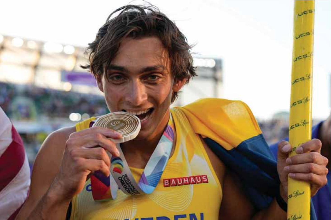
EUGENE

Armand Duplantis wrapped up the World Athletics Championships in Eugene in stunning fashion on Sunday, setting a new world record in the pole vault as the curtain came down on the 10-day global track and field extravaganza. The gripping finale could not have been any better scripted for the first world championships ever to be held on American soil -- apart from the fact maybe that the US-born and raised Duplantis was wearing the yellow and blue of Sweden and not representing the Stars and Stripes.