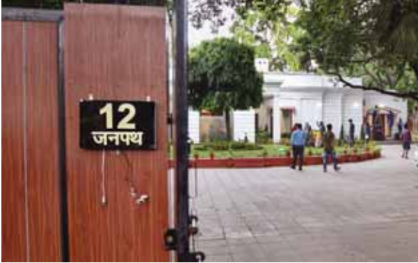
View of the residence where outgoing President Ram Nath Kovind will stay post-retirement, at 12 Janpath in New Delhi.

President Droupadi Murmu, who took oath earlier in the day, accompanied her predecessor as part of convention to his new home which was occupied by former Union minister Ram Vilas Paswan till his death. Following an eviction notice, his son Chirag Paswan vacat-