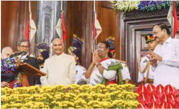
President Droupadi Murmu with outgoing President Ram Nath Kovind, Vice-President M Venkaiah Naidu and CJI Justice NV Ramana during her oath-taking ceremony in the Central Hall of Parliament, in New Delhi on Monday

A row erupted over the seating arrangement for the swearing in ceremony of President Droupadi Murmu on Monday with some leaders claiming Leader of Opposition in the Rajya Sabha M Mallikarjun Kharge was not accorded a seat commensurate with his position. Rejecting it, the government said he was offered a seat in the front row on a par with union ministers. The issue flared up after several opposition leaders wrote to the Rajya Sabha chairman claiming Kharge was not accorded a seat matching his