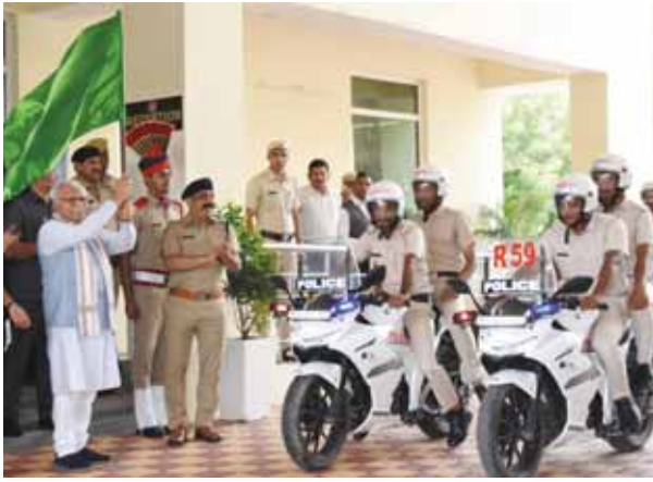
monitoring dashboard will display how many points or places the rider has checked, how many they have not visited, how many places the rider has reached," she added.

new system, every rider has to download the e-beat app on his mobile phone. Those riders mark their attendance by punching on this app by going to the area where their duty has been imposed. The responsibility of identifying and checking sensitive places is given to these riders," she said. The Commissioner also informed that the data of anti-social elements and stolen vehicles has also been mentioned in this app so that these riders will help find the stolen vehicles. "This system will work as a secure, digital, smart and real-time patrolling solution. This is a next-generation patrolling application app on which the