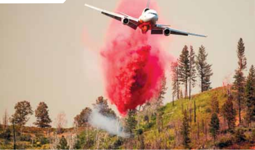
An air tanker drops retardant while trying to stop the Oak Fire in Mariposa County, California