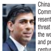
British parliamentarian —Rishi Sunak

Whatever a woman does she lives in the headlines. Whether she has decided to become a mother, or on a holiday. Eyes are always on women's choice.