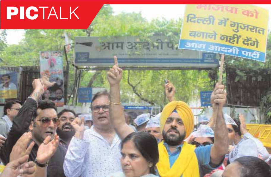
Members of the Aam Aadmi Party stage a protest against the BJP over Gujarat hooch tragedy at the AAP headquarters in New Delhi on Wednesday