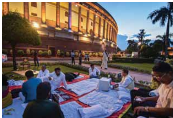
Suspended RS members during a sit-in protest at Parliament House complex in New Delhi, on Wednesday evening

They also suggested that a specific date may be indicated on which the issue of price rise