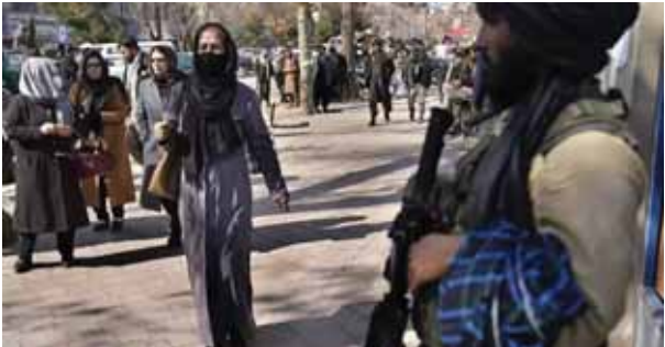
AP ■ ISLAMABAD

The lives of Afghan women and girls are being destroyed by a "suffocating" crackdown by the Taliban since they took power nearly a year ago, Amnesty International said in a report released Wednesday. After they captured the capital, Kabul, in August 2021 and ousted the internationally backed government, the Taliban presented themselves as having moderated since their first time in power, in the 1990s. Initially, Taliban officials spoke of allowing women to continue to work and girls to continue their education. Instead, they formed an all-male government stacked with veterans of their hard-line rule that has banned girls from attending school from seventh grade, imposed all-covering dress that leaves only the eyes visible and restricted women's access to work. Amnesty said the Taliban have also decimated protections for those facing domestic violence, detained women and girls for minor violations and contributed to a surge in