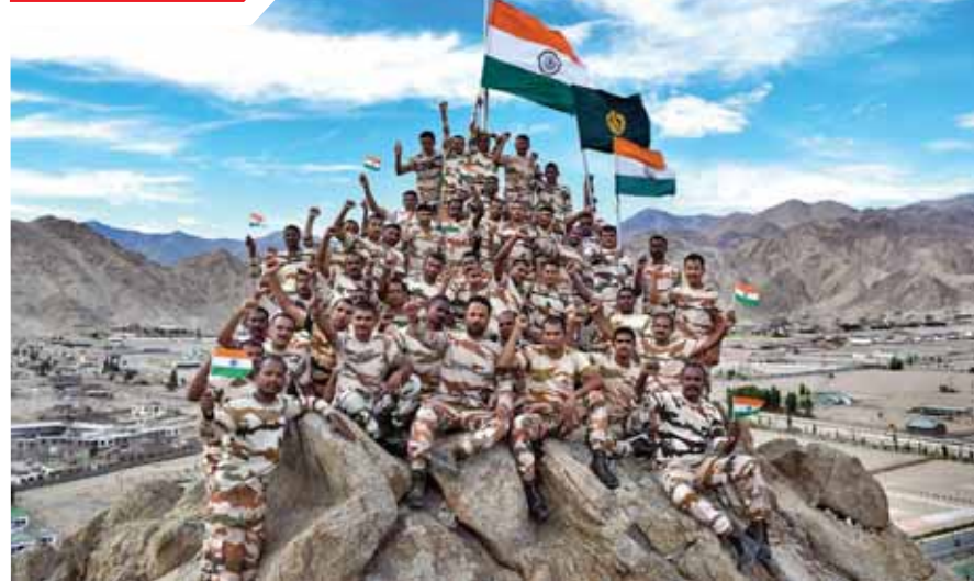
Ladakh: ITBP personnel hoist the tricolour as part of 'Azadi Ka Amrit Mahotsav' Celebrations ahead of Independence day