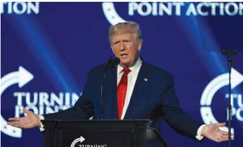
WASHINGTON

Former President Donald Trump returned to Washington for the first time since leaving office Tuesday, vigorously repeating his false election claims that sparked the Jan. 6 insurrection at the nearby Capitol. "It was a catastrophe that election. A disgrace to our country," he said, insisting despite all evidence that he had won in 2020. "We may just have to do it again," he said, repeating as he does in all recent appearances the ever-clearer hints that he will run again in 2024. He recent frequent applause and cheers from his audience, a meeting organized by a group of former White House officials and Cabinet members who have been crafting an agenda for a possible second Trump term. Trump's appearance in the nation's capital — his first trip back since Jan. 20, 2021, when President Joe Biden was sworn into office despite Trump's frantic efforts to remain in power — comes as allies have