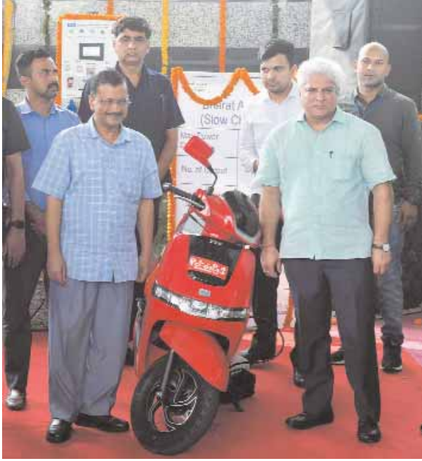
Delhi Chief Minister Arvind Kejriwal and Delhi Transport Minister Kailash Gahlot at the inauguration of Electric Vehicle Charging Stations, at Rajghat Bus Depot in New Delhi on Wednesday

They are free to use technology of their choice,” he said. As per the proposal, the Punjab Government has proposed that it will give Rs 500, Delhi Government will give Rs 500 and the Central Government can give Rs 1.5 thousand. Whenever the Air Quality Commission will take decision, the Delhi Government will implement the same. “We are ready to do everything possible to protect the environment as we are committed to provide a healthy environment to the people of Delhi,” he said. The AAP