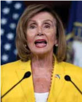
■ SYDNEY

US officials say they have little fear that China would attack Nancy Pelosi's plane if she flies to Taiwan. But the US House speaker would be entering one of the world's hottest spots, where a mishap, mis-step or misunderstanding could endanger her safety. So the Pentagon is developing plans for any contingency. Officials told The Associated Press that if Pelosi goes to Taiwan — still an uncertainty — the military would increase its movement of forces and assets in the Indo-Pacific region. They declined to provide details, but said that fighter jets, ships, surveillance assets and other military systems would likely be used to provide overlapping rings of protection for her flight to Taiwan and any time on the ground there. Any foreign travel by a senior US leader requires additional security. But officials