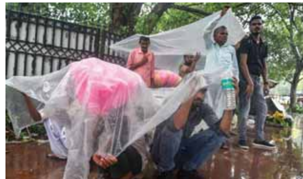
Pedestrians cover themselves with plastic sheets during monsoon rain near India Gate in New Delhi on Friday