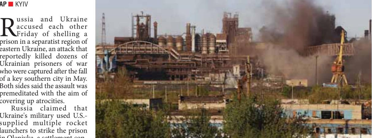
AP ■ KYIV

Russia and Ukraine accused each other Friday of shelling a prison in a separatist region of eastern Ukraine, an attack that reportedly killed dozens of Ukrainian prisoners of war who were captured after the fall of a key southern city in May. Both sides said the assault was premeditated with the aim of covering up atrocities.