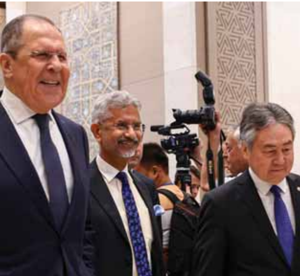
In this handout photo released by Russian Foreign Ministry Press Service, Russian Foreign Minister Sergey Lavrov, left, Indian Foreign Minister Subrahmanyam Jaishankar, centre, and Kyrgyzstan’s Foreign Minister Zheenbek Kulubaev arrive to attend a Foreign Ministers’ meeting of the Shanghai Cooperation Organisation (SCO) in Tashkent, Uzbekistan on Friday

The meeting also reviewed preparations for the upcoming summit of the grouping in Samarkand which is expected to be attended by Prime