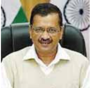
L-G on June 7.