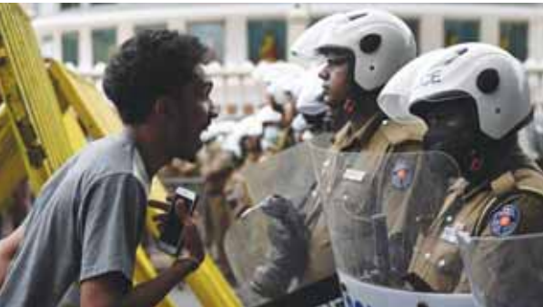
■ COLOMBO

Sri Lankan police carried out searches at the office of the Frontline Socialist Party here on Friday as the new government led by President Ranil Wickremesinghe widens its crackdown on anti-government parties and activists.