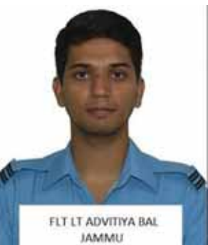
FLT LT ADVITIYA BAL, JAMMU

were killed when their twin-seater MiG-21 aircraft crashed during a training sortie. Reports suggest the two pilots saved scores of civilians of Bhimda village by diverting the aircraft from the populated area. They could have ejected from the plane and it would have crashed into the village with a population of more than 2,500. However, they showed exemplary