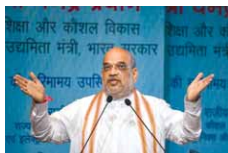
Union Home Minister Amit Shah speaks during the launch of new initiatives on completion of two years of National Education Policy, at Ambedkar International Centre in New Delhi on Friday