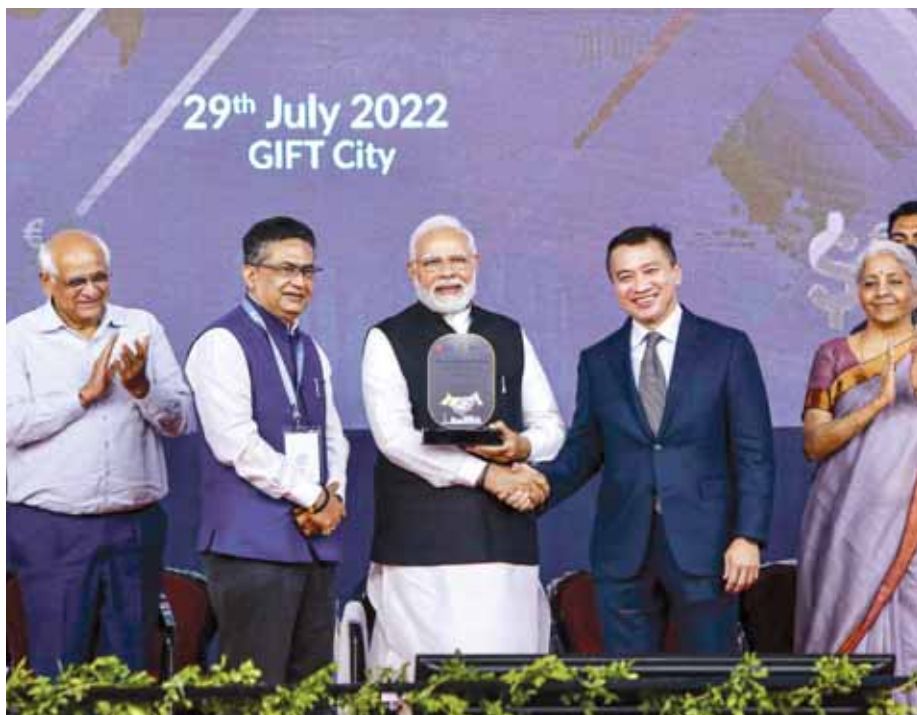
Prime Minister Narendra Modi being felicitated by National Stock Exchange CEO Ashish Chauhan (L) during a ceremony for laying the foundation stone of IIFSCA Headquarters building, launch of India International Bullion Exchange and launch of NSE IFSC-SGX Connect, in Gandhinagar on Friday. Union Finance Minister Nirmala Sitharaman and Gujarat CM Bhupendra Patel are also seen. "India is now in company of countries like the USA, UK and Singapore where new trends in the global financial sector are shaped," said Modi