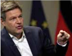
AP ■ ATHENS

Germany’s top diplomat visited refugees at a camp in Greece on Thursday after stressing that European Union countries should do more to safeguard people seeking refuge from war and hardship. German Foreign Minister Annalena Baerbock visited a Holocaust memorial in Athens before sitting down with refugees at a camp west of the