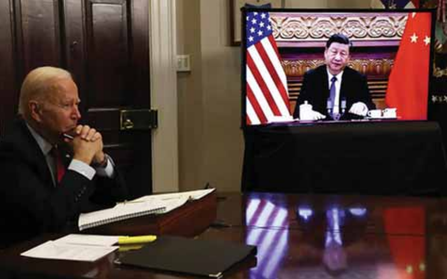
MOSCOW

The Kremlin on Friday offered strong support to China amid the tensions over Taiwan, warning the United States against any “provocative” moves that could exacerbate the situation. Chinese President Xi Jinping warned against meddling in China’s dealings with Taiwan during a phone call Thursday with U.S. President Joe Biden. Speaking in a call with reporters, Kremlin spokesman Dmitry Peskov said that Russia staunchly supports China’s sovereignty and territorial integrity. “We believe that no other country has the right to call (that) into doubt or take any provocative steps,” Peskov said. He warned the U.S. Against “destructive” moves, adding that “such behavior on the international arena could only exacerbate tensions as the world is already overloaded with regional and global problems.” The tough statement reflects close ties between Moscow and Beijing, which have grown stronger since Russia sent its troops into Ukraine on Feb. 24. China has refused to criticize Russia’s action, blaming the U.S. And NATO for provoking Moscow, and has