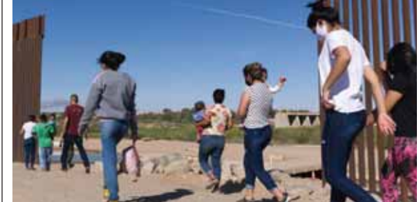
MEXICO CITY