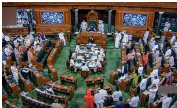
Lok Sabha Deputy Speaker Kirit Solanki conducts proceedings in the House during ongoing Monsoon Session of Parliament, in New Delhi on Friday