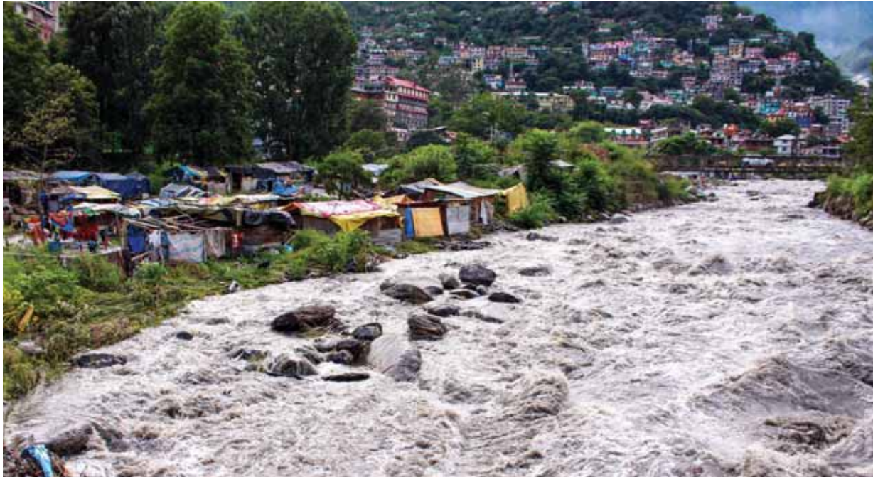
A swollen Sarvari river following incessant monsoon rain in Kullu on Friday

The petitioner sought a court-ordered enquiry into the undue delay in the trial, contending that the public has a right to know about any fraudulent activities a sitting Minister may have been part of.