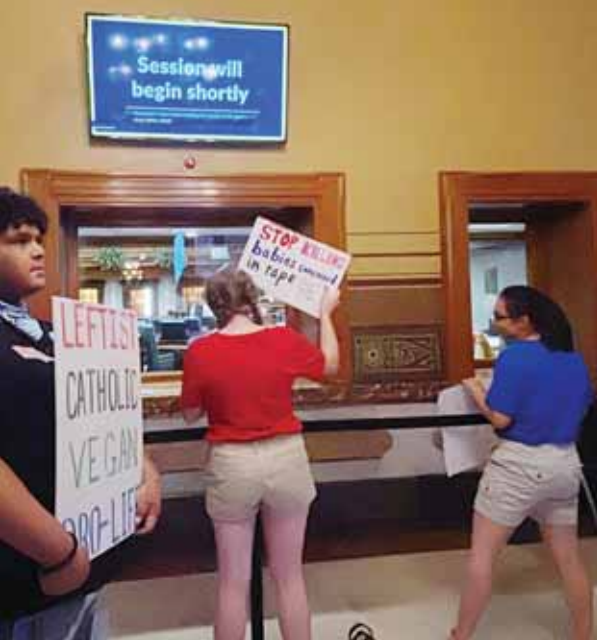
AP ■ INDIANAPOLIS