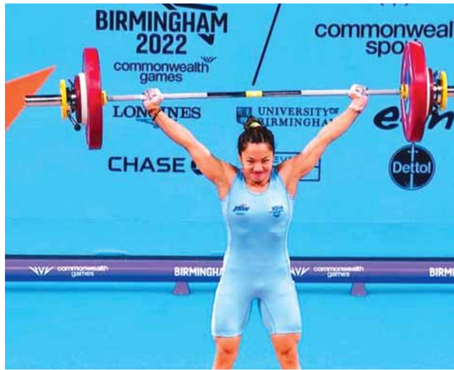
Weightlifter Mirabai Chanu equals the National Record and set the new Games Record and Commonwealth Record in Women's 49kg snatch category with a lift of 88kg