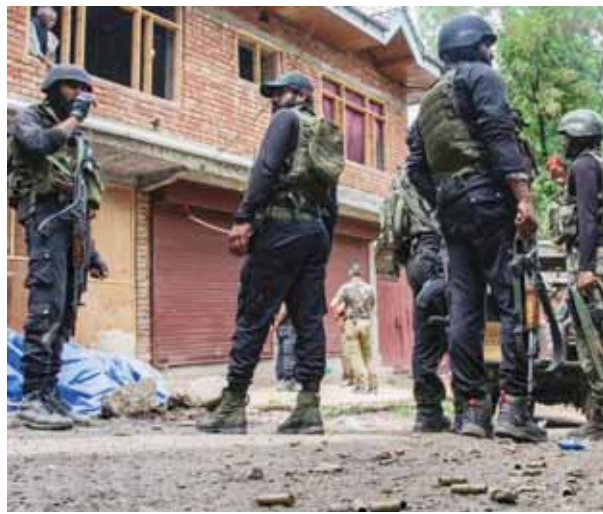
Security personnel at the site of an encounter with terrorists in J&K's Baramulla district on Saturday

of the sniffer dogs was caught in the crossfire and succumbed to injuries on the spot. After the