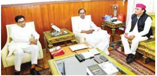
Telangana Chief Minister K Chandrashekar Rao in a meeting with Samajwadi Party president Akhilesh Yadav and Samajwadi Party national general secretary Ramgopal Yadav in New Delhi

as usual” and he reaffirmed the contributions of Marathi to Mumbai which is the pride of Maharashtra and also the country’s commercial capital. “I had no intention to undermine Marathis... they have built Maharashtra by sheer hard work and there are many leading Marathi industrialists here, and are famous not only in the state but all over India and the world. Praising one community does not amount to insulting others,” the Governor said in a statement issued here on Saturday. Koshari reiterated that he was proud of the opportunity to serve the land of Chhatrapati Shivaji Maharaj and the Maharashtrians as the Governor and he had even learnt Marathi in a very short time. The only leader who came to the defence of the Governor was Vanchit Bahujan Aghadi leader Prakash Ambedkar, who said Koshiyari had actually taken a swipe at the character of the Congress, NCP, Shiv Sena and BJP for ruling for many years without doing anything to give Marathis any business, which is still controlled by the Gujaratis-Rajasthanis. “The people of Maharashtra must open their eyes and think whether to continue supporting these parties... The Governor has spoken out his mind and it’s not an insult to the state,” Ambedkar said.