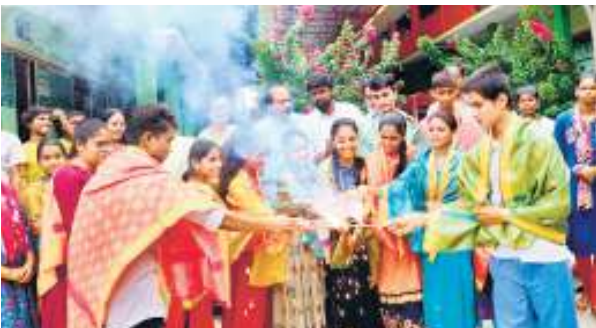
Students bursting crackers as Siddipet district emerges top in 10th class results, in Siddipet on Thursday