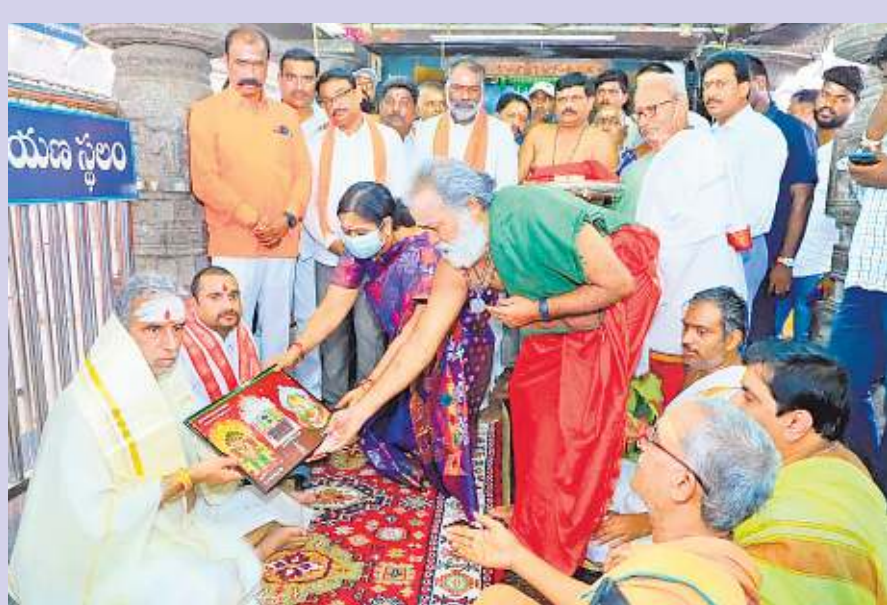
Union Minister of State for Power Krishan Pal Gurjar at Vemulavada temple on Thursday

sources said. The State government is providing financial assistance of Rs 1,00,116 each poor couple under Shaadhi Mubarak and Kalyana Lakshmi scheme. As the banks rejected the cheques, beneficiaries streamed into Tahsildars office at Marriguda with a request to the officials to issue fresh cheques. It is to be seen whether the officials will at least now act and redress the grievances of the people.