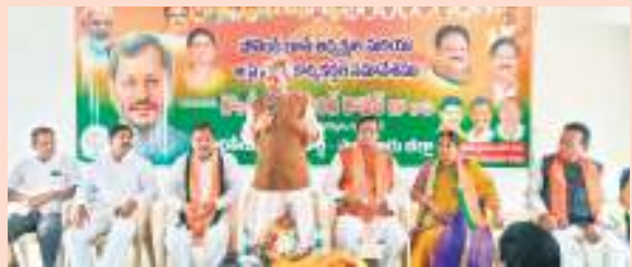
Former Chief Minister of Uttarakhand Tirath Singh Rawat speaking at a meeting in Mahabubnagar on Thursday