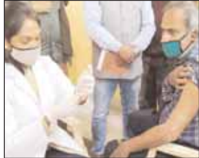
A health worker administers a dose of COVID-19 vaccine to a person in Ranchi.

Also in the last fifteen days this is the second death in the State. This is the second Covid-19 death in the state after June 25. East Singhbhum district registered a fatality due to the infection on that day.