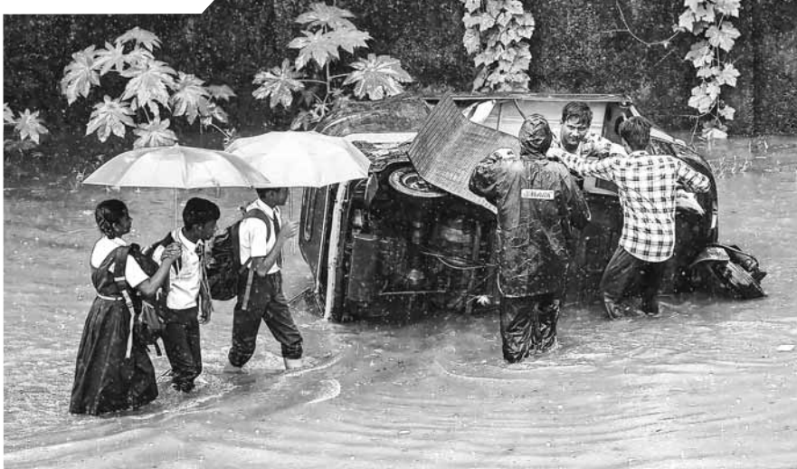
Students walk past as people try to repair an auto-rickshaw on a flooded road amid heavy rain, in Mumbai