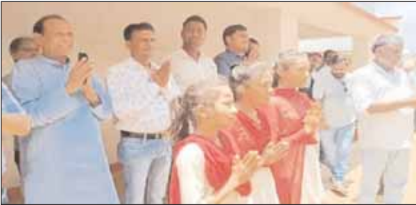
Students and teachers of the Garhwa School during prayer time.