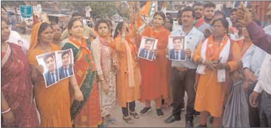
BJP women's cell members burn effigy of SDM Khunti in Khunti on Tuesday.