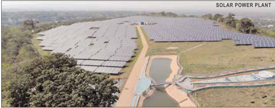
SOLAR POWER PLANT

Noamundi is divided into six watersheds with a total harvesting potential of 5.8 million m3 per year. Based on available area and runoff potential, rain water harvesting structures in five different areas were developed with check dams, saucers ponds, gully plugs, gabion structures are made to stop the runoff water from area and harvested to augment the ground water level of area.