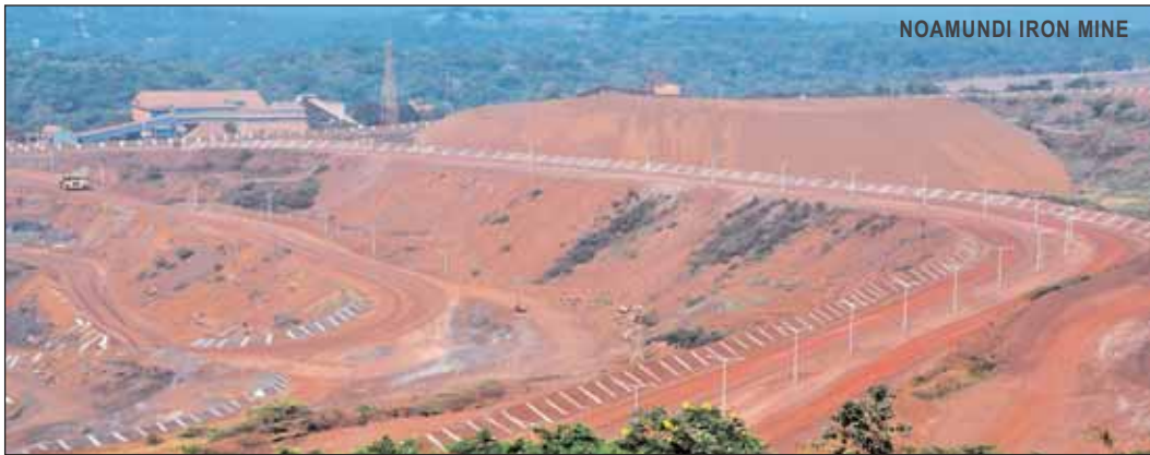
NOAMUNDI IRON MINE

Believing in sustainable development since its beginning, Tata Steel embarked upon the idea to install solar energy since it was facing regular power cuts at its Noamundi mines, which is almost 100 year old. The iron ore deposits were discovered at Noamundi in 1917 and today the mines cover an area of 1,160 hectares with a production capacity of 10 million tonnes per annum.