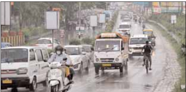
People drive their vehicle during Monsoon rains in Ranchi.

The State Project Director has directed the officials to obtain Aadhaar (UID) from all existing and former enrolled students and if they do not have Aadhaar, then make arrangements for them to get Aadhaar done at Pragma Kendras. The District Level Accounts Officer will take bank related details along with enrollment so that the benefit of DBT can be given to the children.