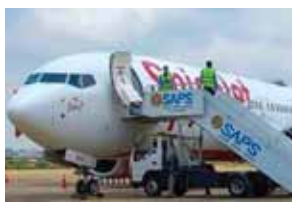
Dubai-bound SpiceJet aircraft after its landing at Karachi Airport

With the latest malfunction, there have been seven such incidents on SpiceJet air-