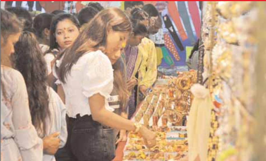
Women purchase home appliances at a stall during the ongoing annual 'Rath Yatra' festival of Lord Jagannath in Ranchi on Tuesday.