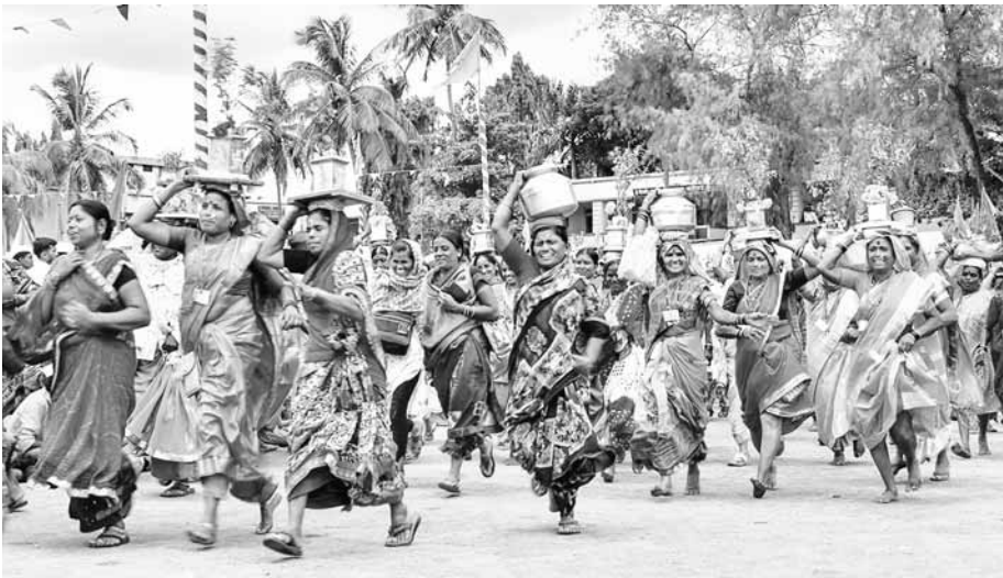
Women of the 'Varkari' movement run with tulsis plant on their head as they participate in 'Gol Ringan' during Sant Tukaram Maharaj Palkhi procession, in Solapur

pendency. Under the scheme, thousands of small, medium and large hospitals are empanelled, majority of which have not received payments since last July. While the Max Group has dues of Rs 200 crore, for Fortis the dues are Rs 100 crore. Likewise, Medanta hospital is waiting for a payment of nearly Rs 60 crore. The CGHS covers all current and retired Central Government staff and kin. The OPD consultation charge for a CGHS beneficiary at most of the empanelled hospitals, including Max, Fortis, Medanta, etc, is Rs 150 per visit, while non-CGHS rates at these hospitals range from Rs 500 to Rs 2,000.