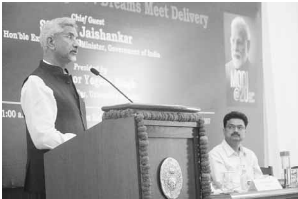
Union External Affairs Minister S Jaishankar during a discussion on the book 'Modi@20: Dreams Meet Delivery', at Delhi University in New Delhi on Tuesday