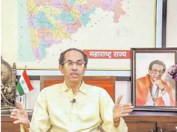
Maharashtra CM and Shiv Sena chief Uddhav Thackeray virtually addresses the people of the State, in Mumbai on Wednesday

On part, Sena president and Chief Minister Uddhav Thackeray played an emotional card as he went live on Facebook and spoke to the people of Maharashtra, where he made it clear: "I have no greed for power. Nor would I remain stuck to the chair. Let the rebel MLAs come and tell me that I am not good enough to hold this position. I will quit