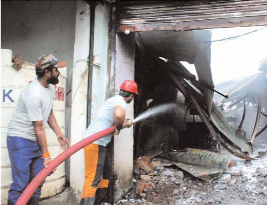
Fire personnel douse flames after a fire breaks in a transformer section at MPEB office at Chandbad locality in Bhopal on Wednesday.

In the meeting, discussion was held to ensure the use of Samagra in various beneficiary-oriented schemes, to create a single form to provide the benefits of various schemes, to give the right to provide services of various departments by a level competent officer and to develop the entire process of making marriage certificate on the Samagra portal.