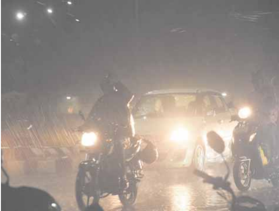
Commuters travel on roads during rain in Bhopal on Wednesday.

Guwahati: The flood situation in Assam remained grim on Wednesday as 12 more people were killed and 55 lakh people affected across 32 districts with the rising Brahmaputra and Barak rivers inundating new areas, officials said.