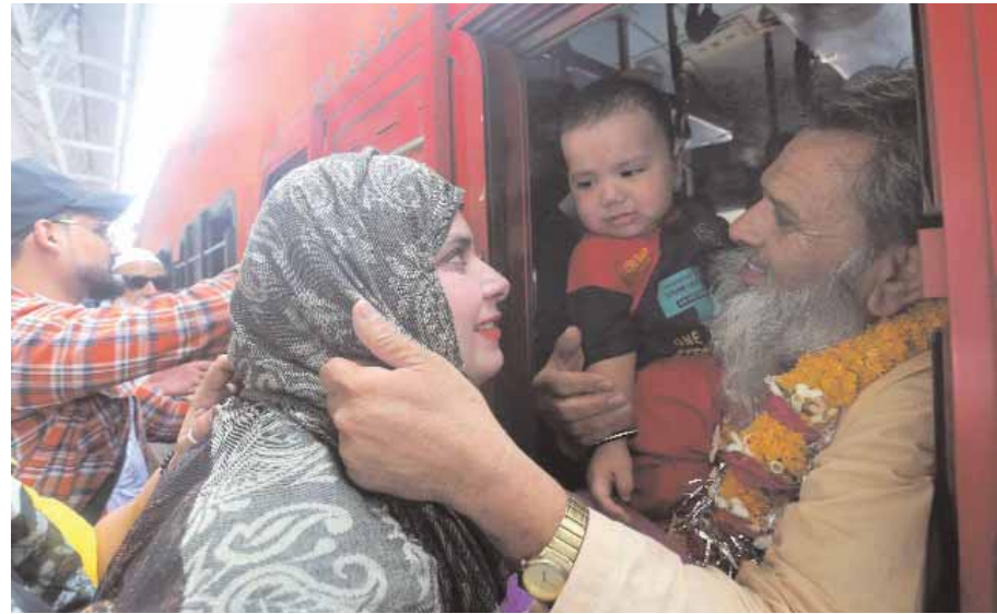
Family members and relatives bid farewell to Hajj pilgrims as they board a train to leave for their annual journey to Mecca shrine, at Railway Station in Bhopal on Wednesday. First batch of Hajj pilgrims left by a train.

Also, according to Ayurveda, the treatment of many diseases is possible with the banyan tree. Karanj is considered important in Ayurvedic medicine. It is also used in religious works. Moulshree is a medicinal tree, it has been used in Ayurveda for centuries. Its bright green leaves, beautiful texture of the tree captivate the people.