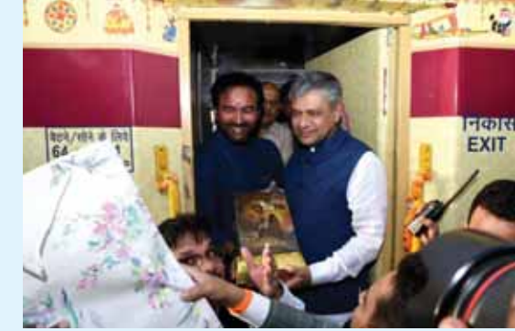
Union Minister for Railways, Communications, Electronics and Information Technology, Ashwini Vaishnav, and the Union Minister for Culture, Tourism and Development of North Eastern Region (DoNER), G. Kishan Reddy flag off 'Bharat Gaurav Tourist Train' on Shri Ramayan Yatra, in New Delhi on Tuesday

"DIAL has a 7.84 MW solar power plant on the airside, whereas as part of stakeholder collaboration, operators of the Cargo terminals at Delhi Airport have added another 5.3 MW rooftop solar power plant," DIAL said.