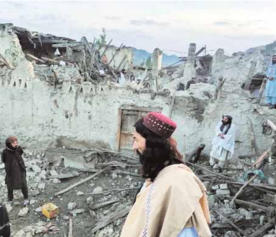
In this photo released by a set-run news agency Bakhtar, Afghans look at destruction caused by an earthquake in the province of Paktika, eastern Afghanistan, on Wednesday