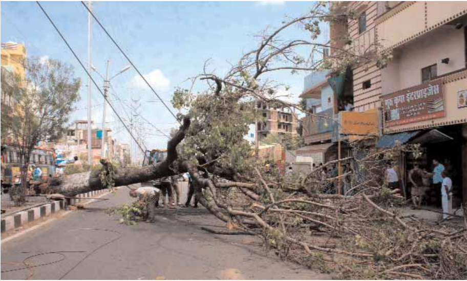
A tree uprooted and fell down blocking a road at 80 feet road Ashoka Garden locality in Bhopal on Wednesday.

Devaranya Yojana is being implemented by the Department of Agriculture, Horticulture, AYUSH and Panchayat and Rural Development along with the Forest Department. It was informed that initially the scheme is being implemented in Anuppur, Narmadapuram, Satna, Jabua, Dindori, Betul and Sehore. Projects related to lemongrass and pomarosa at Anuppur, asparagus, stevia, moringa, tukumari and lemongrass at Narmadapuram are planned for implementation. The crop of medicinal plants is being grown by 132 self-help groups of 21 development blocks of the state by Madhya Pradesh State Rural Livelihood Mission. Cultivation of Amla, Surjana, Ashwagandha, Safed Muesli, Isabgol and Stevia is being encouraged in Dhar, Jabua, Mandla, Anuppur, Umaria, Sehore, Alirajpur and Sheopur. Companies like Dabur, Maharishi Ayurveda, Omni Active, Botanic Health, Natural Remedies, Cipla and Emami have been approached for market linkages of medicinal plants. Arrangements have been made to make training available from Krishi Vigyan Kendras, Universities, Research Centers, to farmers for preparation of high quality plants, seeds and product testing from Facilitation Centers and cultivation of plants, extraction of medicinal drugs, processing, storage, packaging and marketing.