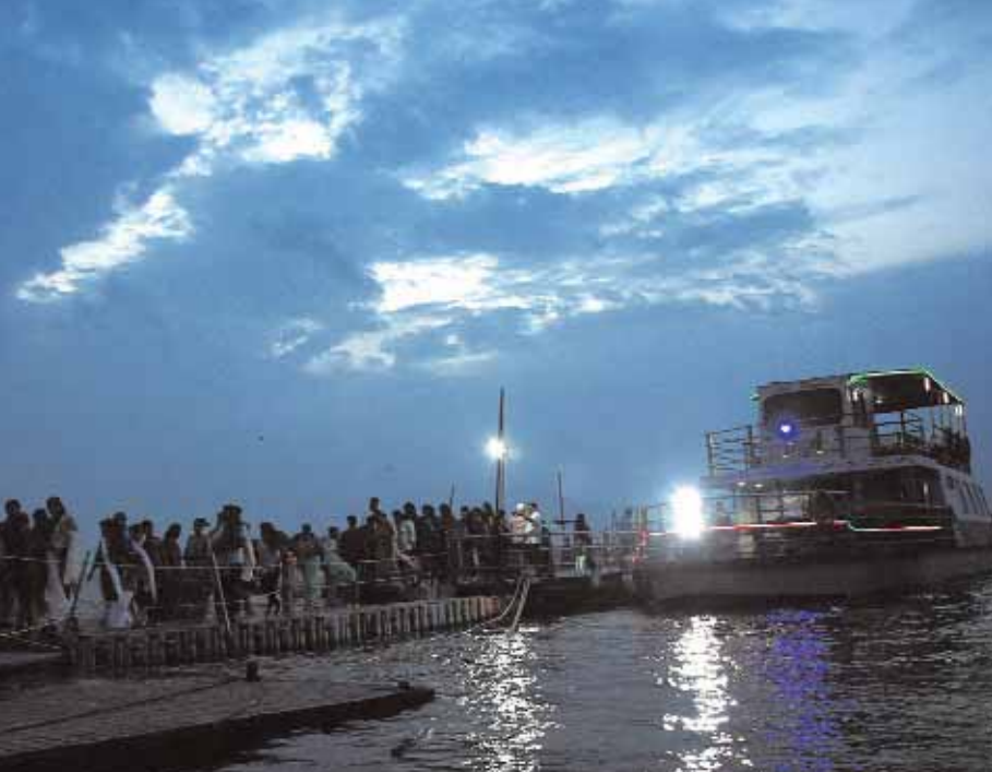
Visitors move for a cruise boat ride on a cloudy evening at Boat Club Upper Lake, in Bhopal on Wednesday. Later, it rained cats and dogs in the evening.

from different fields. PM Gati Shakti will develop a system for strengthening and better coordination of overall infrastructure, including Roads, Water Resources, Energy, Industry, Urban Development and Housing and Food and Civil Supplies departments. 27 officers from different departments of the state attended the training held at Bhaskaracharya National Institute for Space Application and Geo Informatics, Gandhi Nagar, Gujarat. They will conduct capacity development activities at various levels in the state. The Industrial Policy and Investment Promotion Department is the nodal department of PM Gati Shakti in the state.