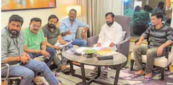
Rebel Shiv Sena leader Eknath Shinde with other MLAs at a hotel in Guwahati on Wednesday

Shinde's reaction came hours after Chief Minister Uddhav Thackeray reached out to the rebels, saying he would quit his post if even one Sena MLA comes and tells him on his face that he was incompetent. The Sena strongman, a Cabinet minister, said the MVA, formed in