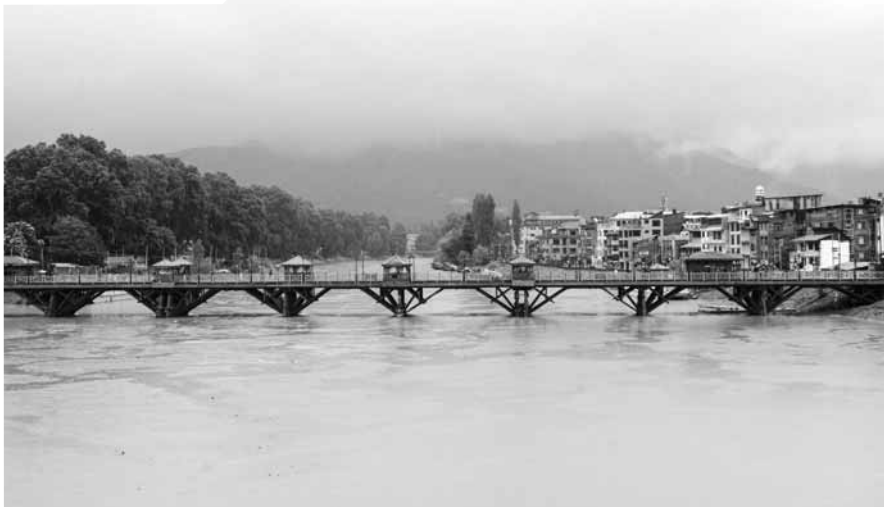
A view of the swollen Jhelum river following incessant rain, in Srinagar