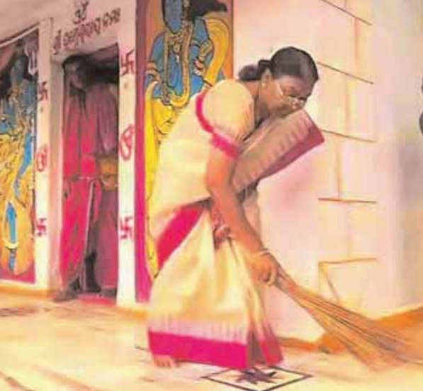
Jharkhand ex-Governor and NDA's Presidential candidate Draupadi Murmu sweeps at Purnandeswar Shiv temple in Rairangpur, Mayurbhanj, on Wednesday