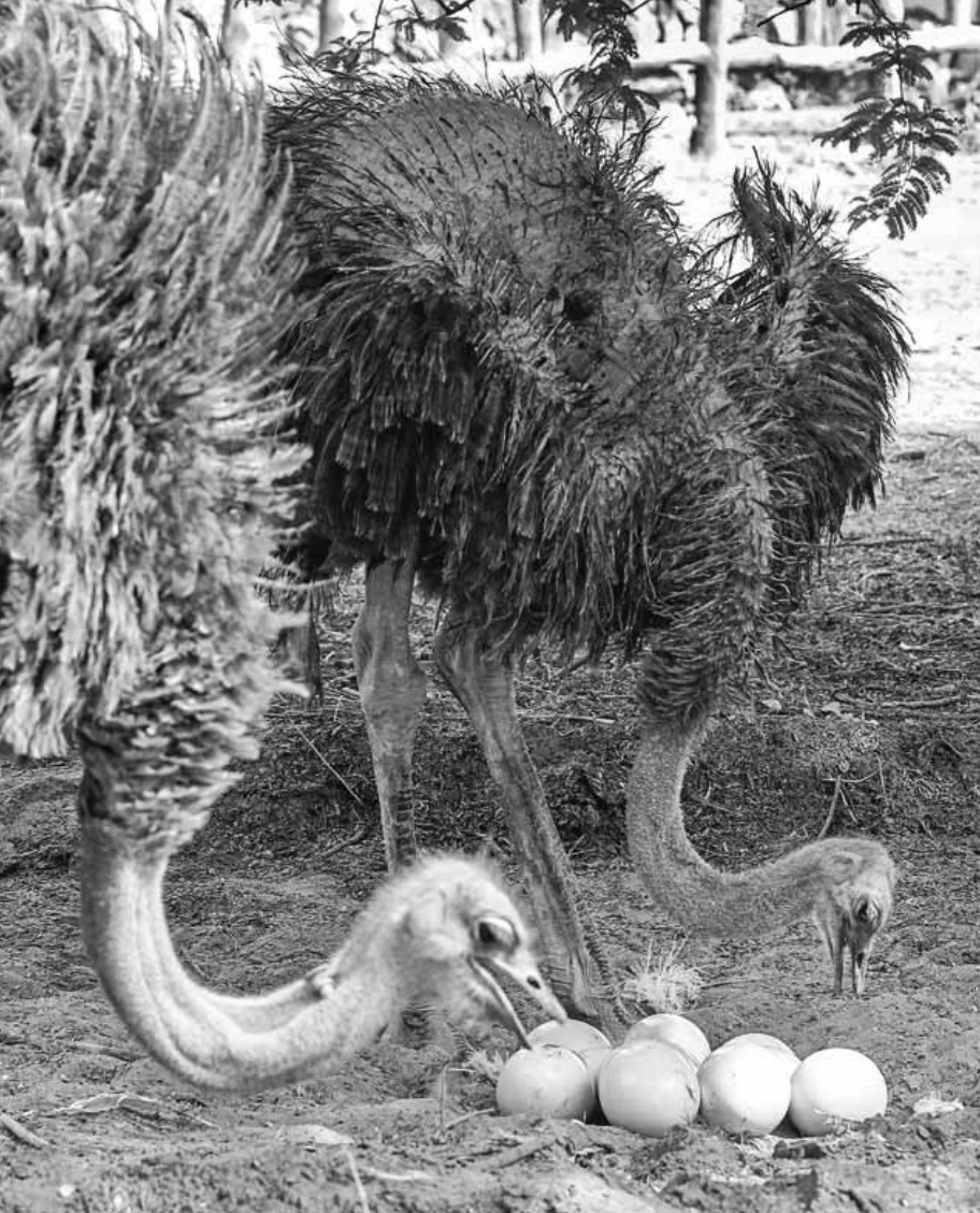
A pair of ostrich attend to their eggs at the Jaipur Zoo, in Jaipur on Wednesday.